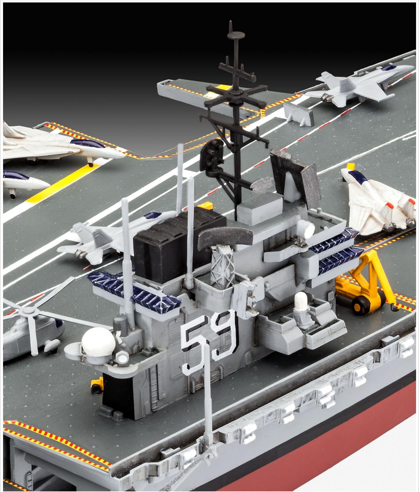
Image 4.3.1: Detailed view of the model's island, showing radar masts, antennas, and the number '59'. This is a complex sub-assembly.

Proceed with attaching the flight deck sections to the hull. Pay close attention to alignment to ensure a flat and even surface. Next, assemble the island (superstructure) components.