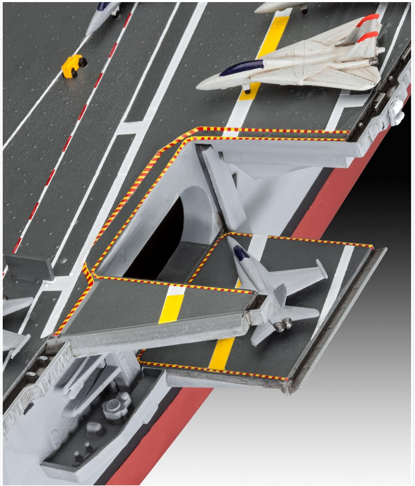
Image 4.3.2: Close-up of an aircraft elevator in a lowered position, demonstrating the detail and potential articulation of certain model features.

Attach the various radar masts, antennas, and other small details to the island before securing it to the flight deck. Some parts, like the aircraft elevators, may be movable.