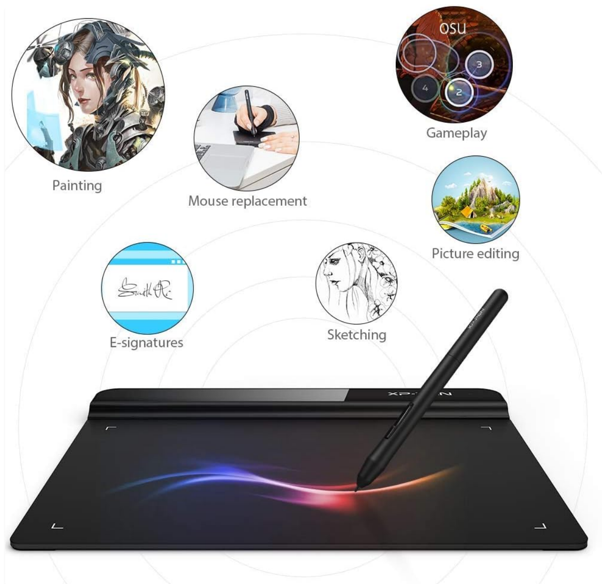
An illustration demonstrating the versatile uses of the XPPen StarG640 tablet for digital painting, replacing a mouse, gaming (osu!), photo editing, and electronic signatures.