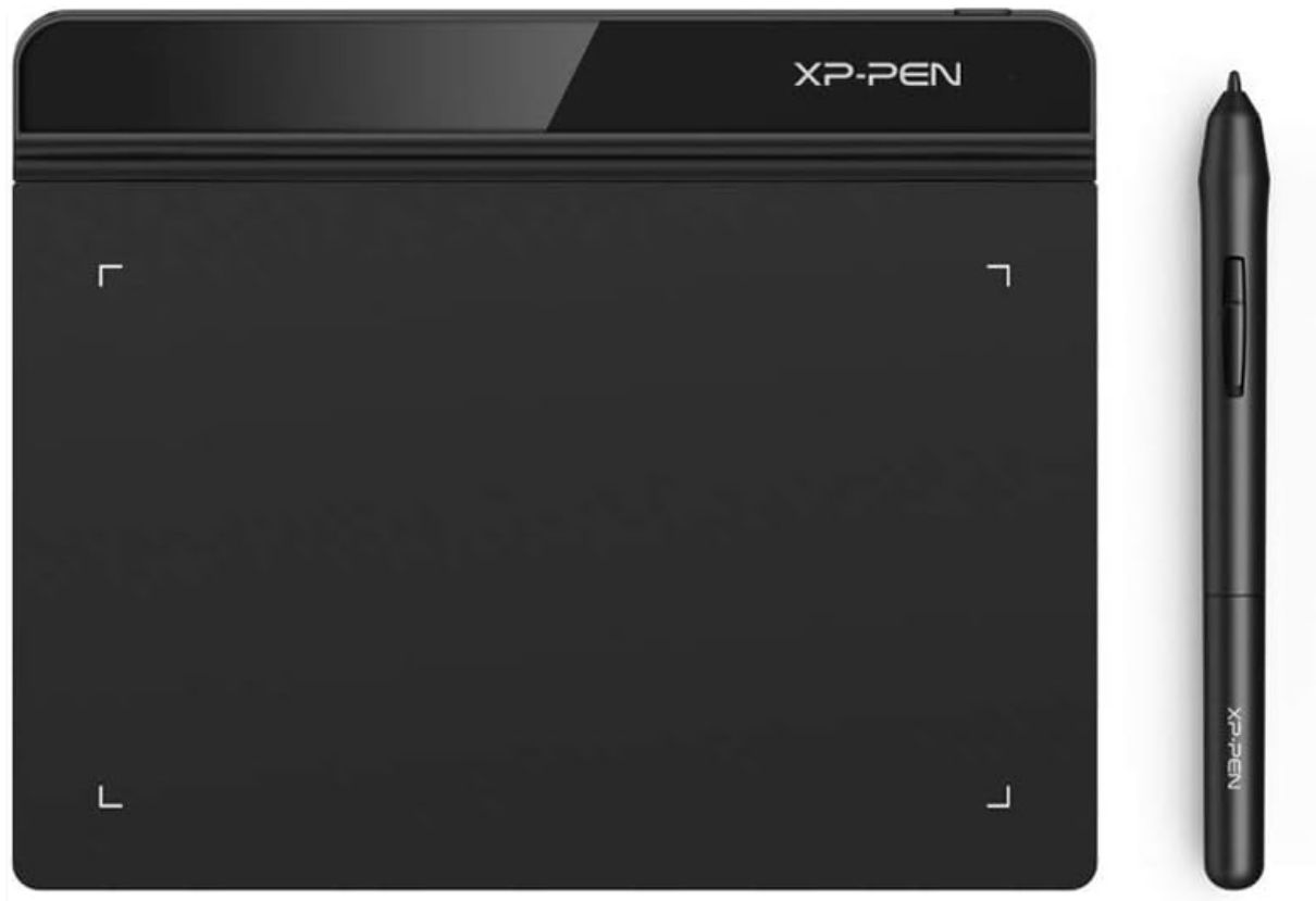
The XPPen StarG640 Digital Graphic Tablet, shown alongside its battery-free stylus pen.

The XPPen StarG640 Digital Graphic Tablet is a versatile tool designed for digital drawing, painting, sketching, e-signatures, online teaching, remote work, and photo editing. It features a battery-free stylus and wide compatibility with various operating systems and software, offering a natural and efficient digital input experience.