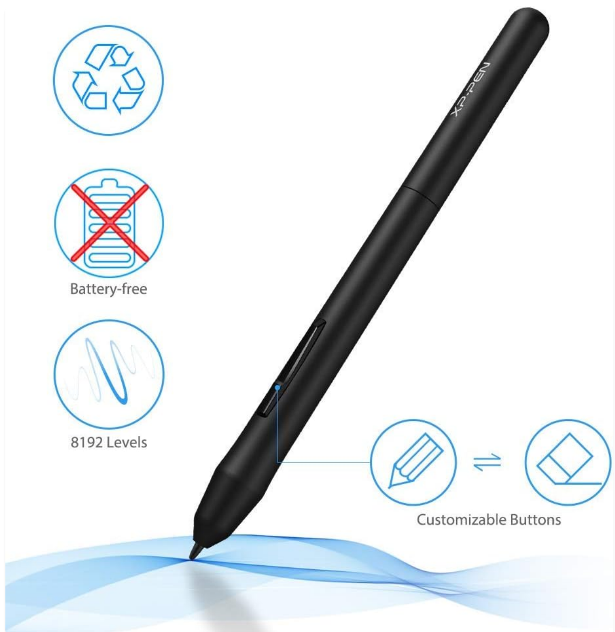
Close-up of the XPPen PN01 battery-free stylus, highlighting its 8192 pressure sensitivity levels and customizable side buttons.