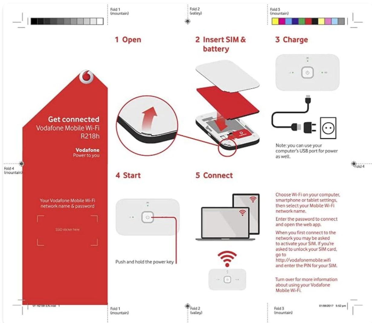
Figure 2: Setup guide for the Vodafone Huawei R218h, illustrating the process from opening the device to connecting to Wi-Fi.