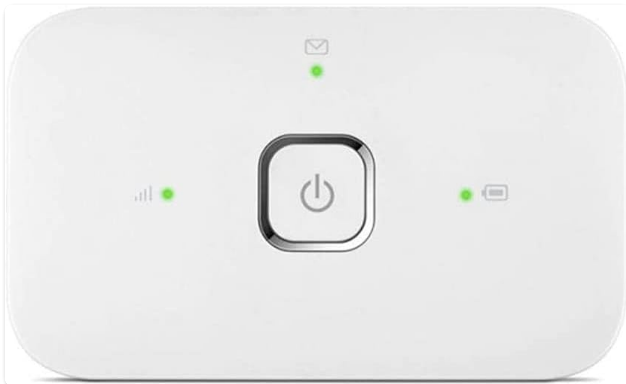
Figure 1: Front view of the Vodafone Huawei R218h device, showing the power button and status indicators.

This user manual provides comprehensive instructions for setting up, operating, and maintaining your Vodafone Huawei R218h mobile broadband device. This device allows you to create a portable Wi-Fi hotspot, providing internet access for multiple devices using a 4G LTE connection.