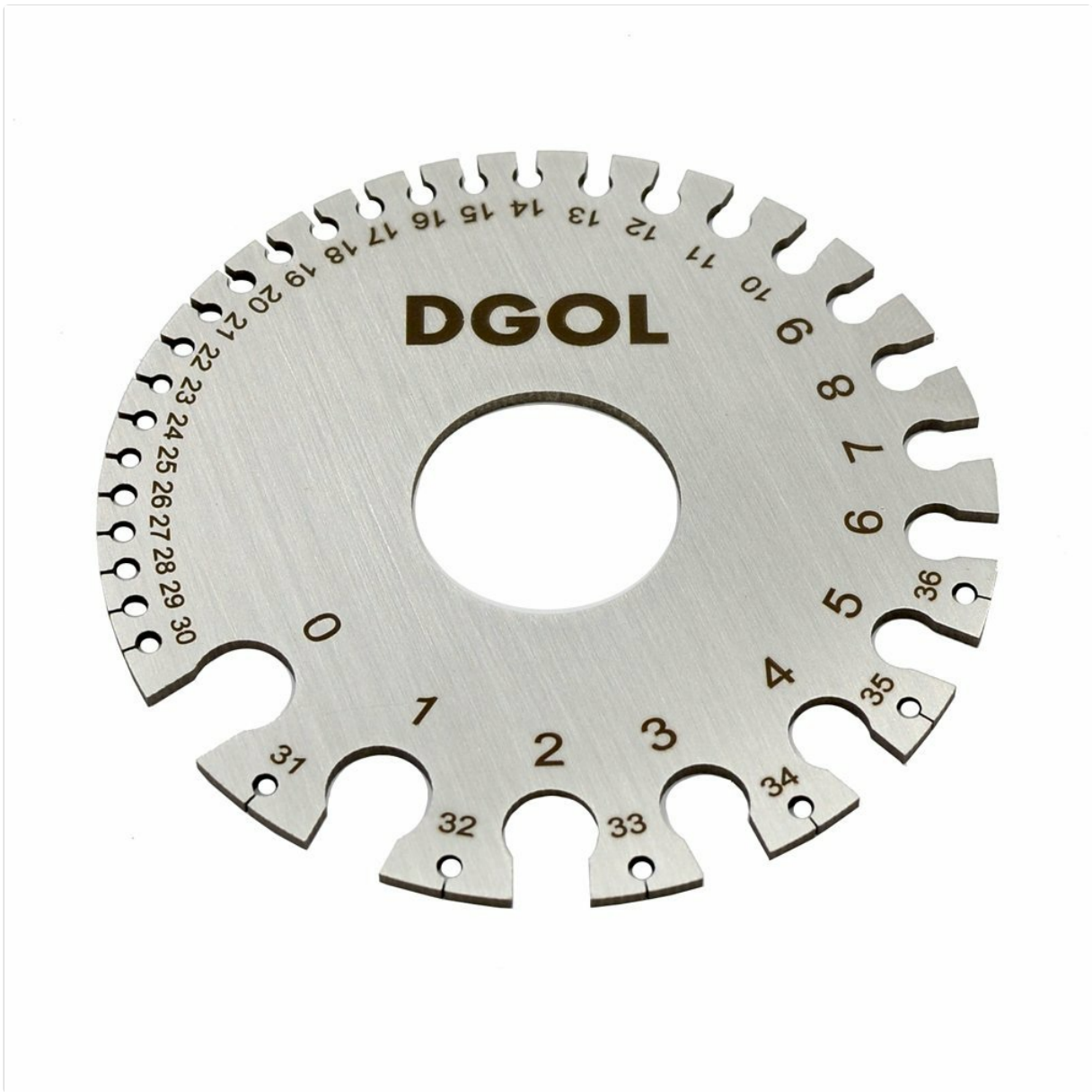
Image: The DGOL Stainless Steel SWG Sheet Metal Wire Cable Gage, a round, silver-colored tool with various slots and markings for measurement.