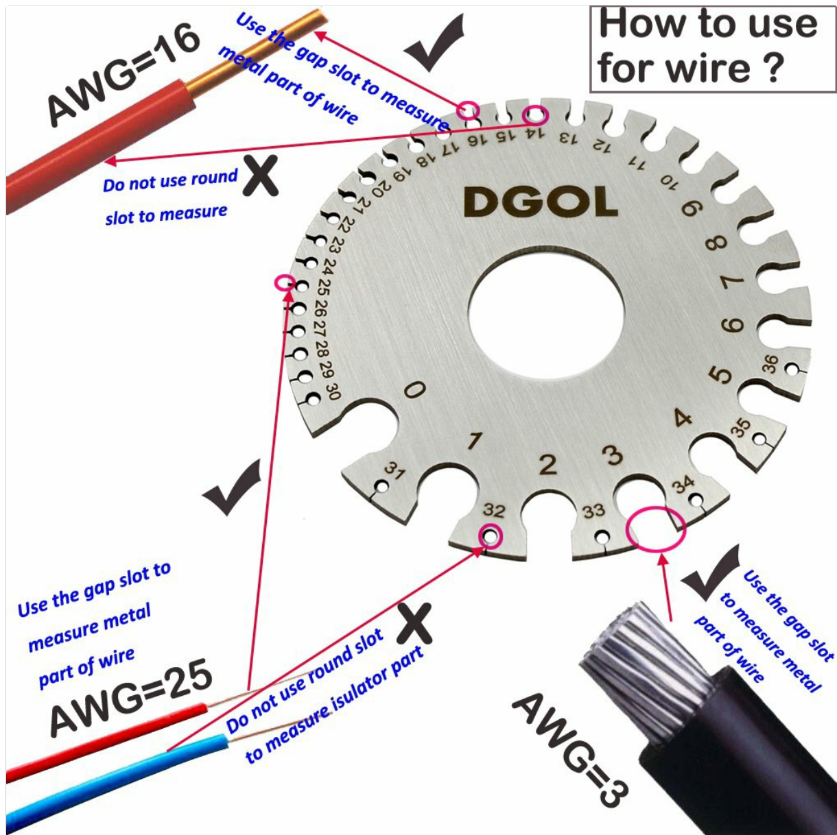
Image: An illustration demonstrating the correct way to measure wire using the gauge's slots, highlighting that only the metal part of the wire should be measured and not the insulation. Examples show AWG 16, AWG 25, and AWG 3 wires being measured correctly.