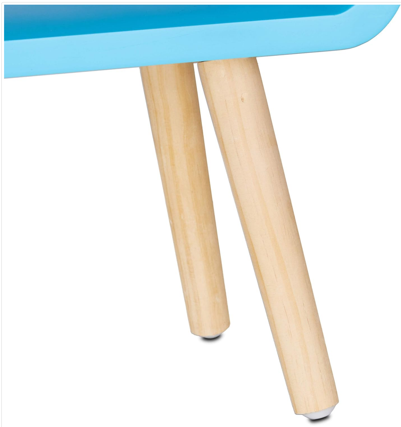
Image: A close-up view of the natural wood-finish legs, showing their attachment to the blue shelf unit and the protective feet.