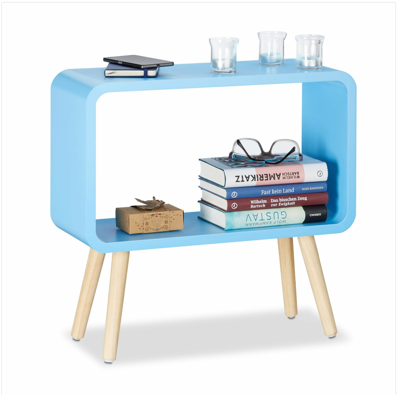
Image: The Relaxdays Small Standing Shelf, showcasing its compact design and blue finish.