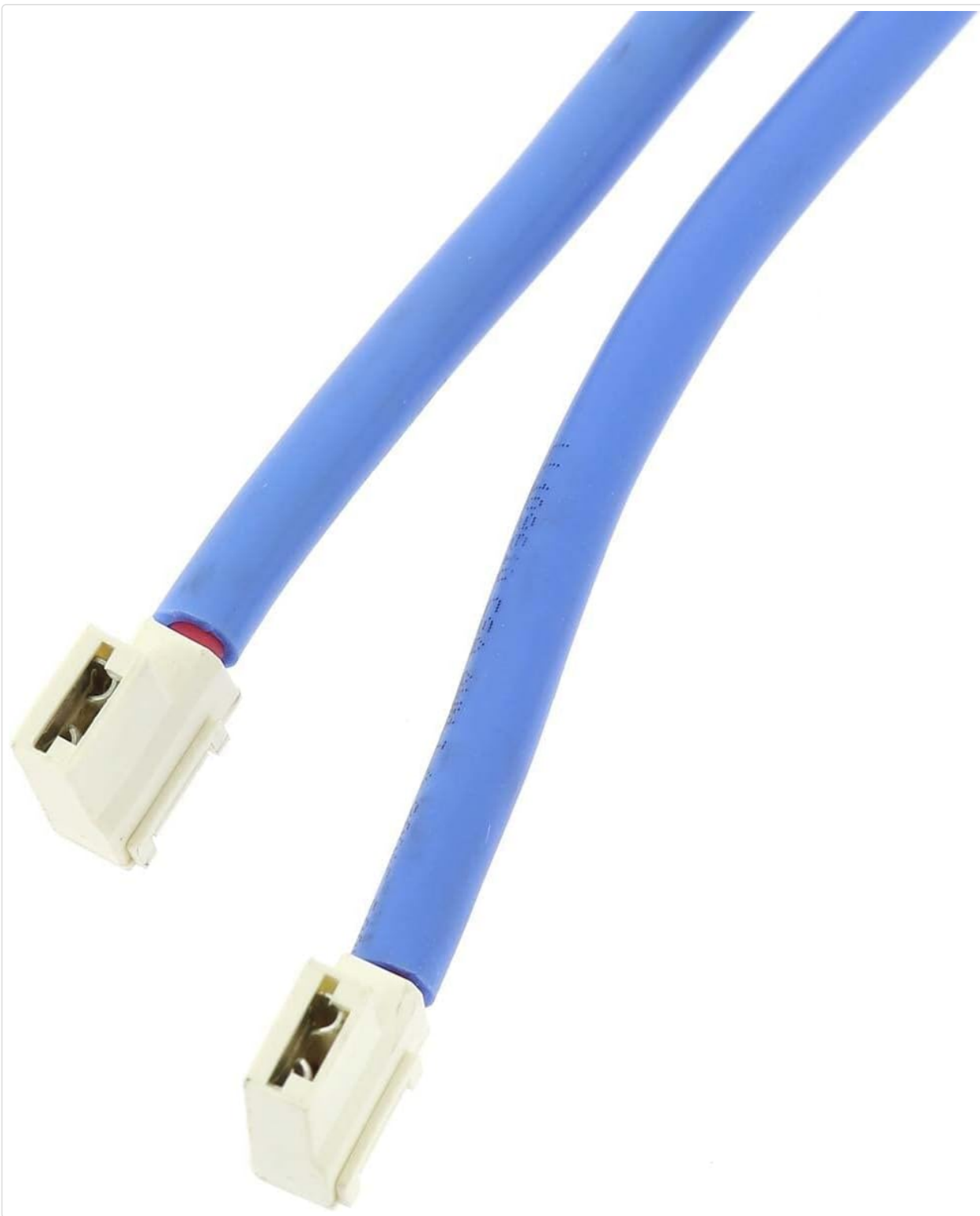
Image 2: A detailed view of the electrical connectors on the Thetford 12V Heating Cartridge, highlighting the connection points for the 12V power supply.

Reassembly: Replace any removed cover panels and secure them properly.