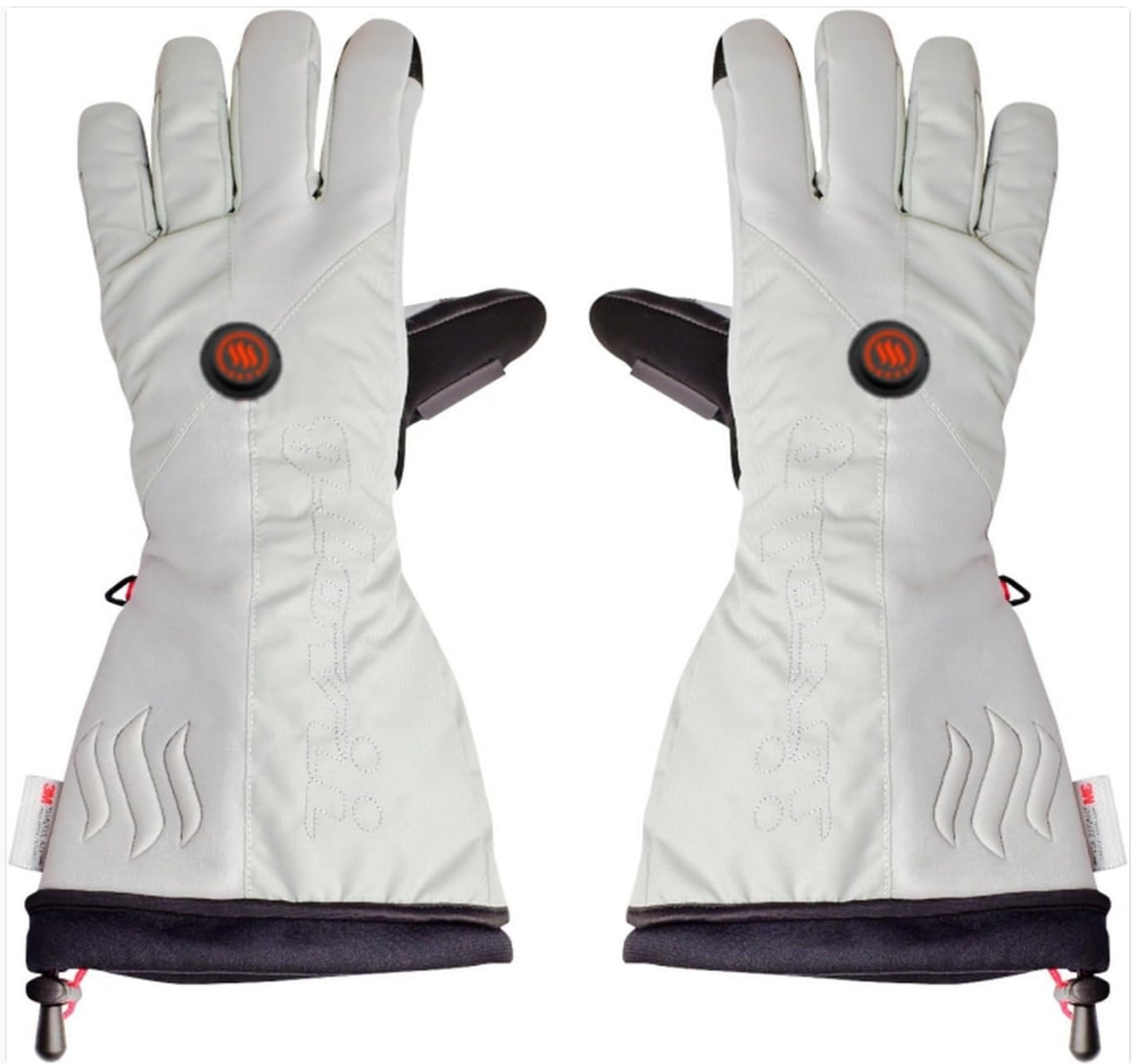
Image: A pair of Glovii GS8 Heated Ski Gloves, highlighting the circular control button on the back of each hand.