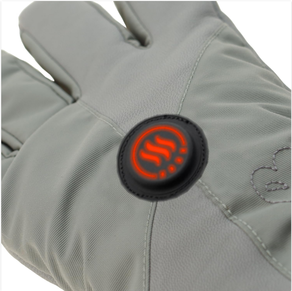
Image: A detailed close-up of the circular control button on the Glovii GS8 Heated Ski Glove, showing its illuminated state.