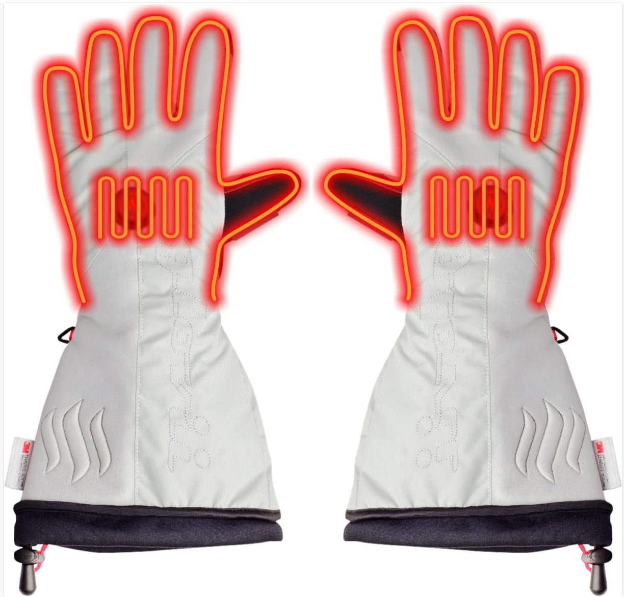
Image: A pair of Glovii GS8 Heated Ski Gloves with an overlay illustrating the internal heating elements across the fingers and palm.