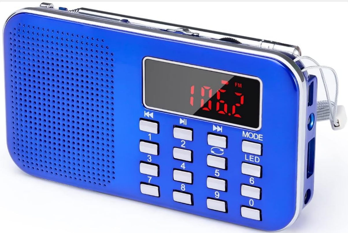
Front view of the PRUNUS Mini Portable Radio J-908, showcasing its compact design and control panel.