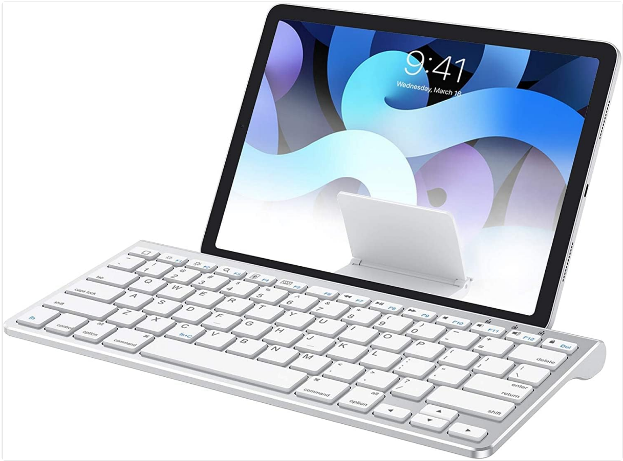
The OMOTON Bluetooth Keyboard with its integrated sliding stand, shown with a tablet in landscape orientation.