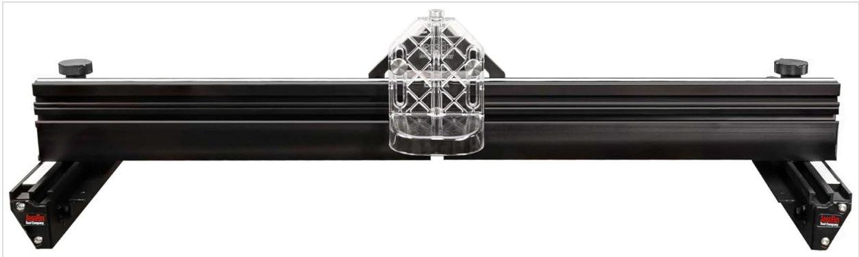
Figure 1.1: Front view of the JessEm 04500 TA Fence, showcasing its robust construction and clear guard.

The JessEm 04500 TA Fence is a precision-engineered accessory designed to enhance the functionality of your router table. Crafted from durable 6000 series aluminum extrusions, this fence features a built-in jointing capability and an efficient dust collection system. It provides accurate and repeatable routing operations for various woodworking tasks.