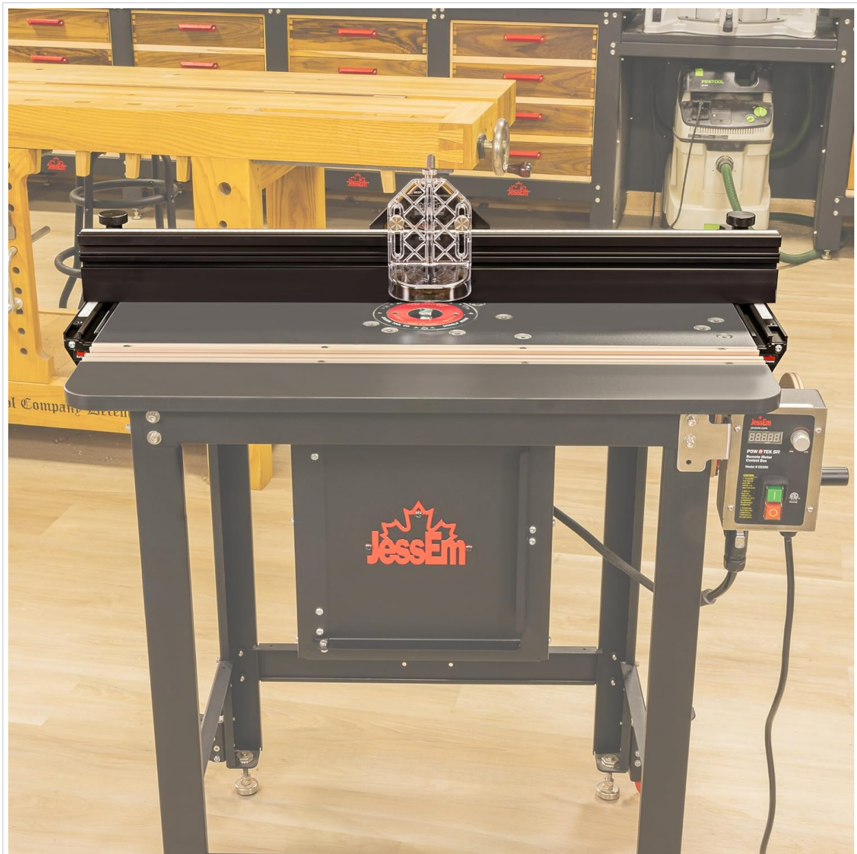
Figure 5.1: The TA Fence securely mounted on a router table, ready for operation.