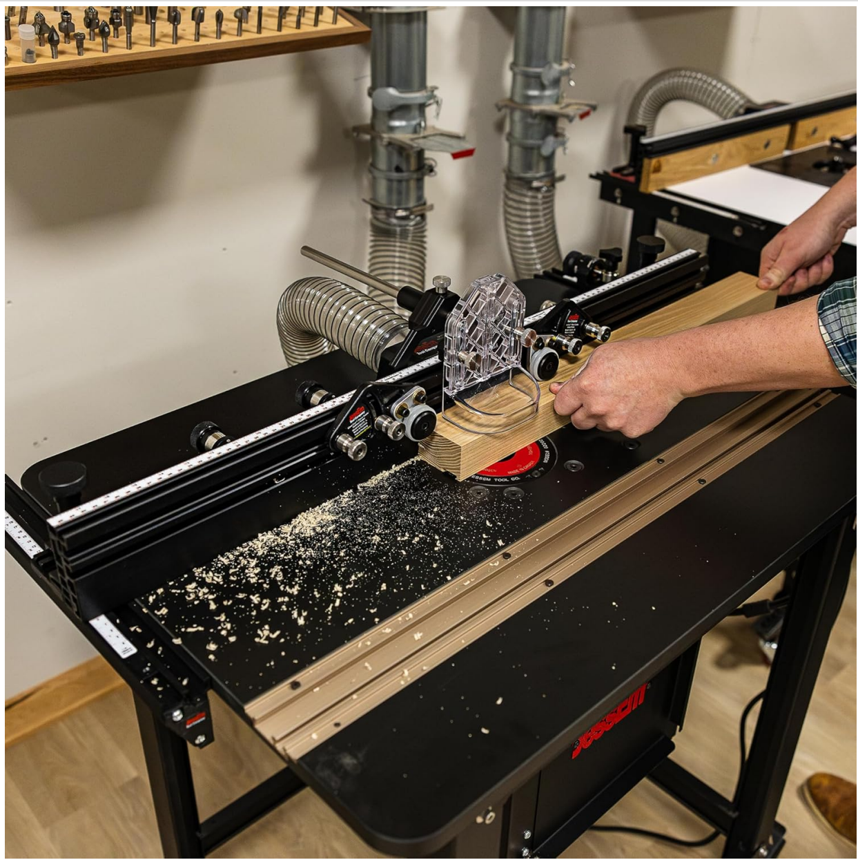
Figure 6.2: Demonstrates the fence in use, with a workpiece being routed and dust being collected.