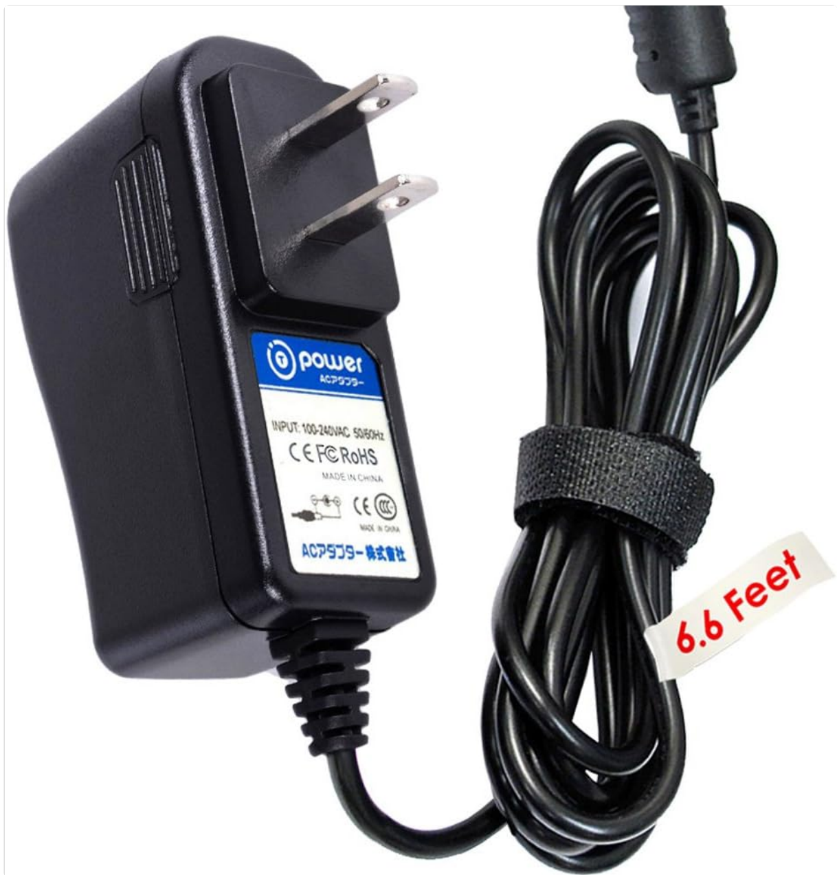
Image 1.1: T POWER AC Adapter Charger with its 6.6-foot cable, ready for connection.