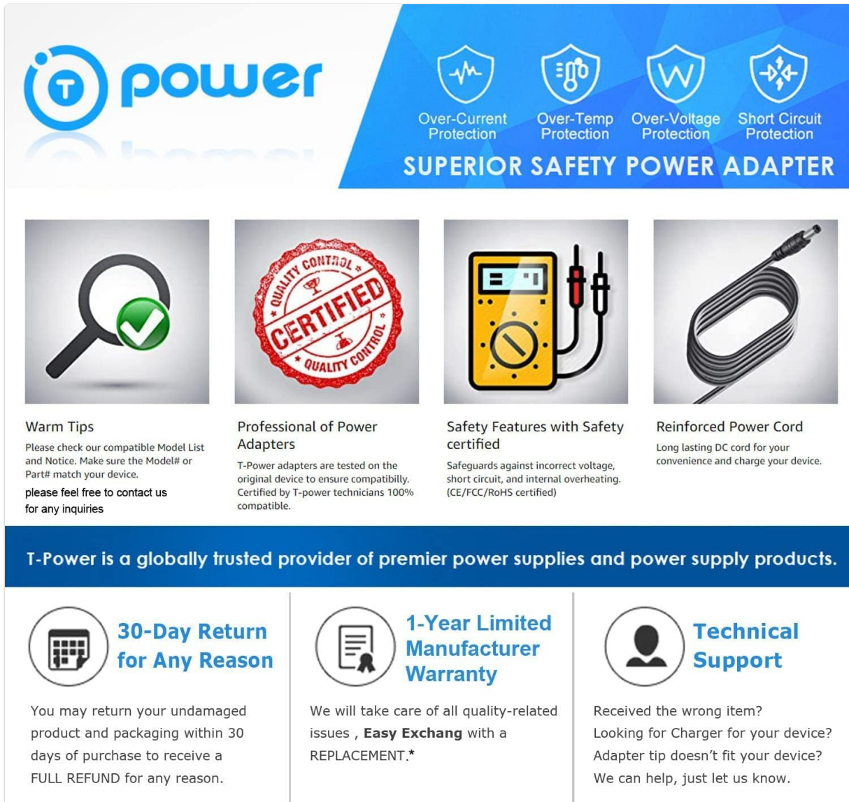
Image 4.1: Overview of the superior safety features integrated into the T POWER adapter design.