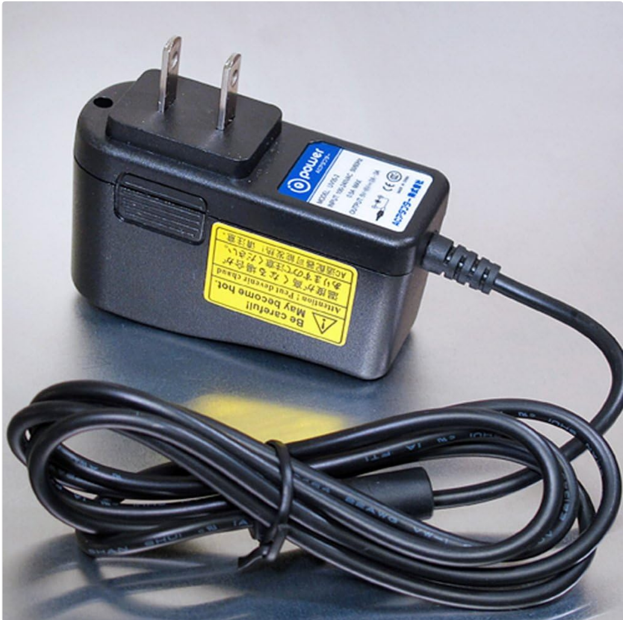
Image 3.1: Side view of the T POWER AC Adapter Charger, showing product details and safety warnings.