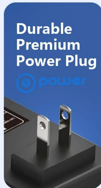
Image 6.1: Illustration of the adapter's durable construction and long lifespan features.