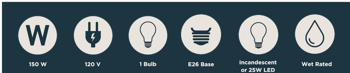
Figure 1: Product Dimensions and Electrical Specifications. This image displays the overall dimensions of the 20-inch wall sconce, including its height (20"), width (7"), and extension from the wall (8.5"). It also highlights key electrical specifications: 150W max wattage, 120V, 1 bulb required (E26 base), suitable for incandescent or 25W LED, and Wet Rated for outdoor use.

NOTE: ALL DIMENSIONS ARE ROUNDED UP TO THE NEAREST 1/4"