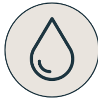
ETL Wet Rated For Outdoors