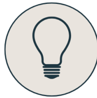
Incandescent or LED