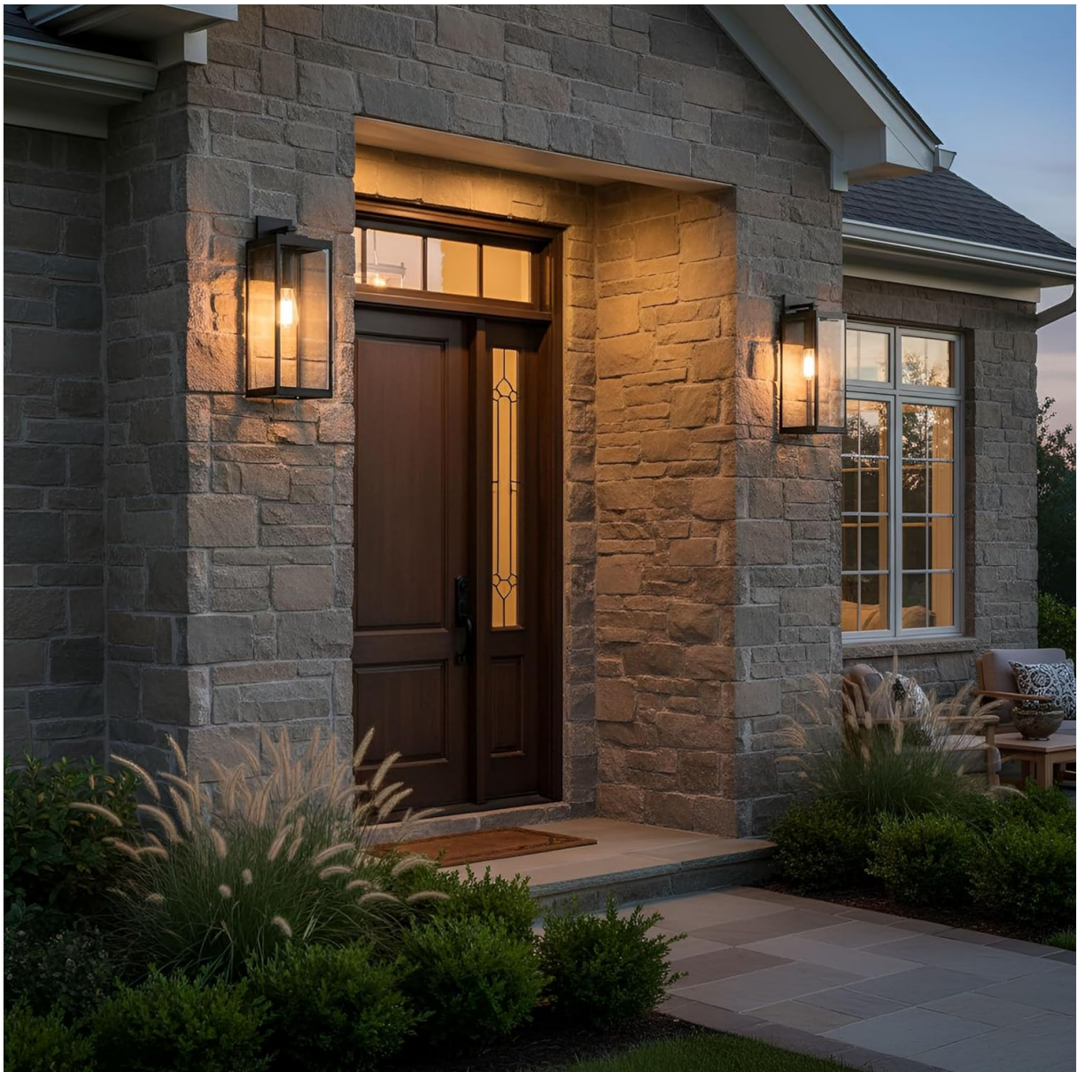
Figure 4: Illuminated Sconce. This image demonstrates the Quoizel Westover sconce providing ample illumination for an outdoor entryway, showcasing its functional and aesthetic appeal.