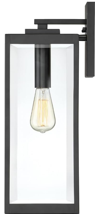
Figure 3: Fixture Detail. This image provides a detailed view of the sconce's interior, highlighting the E26 bulb socket and the clear beveled glass panels that enhance light distribution.