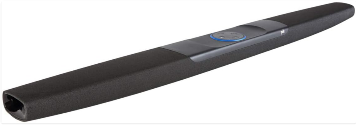
Image 3.1: A top-down view of the Polk Audio Command Sound Bar, highlighting its sleek design and integrated controls.