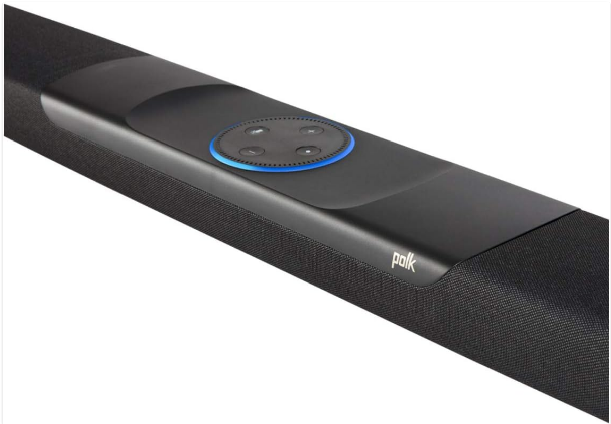
Image 3.4: An angled view of the Polk Audio Command Sound Bar and its wireless subwoofer, showcasing their design.