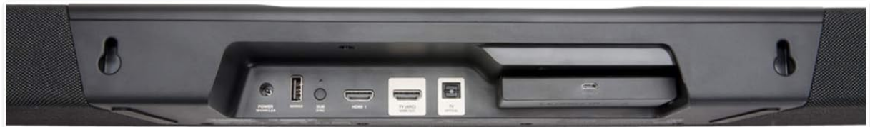
Image 3.2: The rear panel of the Polk Audio Command Sound Bar, showing the HDMI, Optical, USB, and power input ports.

For detailed information on your TV's HDMI ARC or CEC compatibility, consult your television's owner's manual.