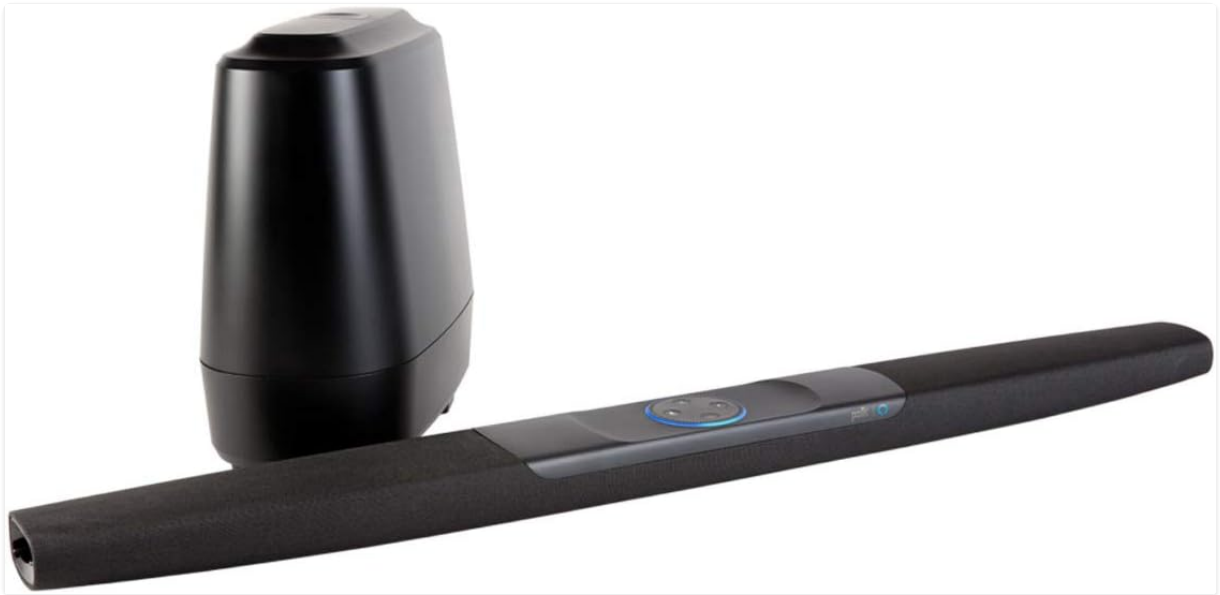
Image 2.1: The Polk Audio Command Sound Bar and its accompanying wireless subwoofer.