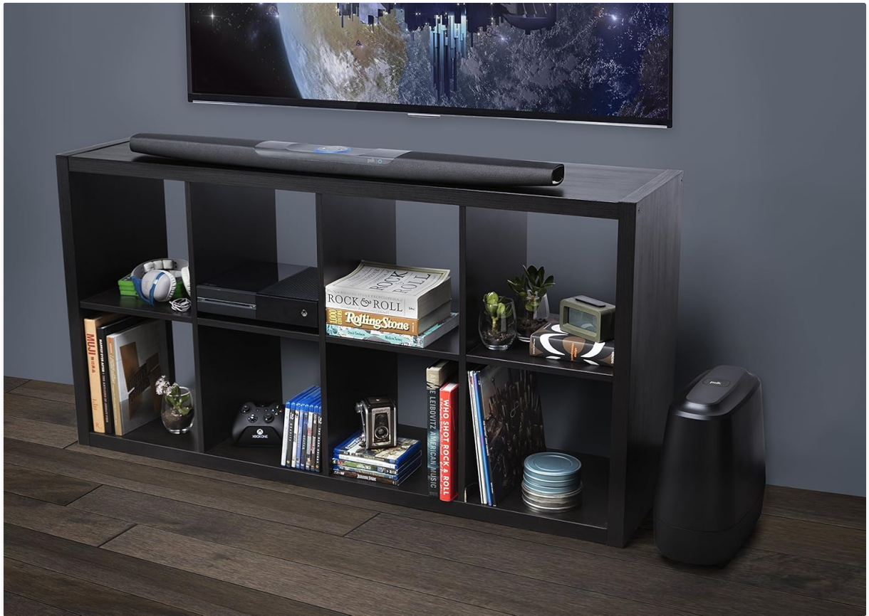
Image 2.2: The Polk Audio Command Sound Bar positioned beneath a television on a media console, with the subwoofer placed to the side.