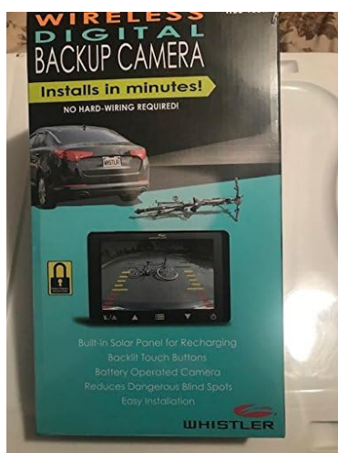
Figure 1: Front view of the Whistler WBU-900 product packaging, showing the camera unit, monitor, and a car with the camera installed, emphasizing wireless installation and solar charging.