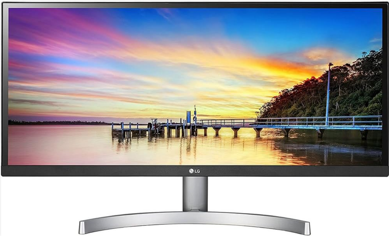
Image: Front view of the LG 29WK600-W UltraWide Monitor, showcasing its sleek design and wide display. This view helps in identifying the monitor for connection purposes.