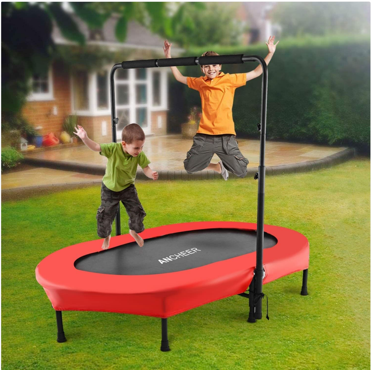
Image: Two children enjoying the ANCHEER Mini Trampoline, demonstrating its use with the adjustable handle for balance and safety during play.

The ANCHEER Mini Trampoline is designed to provide a safe and engaging exercise experience for children. It features a robust 5mm thickened steel frame, a durable PP jumping mat, and high-strength stainless steel springs for a reliable rebound system. The trampoline includes a PVC safety pad cover to protect users from direct contact with the springs.