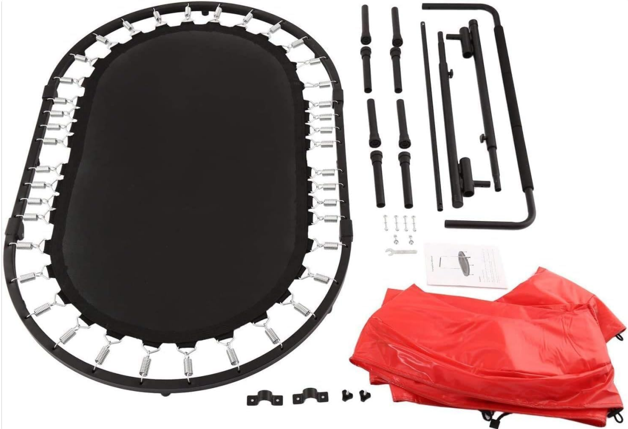
Image: Exploded view showing all components of the ANCHEER Mini Trampoline, including the main frame, jumping mat, springs, legs, handlebar parts, and tools.