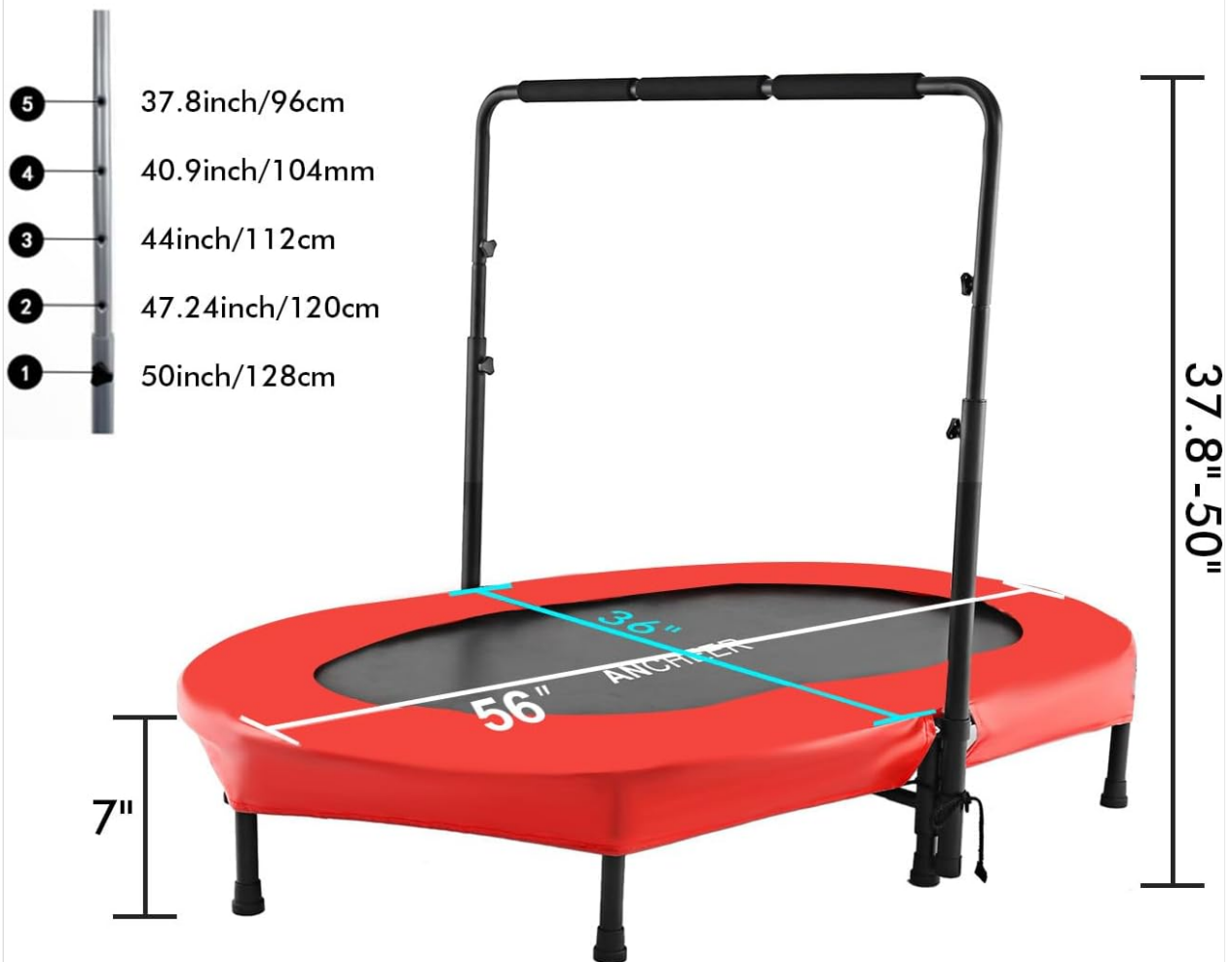
Image: Diagram illustrating the five adjustable height settings for the handlebar, ranging from 37.8 inches to 50 inches, along with the trampoline's overall dimensions of 56 inches by 36 inches and a height of 7 inches.