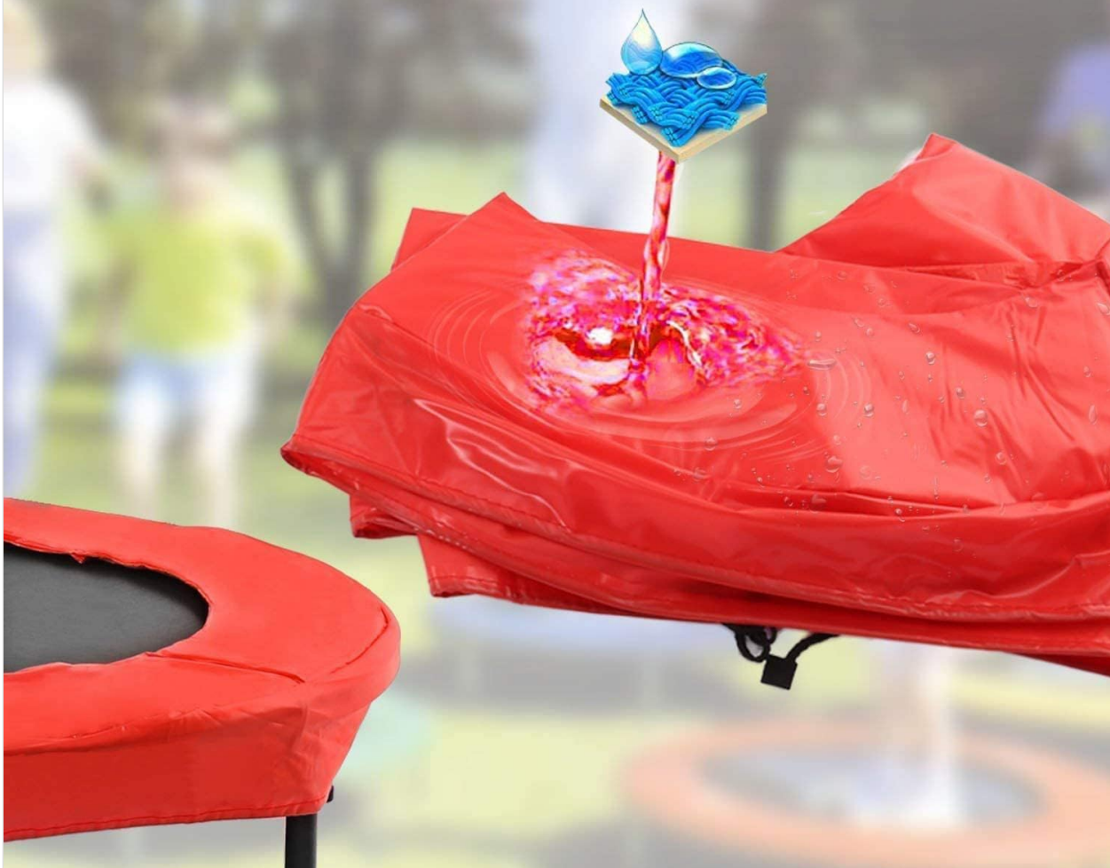
Image: Close-up view of the red PVC waterproof pad cover, demonstrating its water-resistant properties.