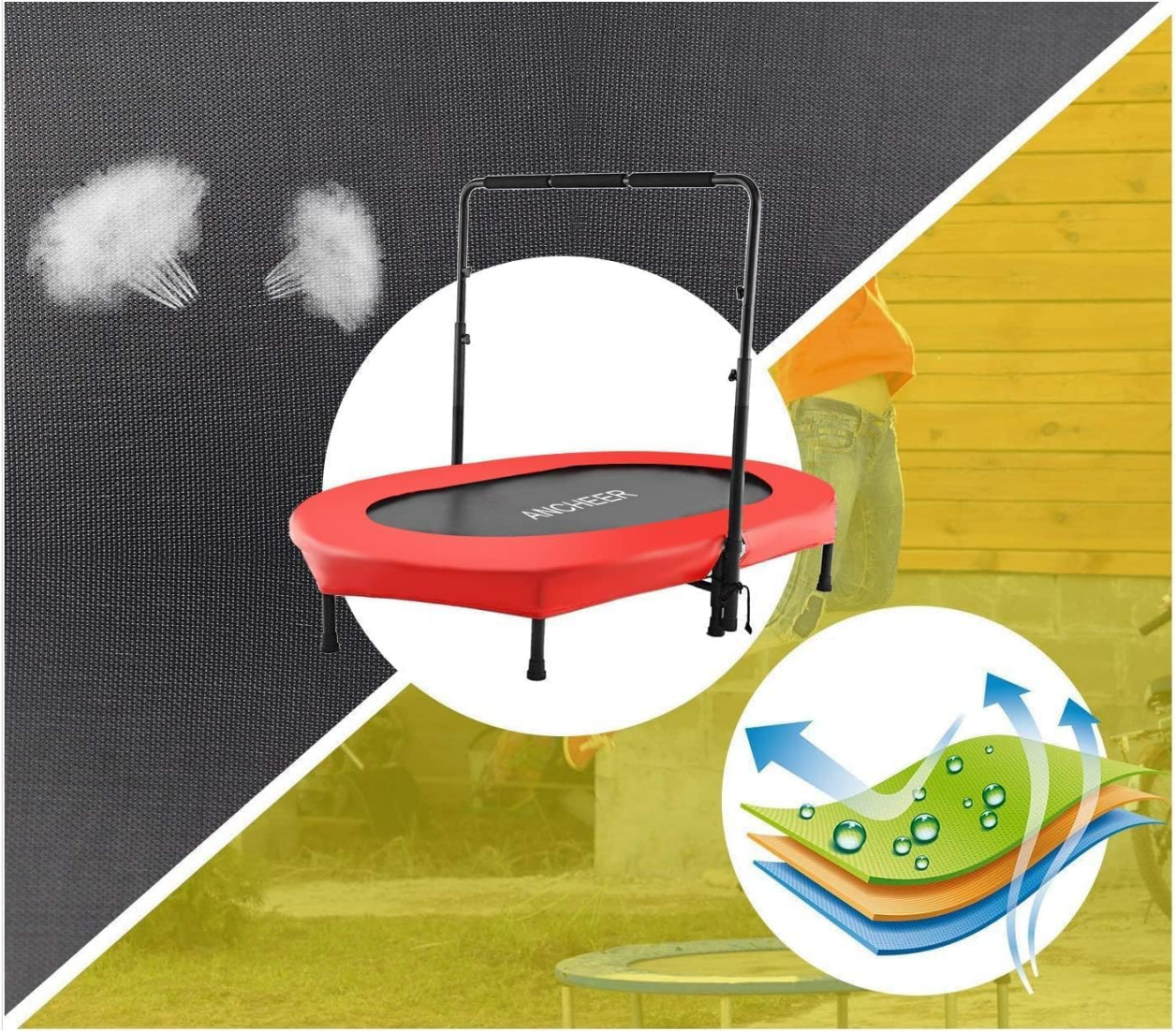
Image: Close-up view of the black PP jumping mat, highlighting its durable and breathable material.