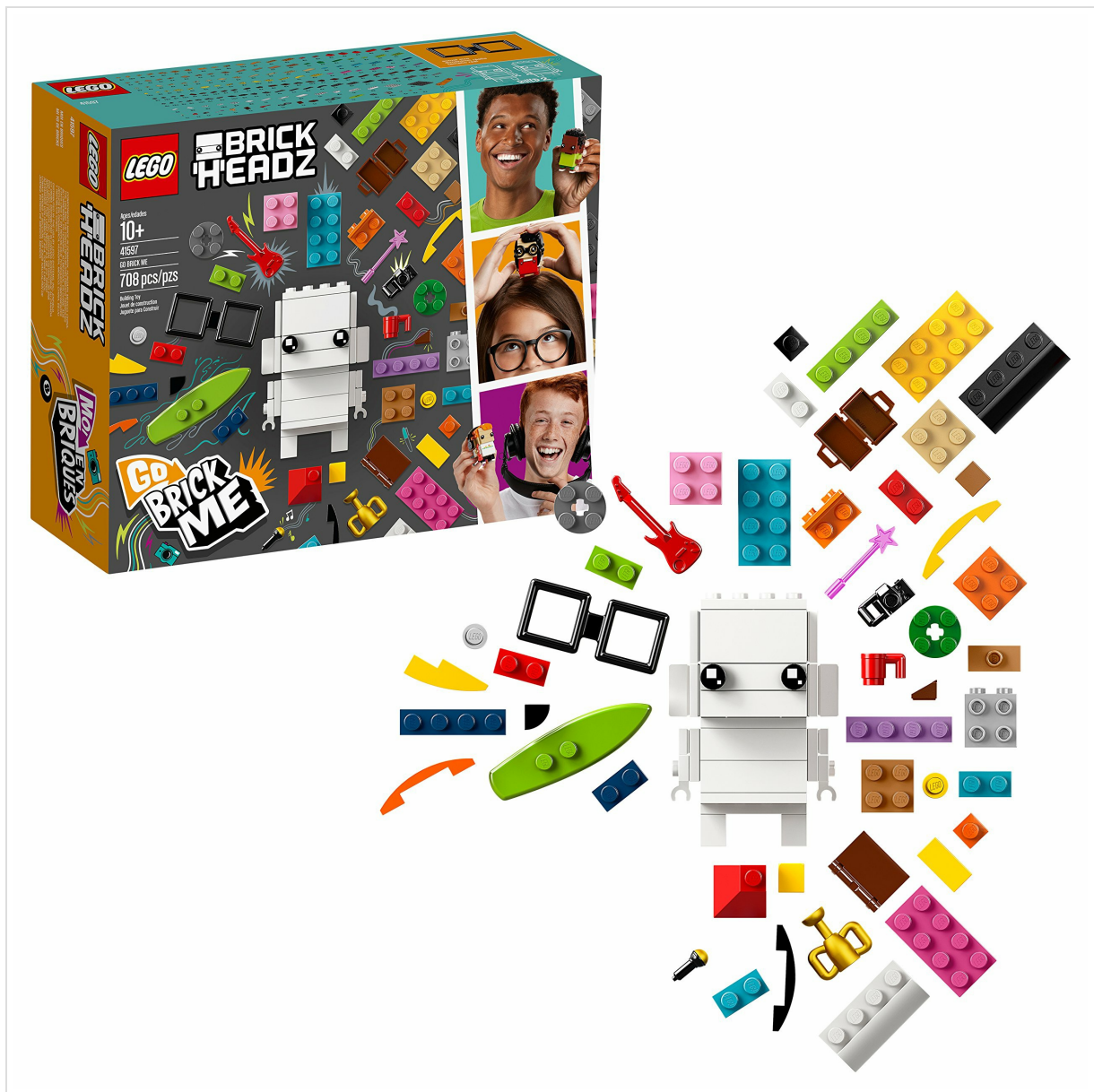
Image: The complete LEGO BrickHeadz Go Brick Me 41597 kit, showing the box and various building elements.