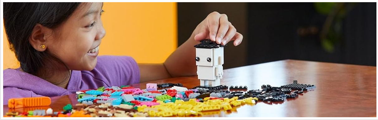
Image: A child engaged in building a LEGO BrickHeadz figure, surrounded by various bricks.