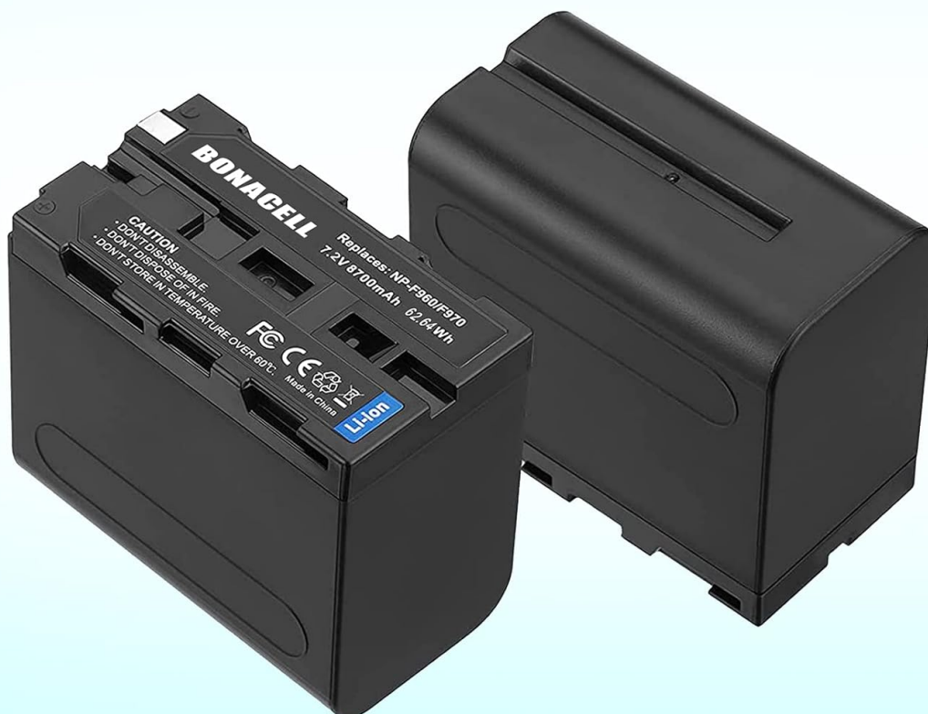
Image: Visual representation of compatible camcorder models with Bonacell NP-F batteries.