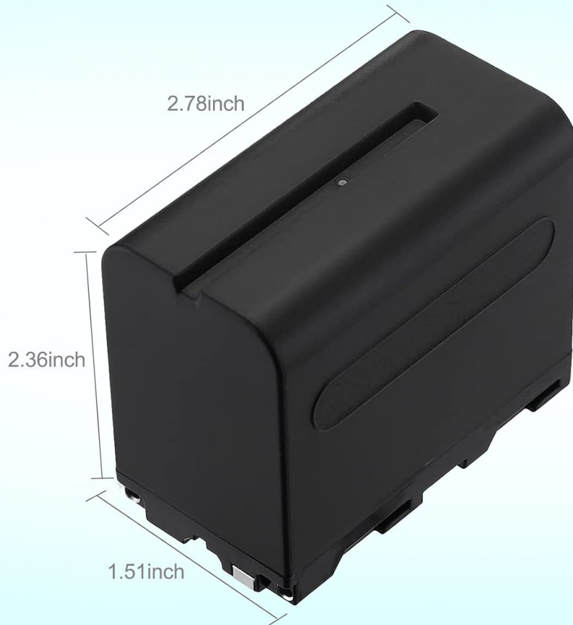
Image: Detailed dimensions of the Bonacell NP-F970/NP-F960 battery.

The size & function same as the original