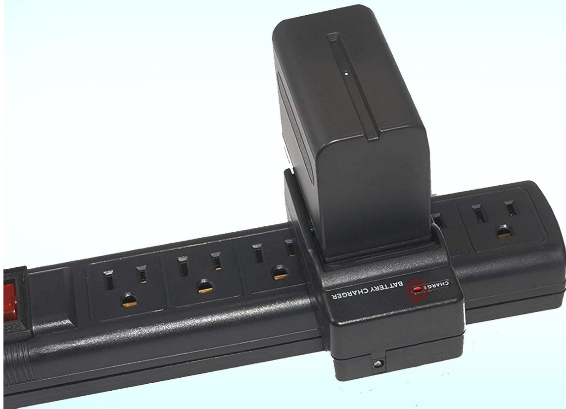
Image: A Bonacell battery being charged, illustrating the charging process.

High grade digital battery with advanced lithium technology ensures maximum battery life and power. It has no memory effect or other negative effects in recharging.