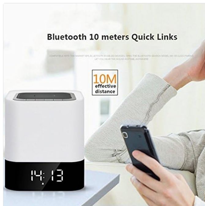
Image: The MUSKY DY28 speaker connected via Bluetooth to a smartphone, illustrating an effective wireless range of up to 10 meters.