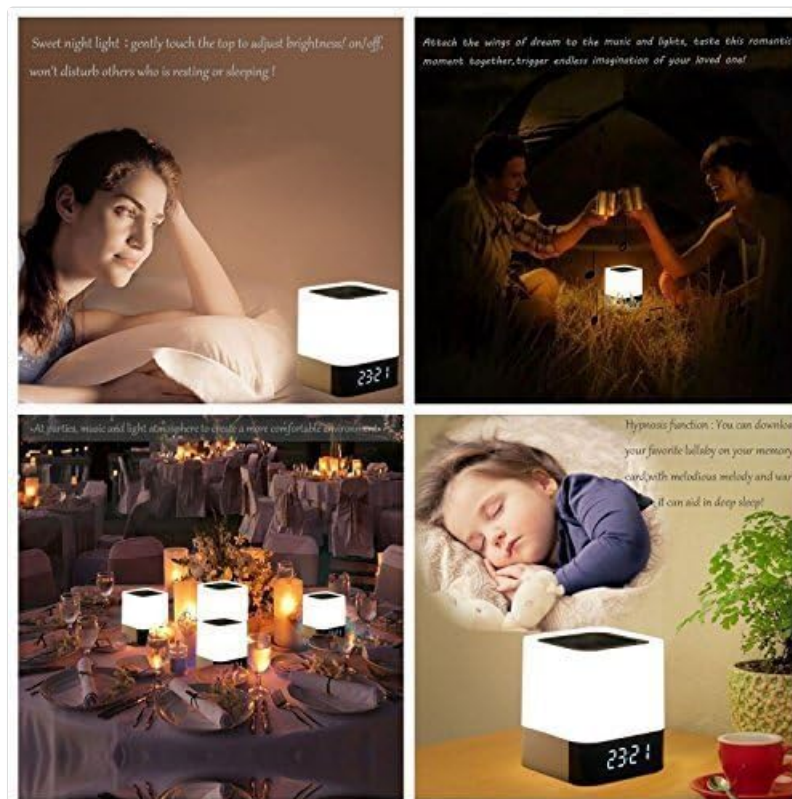
Image: A collage showing the MUSKY DY28 speaker used in different settings, including as a night light by a bed, for ambient lighting during a party, and for outdoor relaxation, demonstrating its versatility.