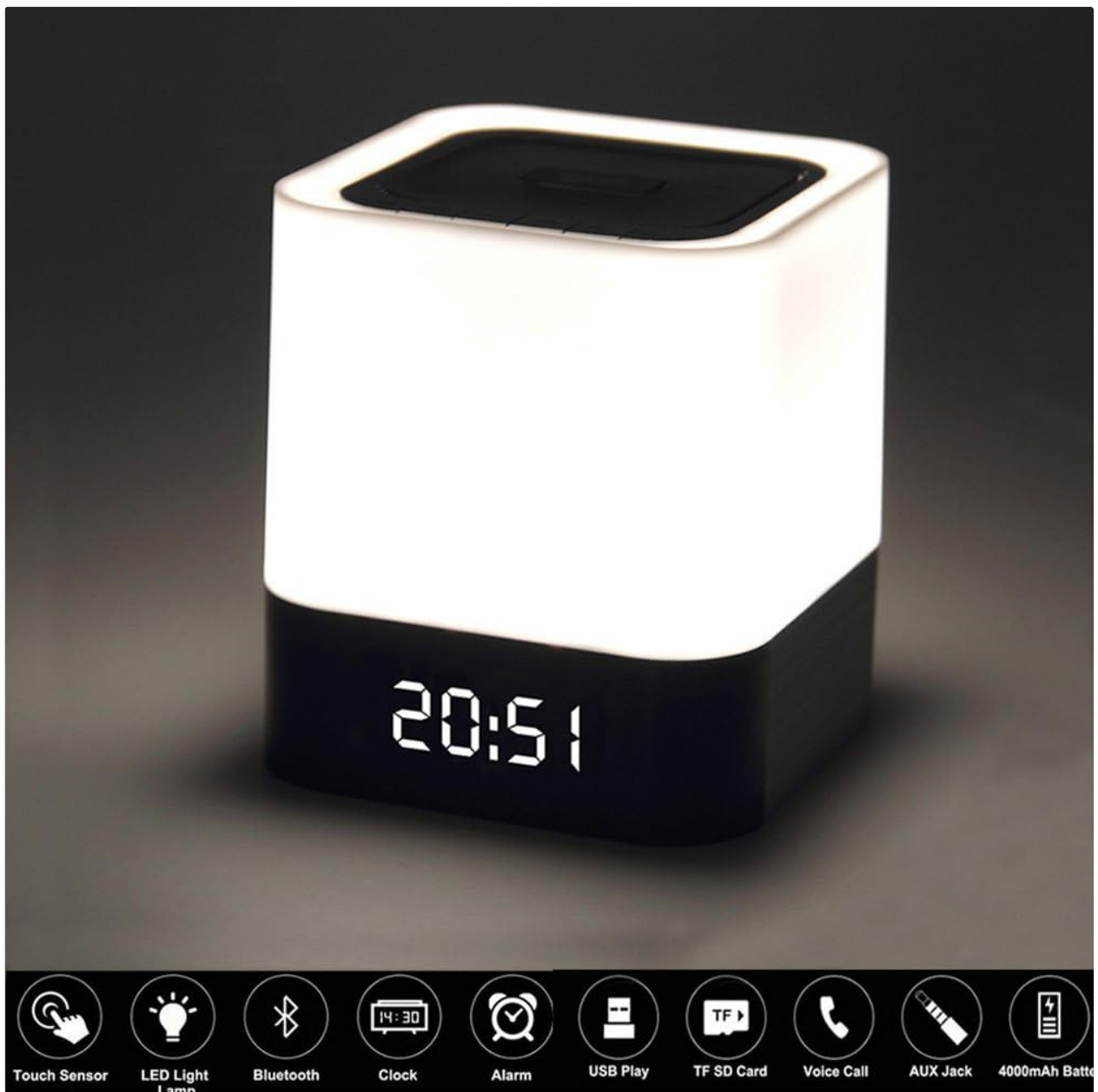
Image: Front view of the MUSKY DY28 speaker, highlighting its LED display showing time, and icons representing features such as Touch Sensor, LED Light Lamp, Bluetooth connectivity, Clock, Alarm, USB Playback, TF SD Card support, Voice Call function, AUX Jack, and 4000mAh Battery capacity.