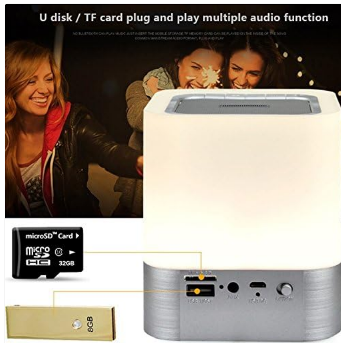
Image: The side of the MUSKY DY28 speaker demonstrating the insertion of a Micro SD card and a USB flash drive for direct audio playback.