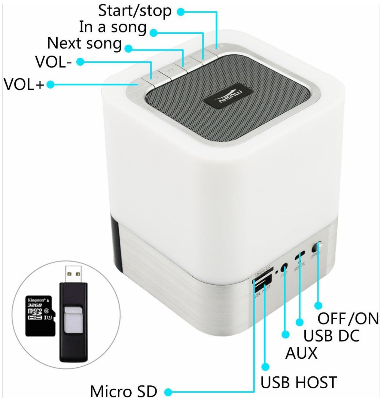
Image: Top and side view of the MUSKY DY28 speaker, showing the control buttons on top (Start/Stop, Next Song, Volume Down, Volume Up) and ports on the side (OFF/ON switch, USB DC charging port, AUX input, USB Host port, and Micro SD card slot).