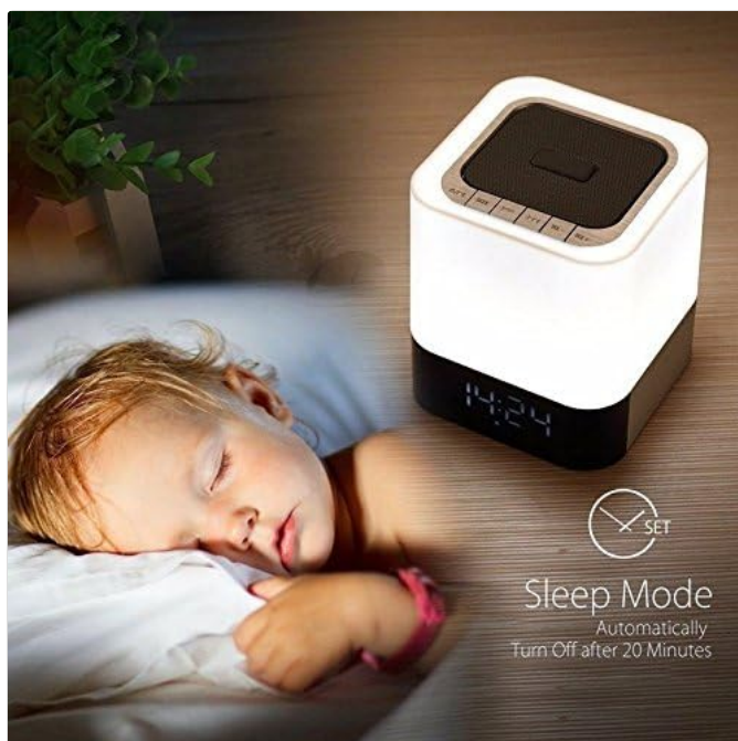
Image: The MUSKY DY28 speaker placed next to a sleeping child, with a 'Sleep Mode' icon, indicating its automatic turn-off feature after 20 minutes to assist with sleep.