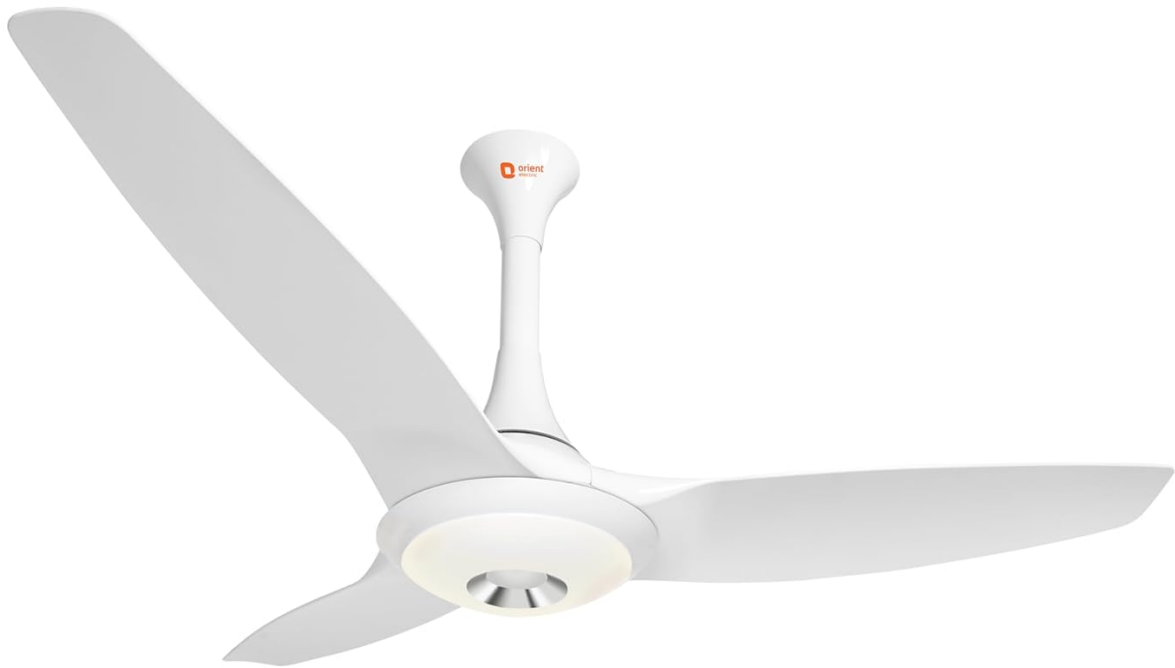
Image: The Orient Electric Aerolite 1200mm Premium Ceiling Fan in white, showcasing its sleek design and three blades.