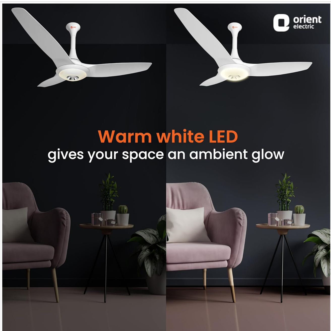
Image: A split image showing a room with the fan's LED light off on the left, and the same room with the warm white LED light on on the right, illustrating the ambient glow it provides.