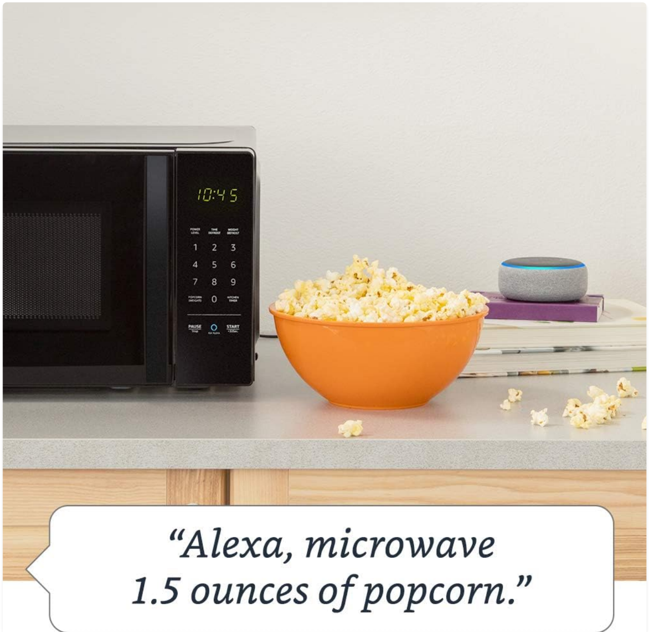
Image: Demonstrating voice command for microwaving popcorn.