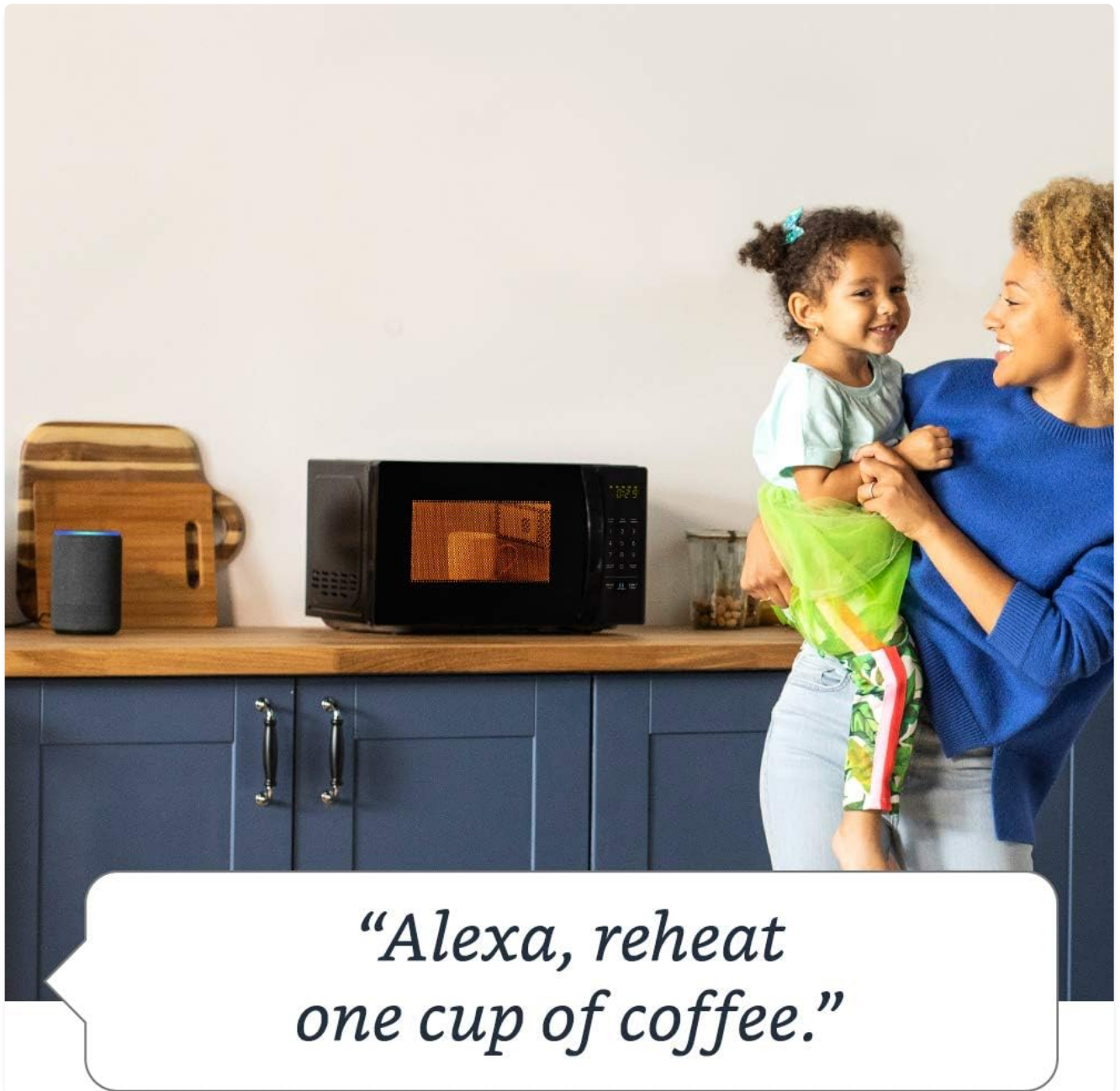
Image: Demonstrating voice command for reheating coffee.