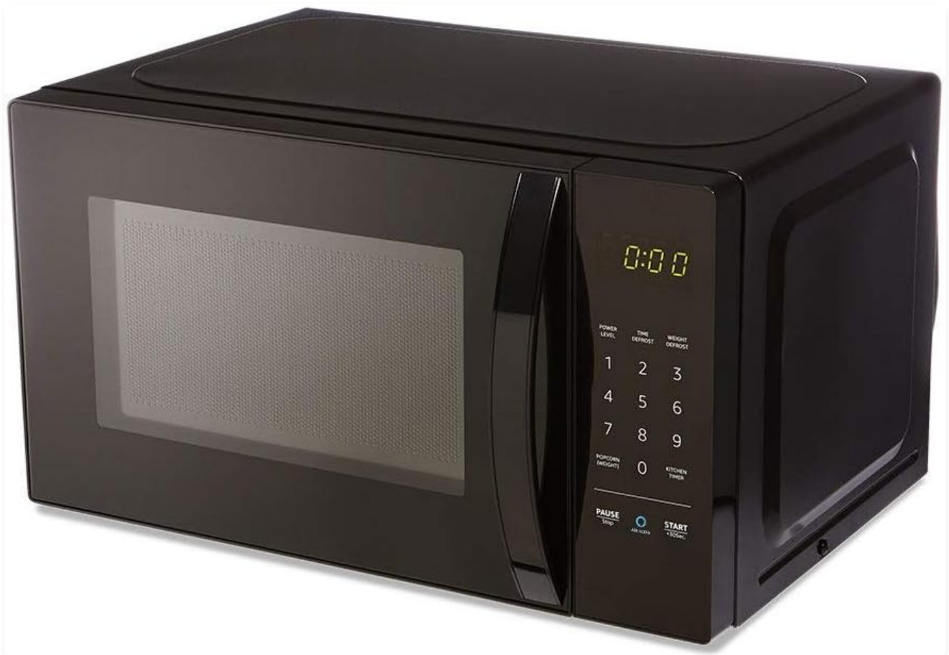
Image: Front view of the Amazon Basics Microwave, displaying the control panel and digital clock.