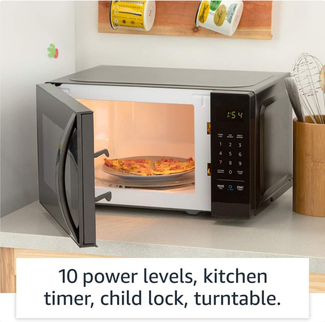
Image: Interior view of the microwave, highlighting its features like the turntable.