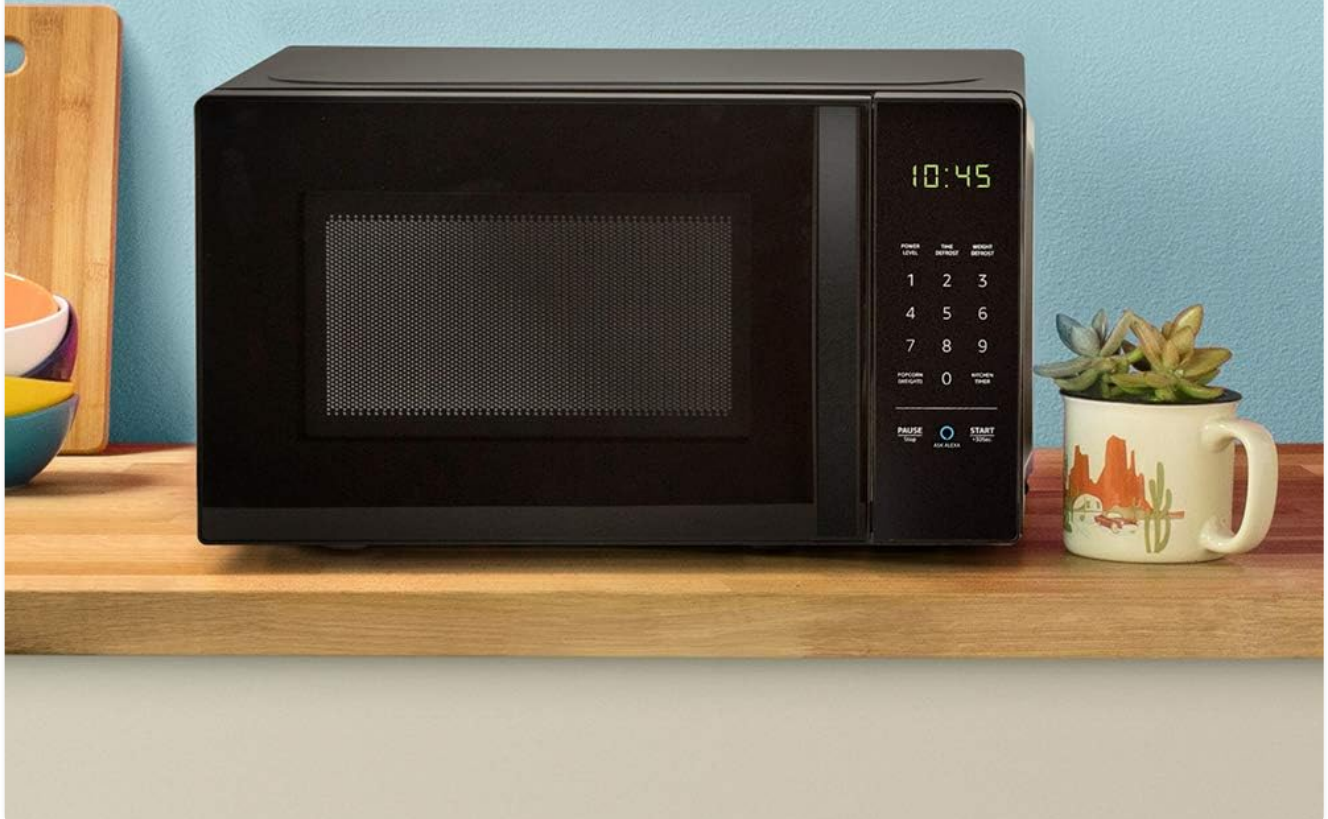
Image: The Amazon Basics Microwave, highlighting its voice-controlled capabilities.