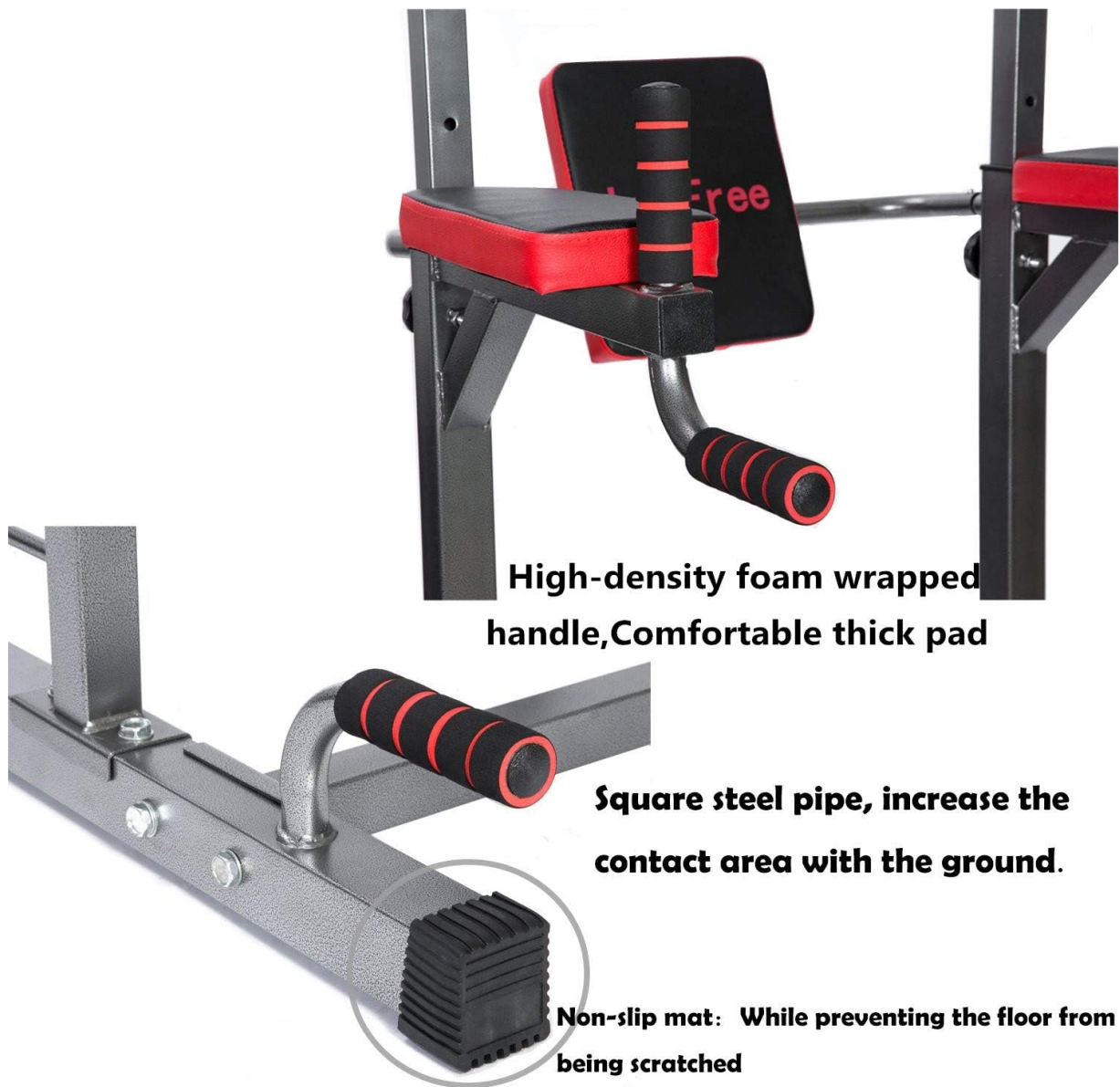
Figure 4.4: The lower handles can be used for push-ups, and the tower can assist with stretching.