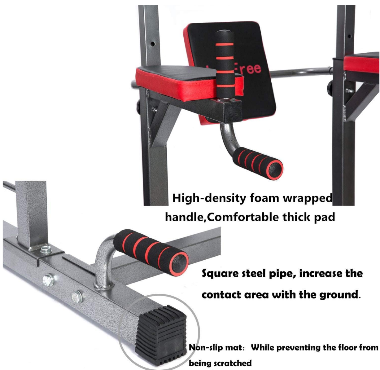
Figure 3.1: Detail of the base with non-slip mats and foam handles for stability and comfort.