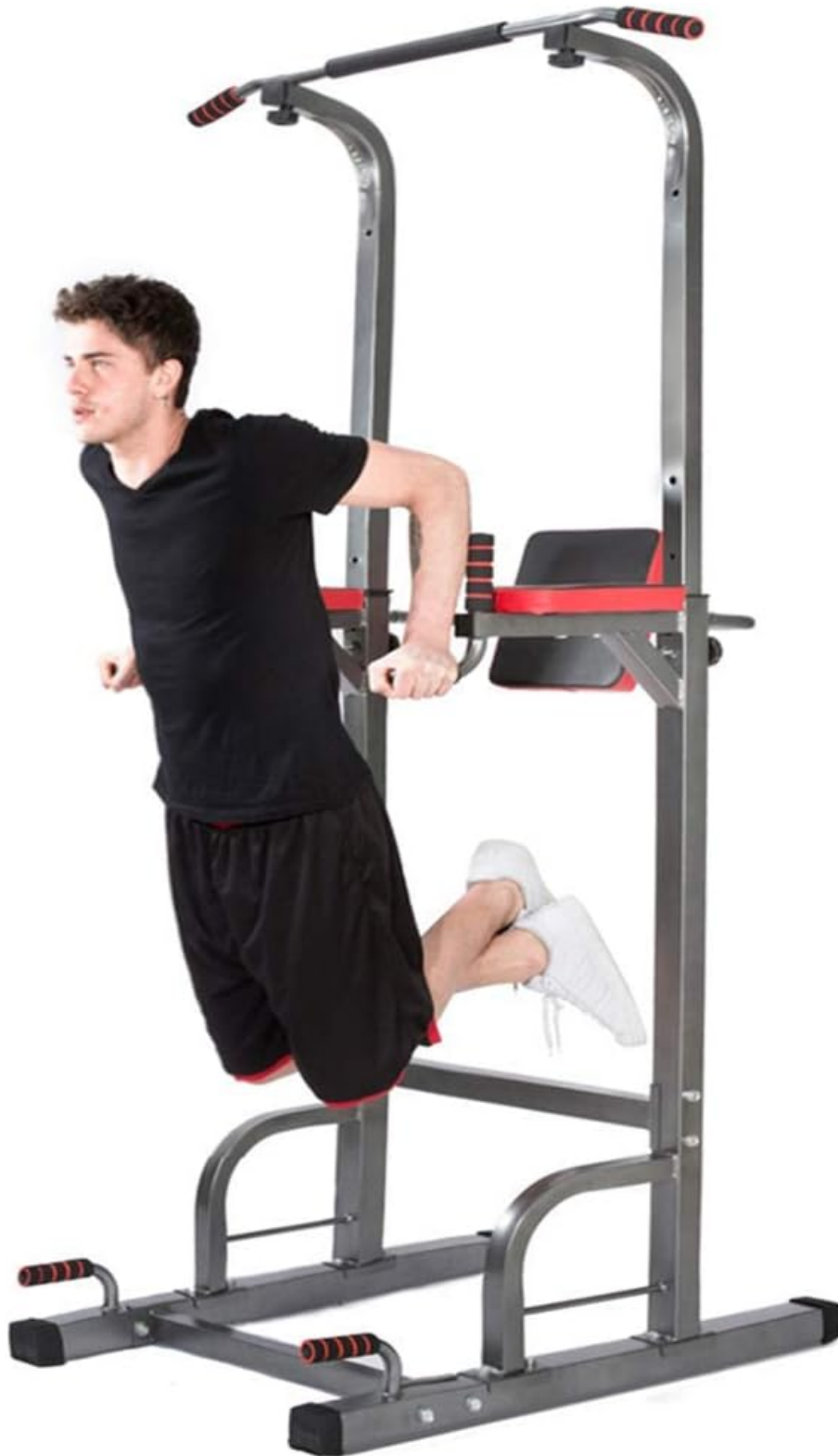
Figure 4.1: Performing dips on the power tower, engaging chest and triceps.