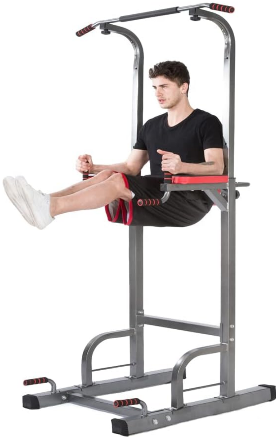
Figure 4.2: Executing leg raises for core strength using the dedicated station.