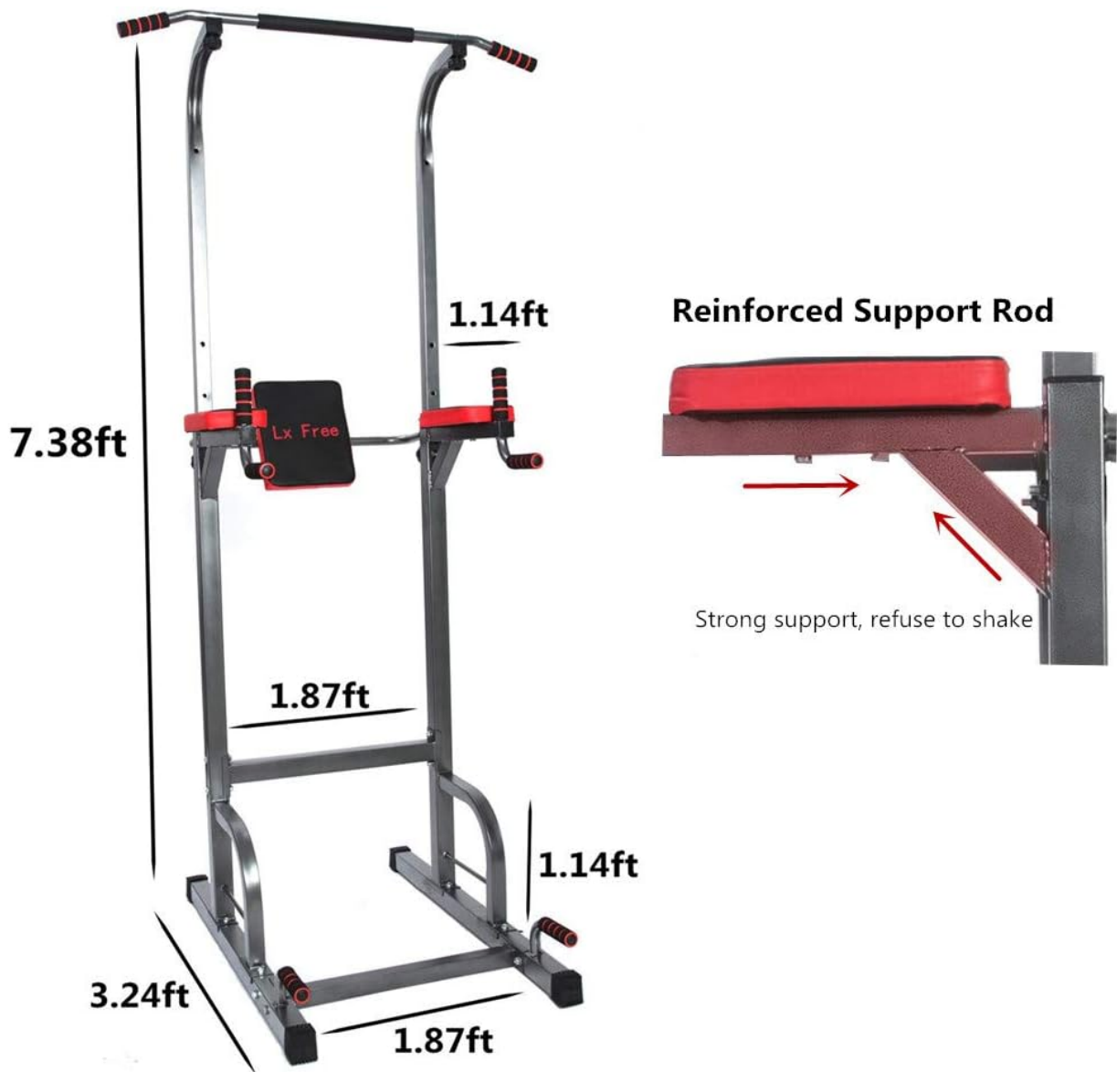
Figure 3.3: The power tower offers multiple height adjustments for various users.