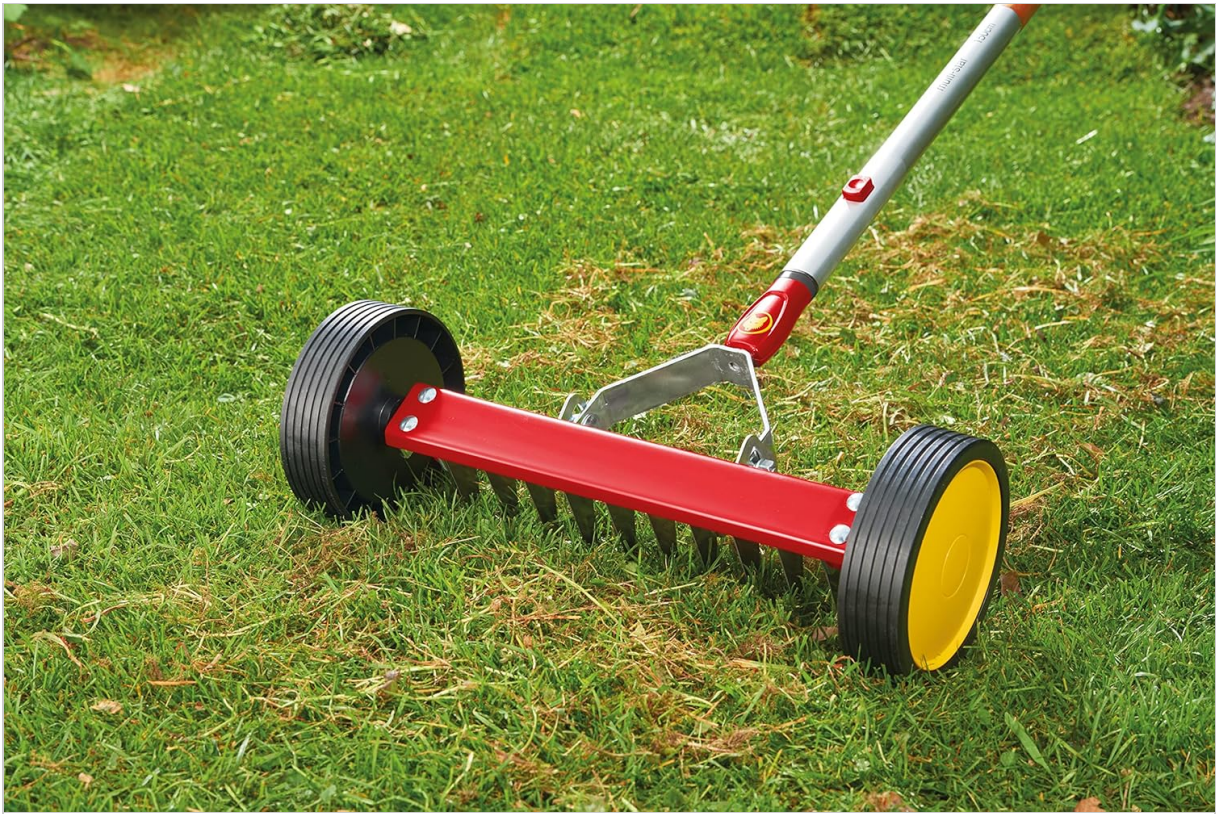
Image 4.2: A close-up view of the rake's blades effectively engaging and lifting moss from the lawn surface.