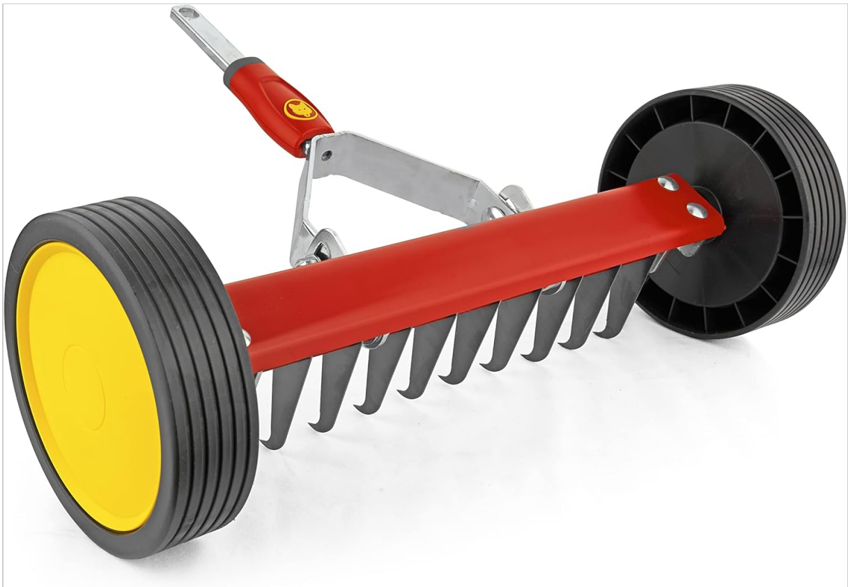
Image 1.1: The WOLF-Garten URM3 Multi-Change Roller Moss Removal Rake tool head, featuring its red frame, metal blades, and yellow-centered wheels.