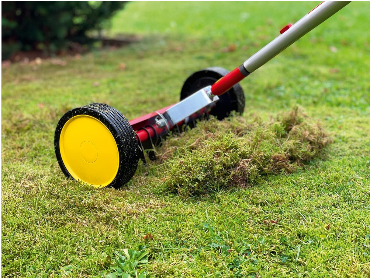
Image 4.4: A pile of moss and thatch collected by the URM3 Roller Moss Removal Rake, demonstrating its effectiveness.