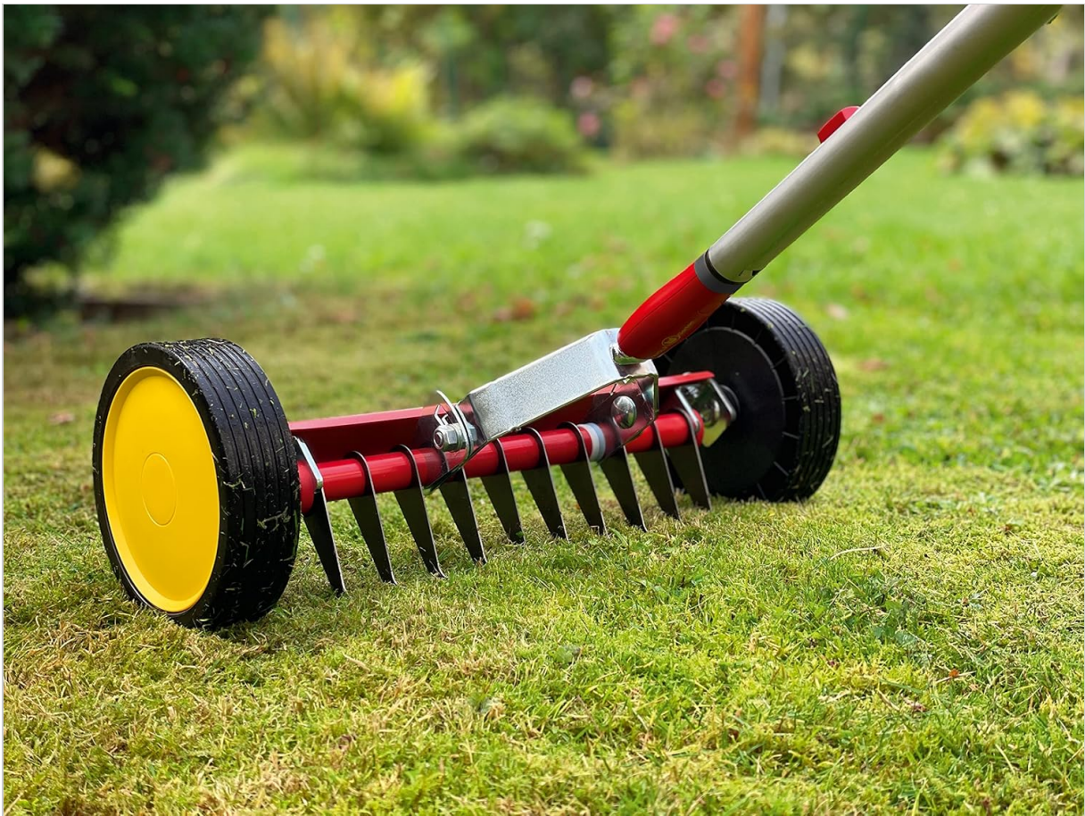
Image 4.3: The URM3 Roller Moss Removal Rake in action, showing the accumulation of removed moss behind the tool.