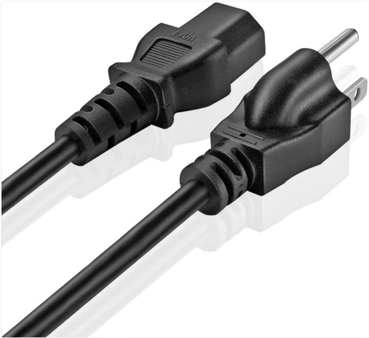
Figure 2: Side view of the OMNIHIL AC Power Cord, highlighting the cable and connectors.