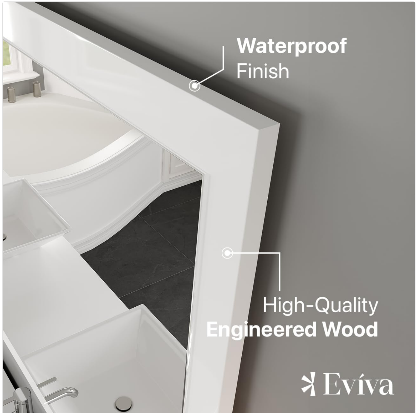
Image: Detail of the mirror surface, demonstrating its crystal clear reflection quality.