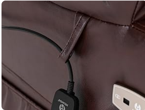
Figure 8: Comparison illustrating the 30% thicker faux leather used in the recliner, contributing to enhanced durability and a premium feel.