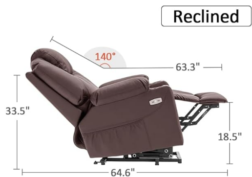
Figure 5: Comprehensive dimension chart for the recliner, including measurements for ideal height (5'1"-5'9"), maximum capacity (350 lbs), and various states like upright, TV position, and fully reclined (140 degrees).