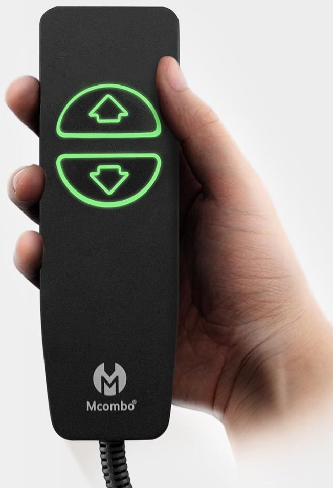
Figure 3: Illustration of the 8 vibration points and lumbar heating zone within the chair, accompanied by the remote control for selecting massage modes, intensity levels, and heat settings.