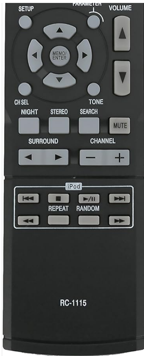
Figure 1: Front view of the VINABTY RC-1115 Replacement Remote Control, showing all buttons and layout.