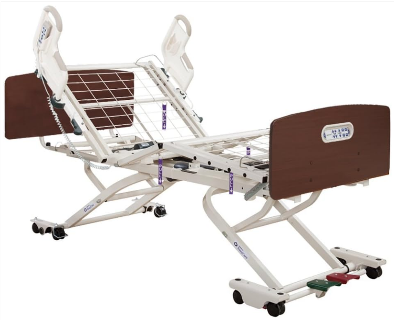
Figure 1: EasyCare Electric Adjustable Bed Frame overview. This image shows the complete bed frame with its adjustable sections and base.