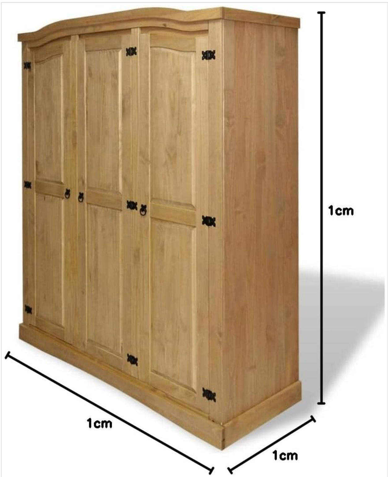
Image: Diagram illustrating the wardrobe's dimensions.