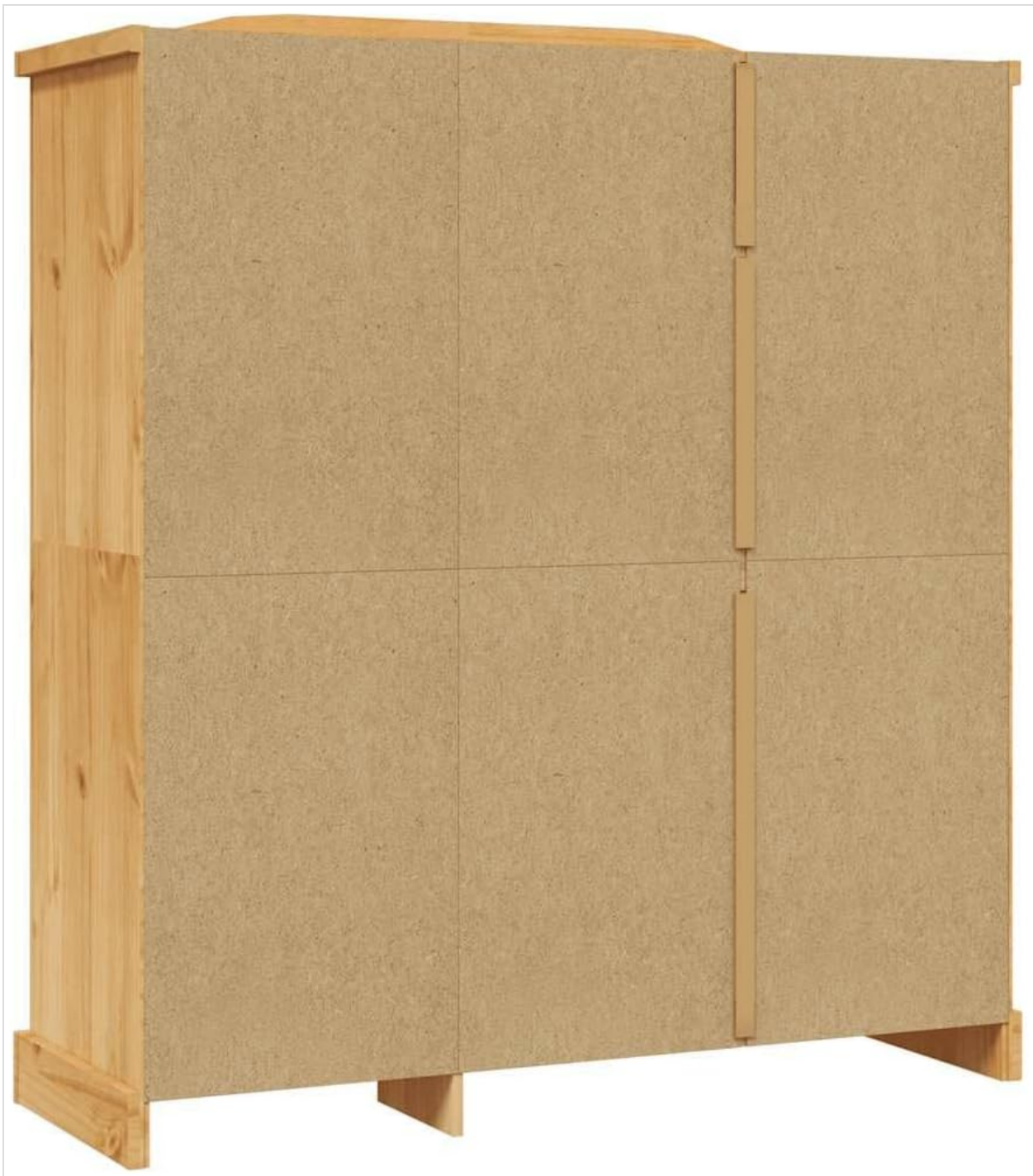
Image: Rear view of the wardrobe, indicating areas for wall attachment.