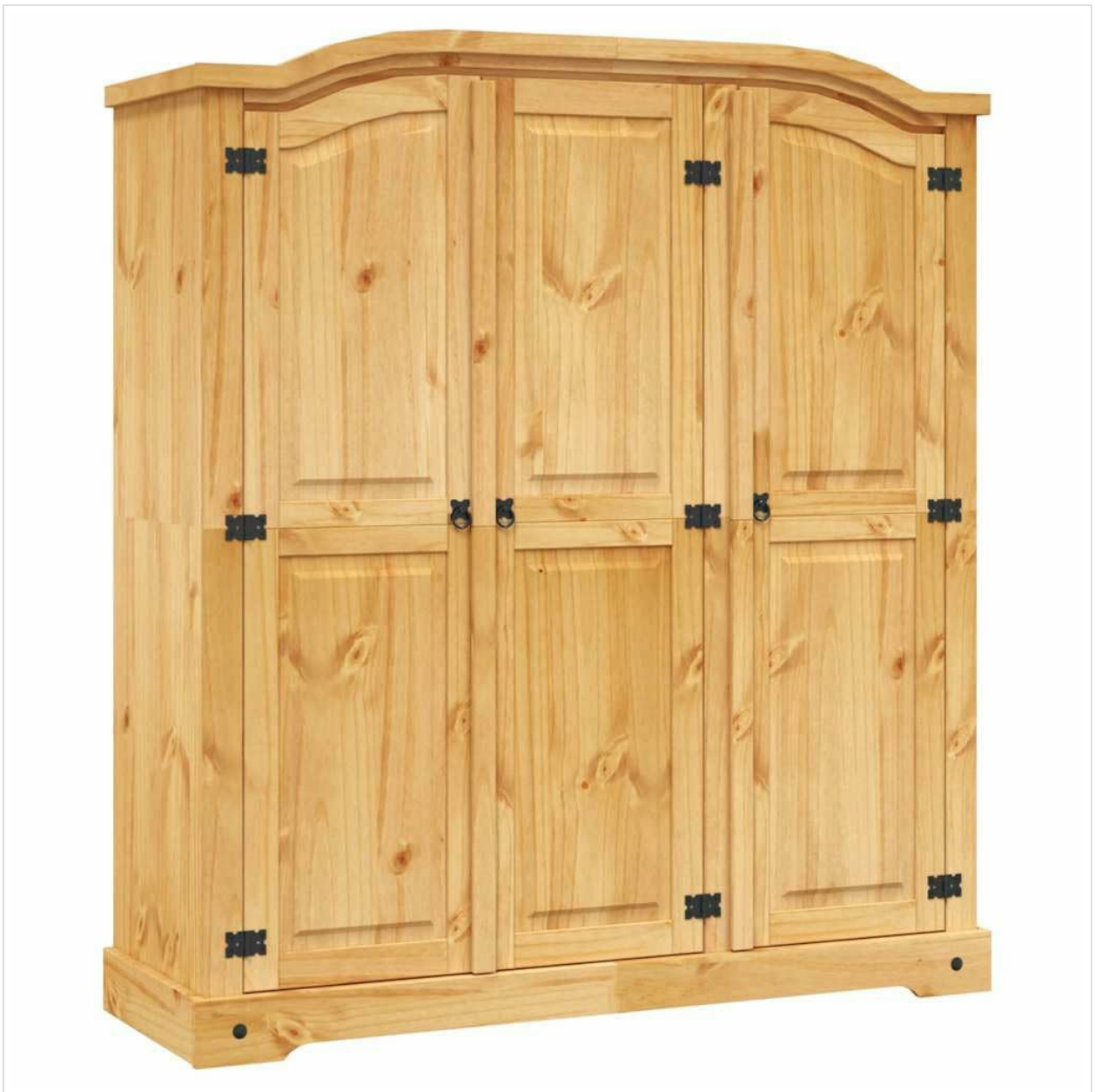
Image: Front view of the vidaXL Corona Range Mexican Pine Wood 3-Door Wardrobe.