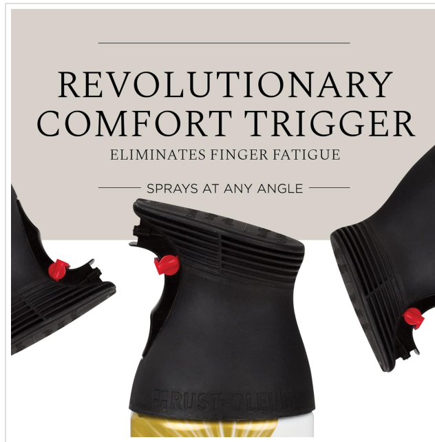
Image: The comfort trigger allows for spraying at any angle, including upside down.