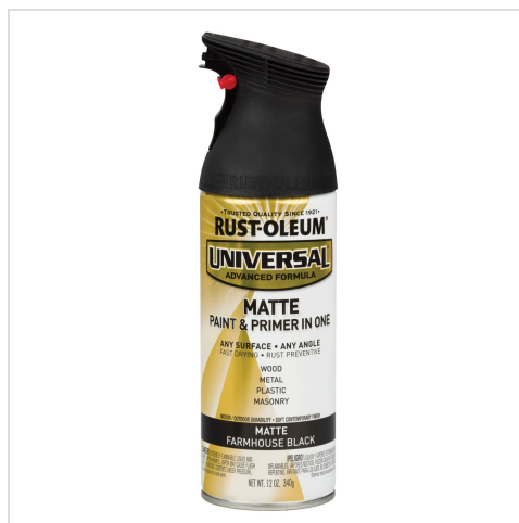
Image: Rust-Oleum Universal All Surface Spray Paint can in Matte Farmhouse Black.

Rust-Oleum Universal Paint and Primer in one is an all-surface paint designed for both interior and exterior applications. This oil-based formula provides long-lasting protection and durability, preventing rust and corrosion while resisting fading and chipping. The comfort grip trigger delivery system is engineered to reduce finger fatigue during continuous spraying, and the 'any angle' spray feature allows for application even upside down. This product is suitable for a wide range of surfaces including wood, plastic, metal, fiberglass, concrete, glass, wicker, and vinyl.