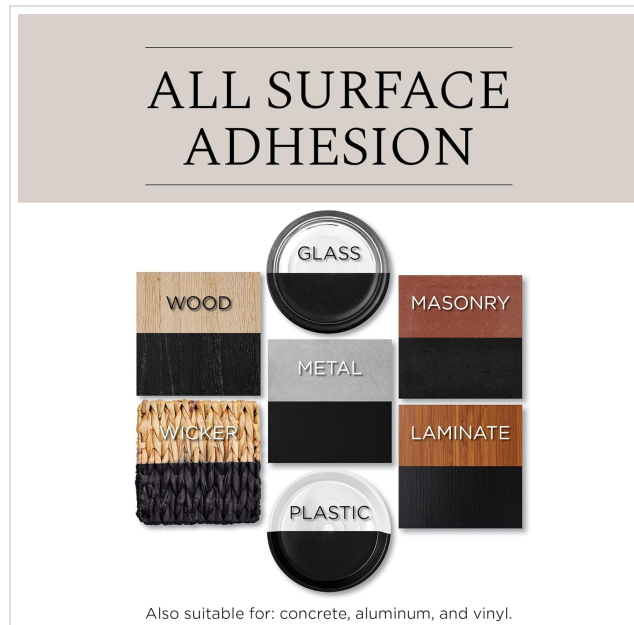
Image: Rust-Oleum Universal paint is compatible with various surfaces including wood, metal, plastic, and masonry.