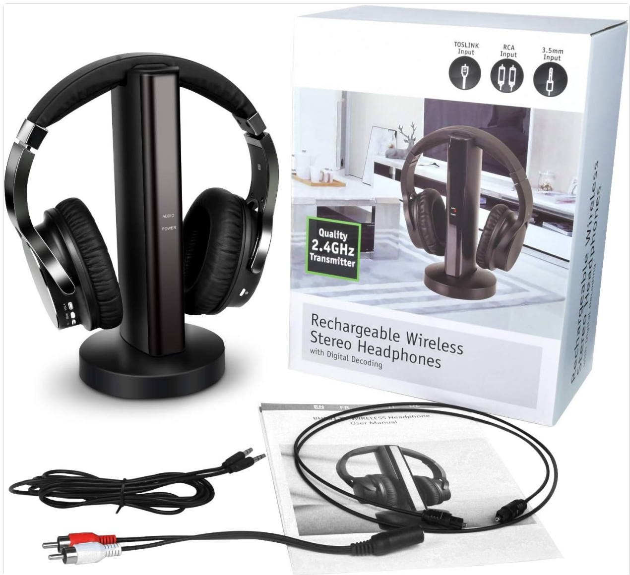
Image: Rybozen BH061 Wireless TV Headphones, transmitter, various cables, and user manual.