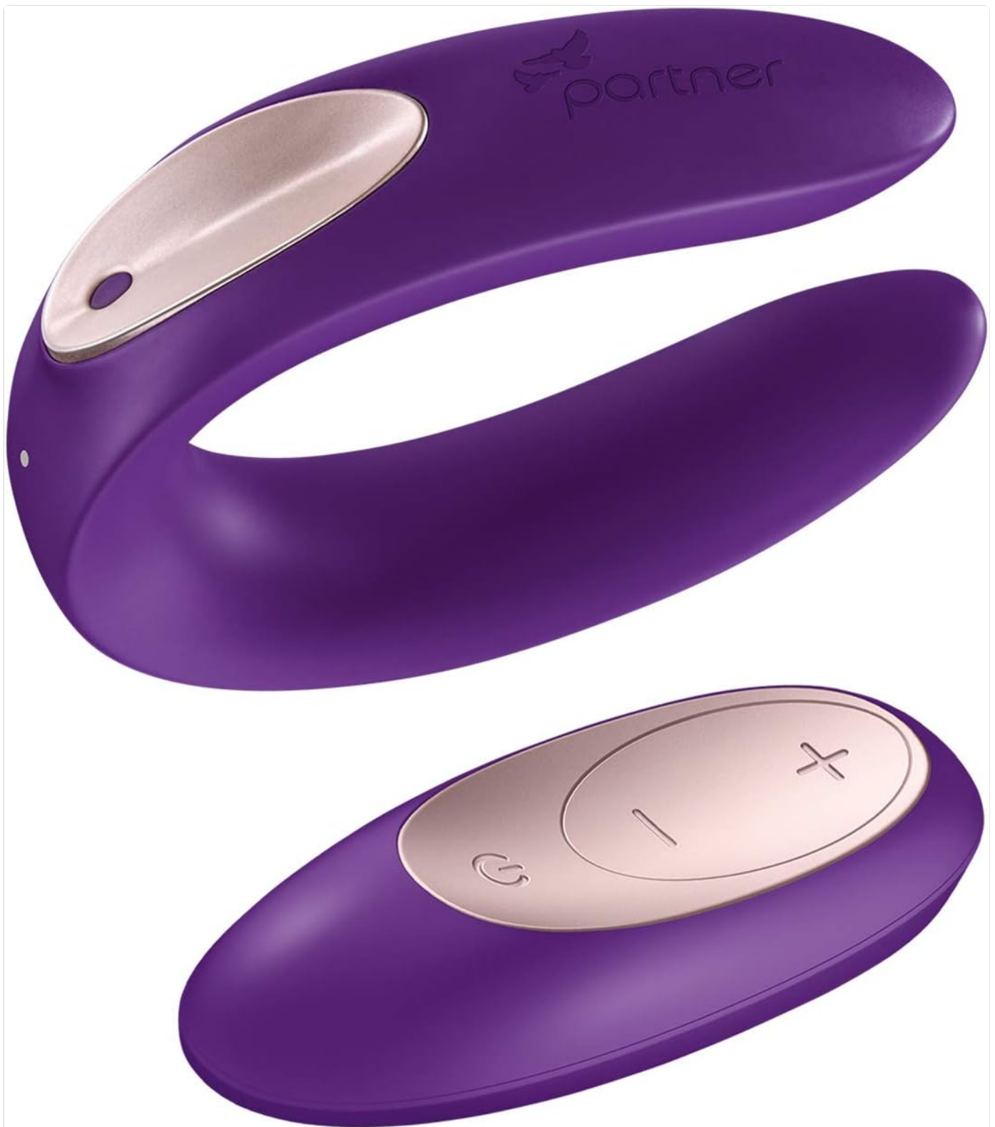
Image 1.1: The Satisfyer Double Plus Remote vibrator and its accompanying wireless remote control.