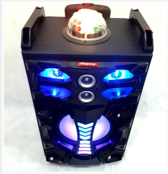
Figure 3: Top view of the speaker, showing the integrated LED globe for party lighting effects.

Bluetooth Speaker, highlighting the 10-inch subwoofer and dual tweeters.