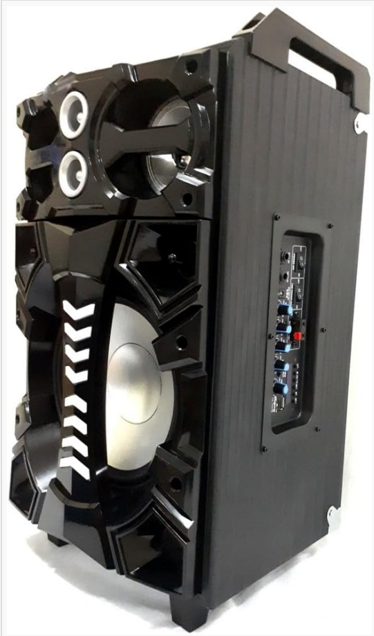
Figure 1: Side view of the Ridgeway QS-1037B Bluetooth Speaker, showcasing its robust design and side control panel.