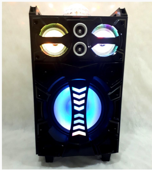
Figure 4: Front view of the speaker with its dynamic LED lights illuminated, showcasing various color patterns.