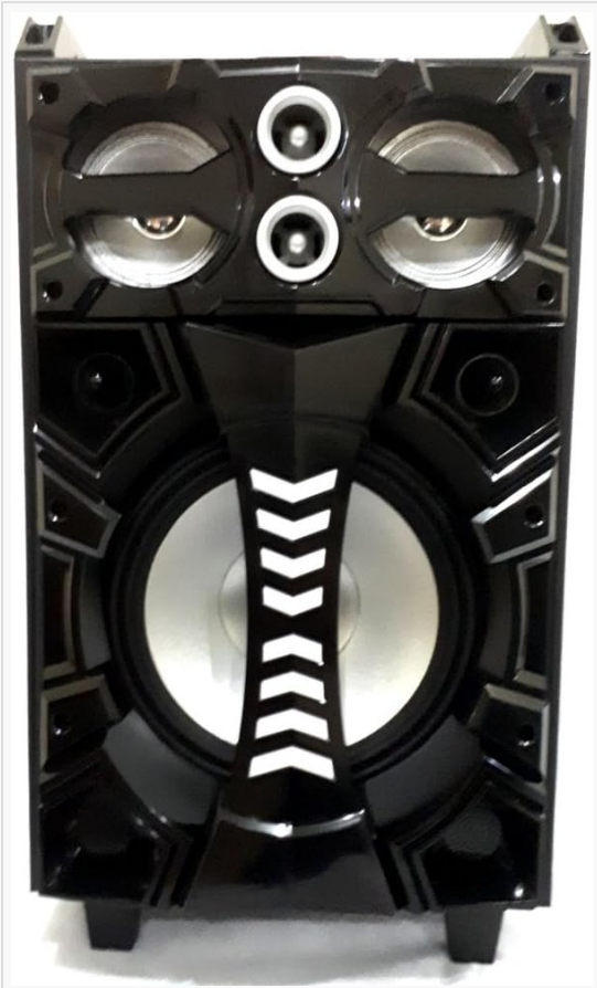
Figure 2: Front view of the Ridgeway QS-1037B