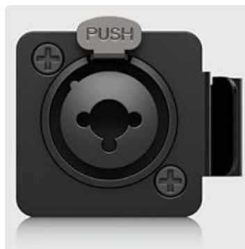
Image: Close-up of the locking XLR / TRS combo input on the Behringer P2.