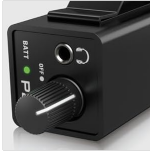
Image: The top of the Behringer P2, showing the volume control knob and battery indicator light.