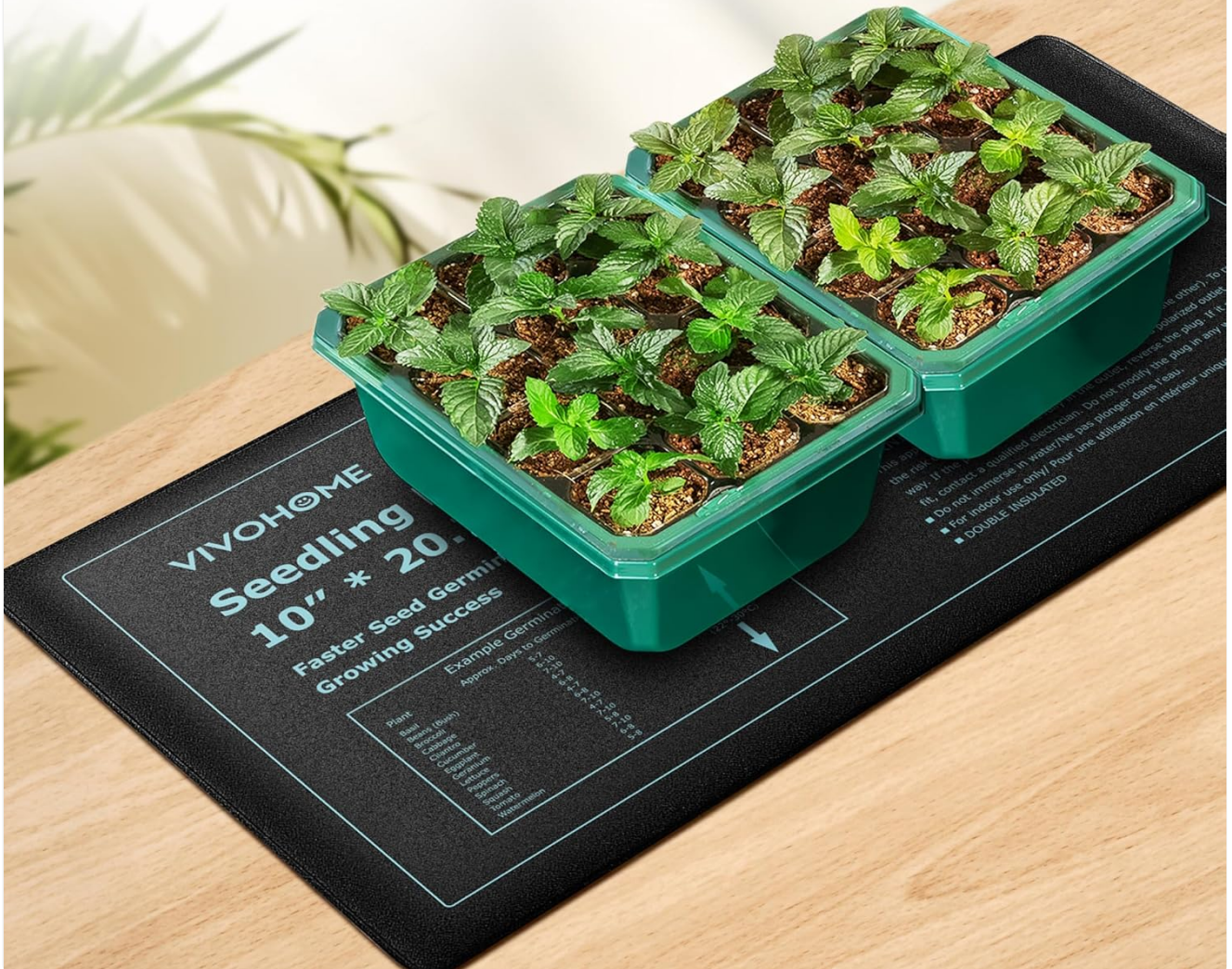
Image: Seedling trays placed on the heat mat for germination.