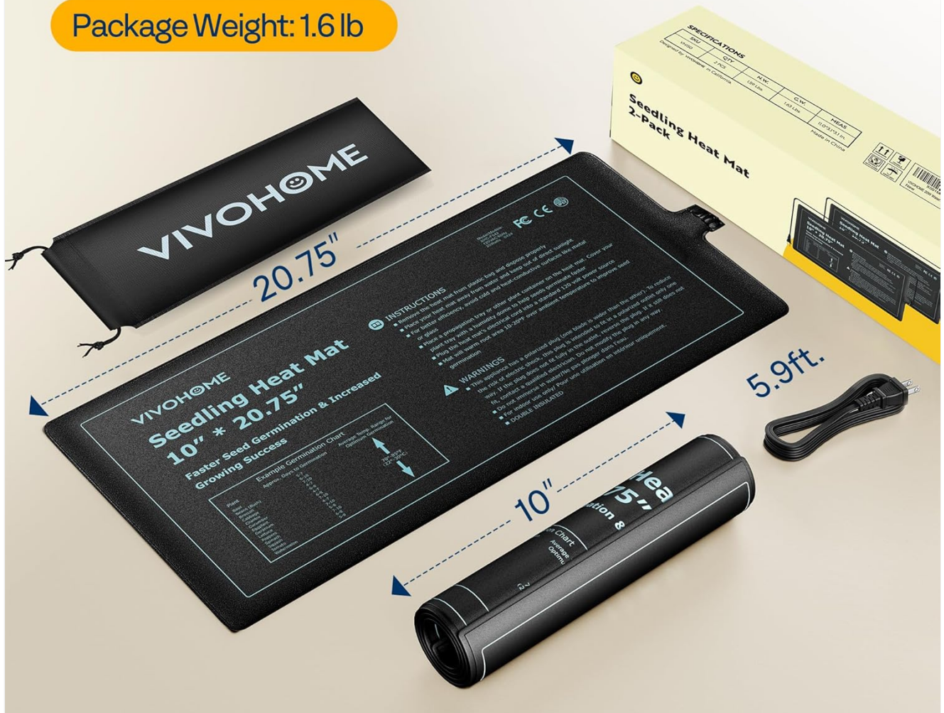
Image: Package contents including two heat mats, carrying bag, and packaging.