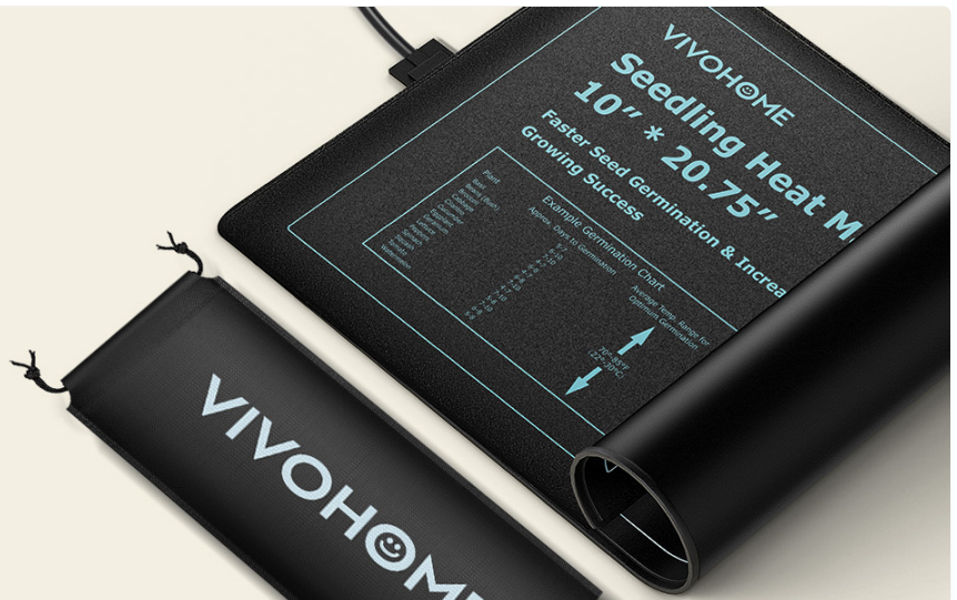
Image: Demonstrating how to easily roll up and store the heat mat in its carrying bag.

You can curl it into a strip and put it into the bag, which is space-saving and portable