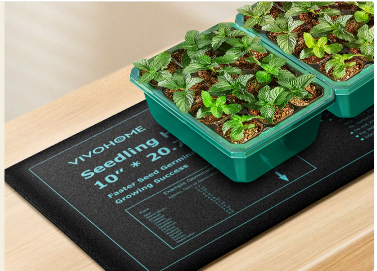
Image: Illustration of heat distribution and optimal temperature for germination.