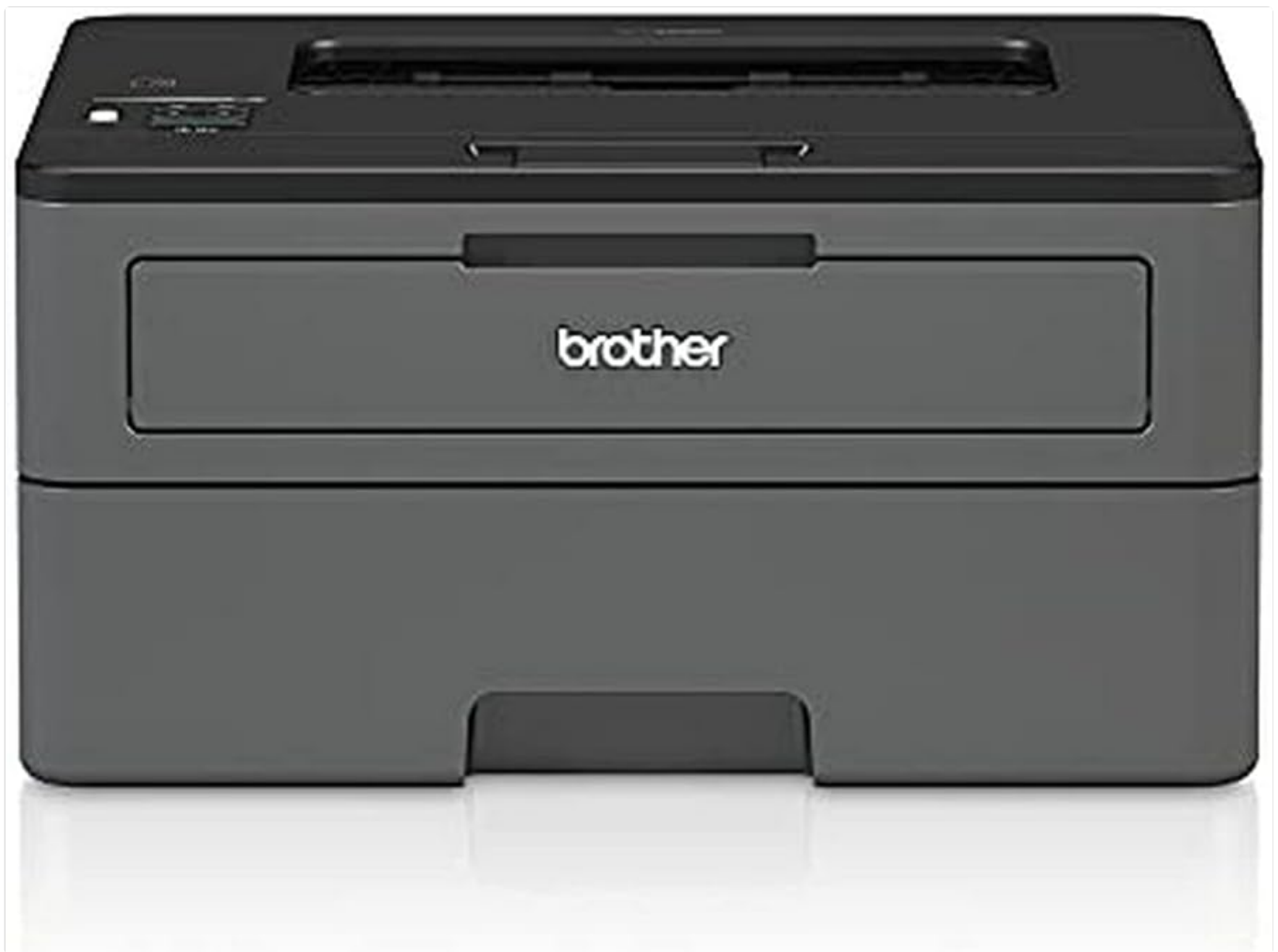
Figure 1: Front view of the Brother HL-L2375DW Monochrome Laser Printer, showcasing its compact design and paper tray.