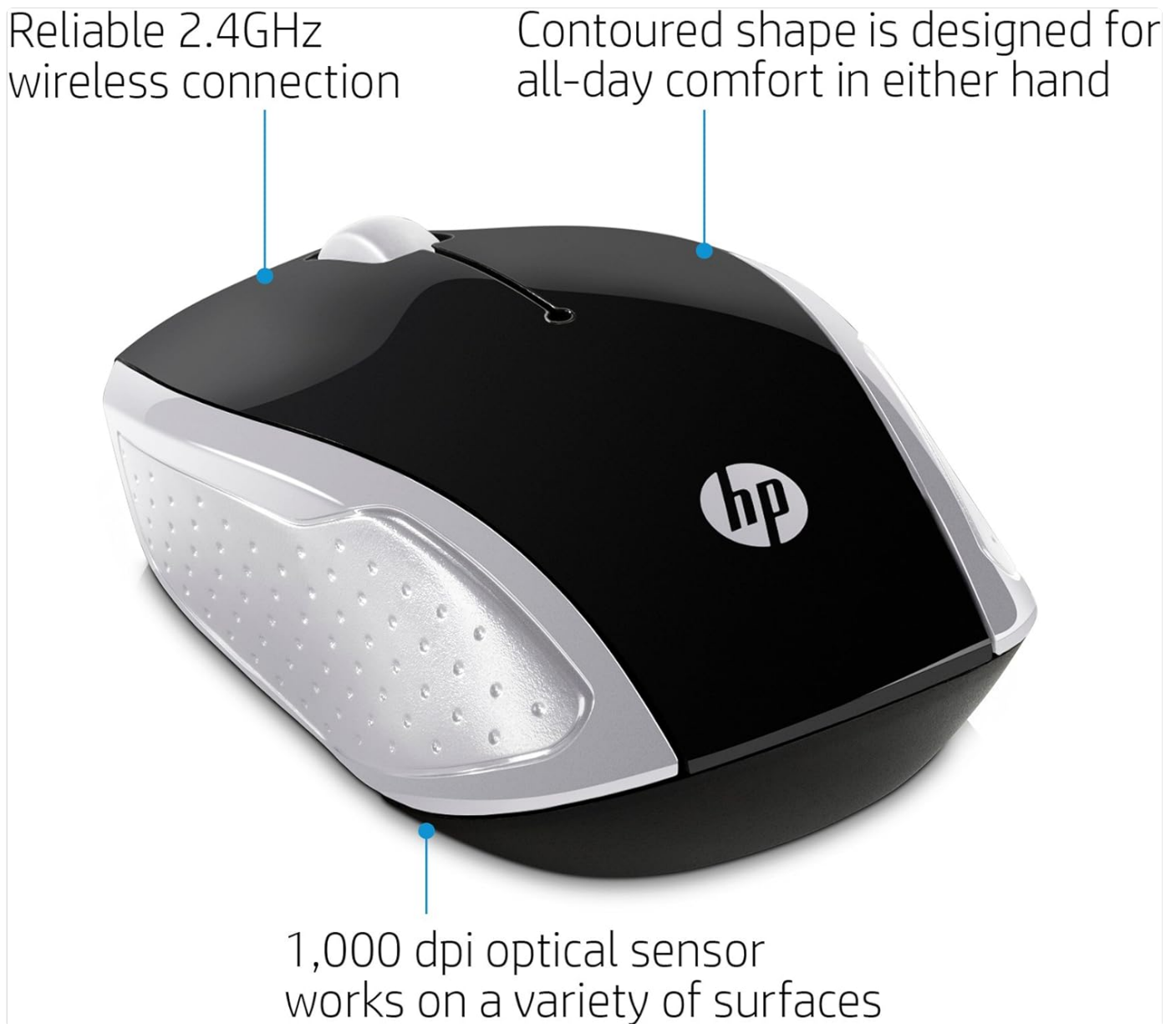
Figure 3: Ergonomic Design and Optical Sensor. This image emphasizes the comfortable, contoured shape suitable for both left and right-handed users, and the precision of the 1,000 DPI optical sensor.

The mouse features a contoured shape that fits comfortably in either hand, making it suitable for both left-handed and right-handed users. Its 1,000 DPI optical sensor provides accurate and responsive tracking on various surfaces.