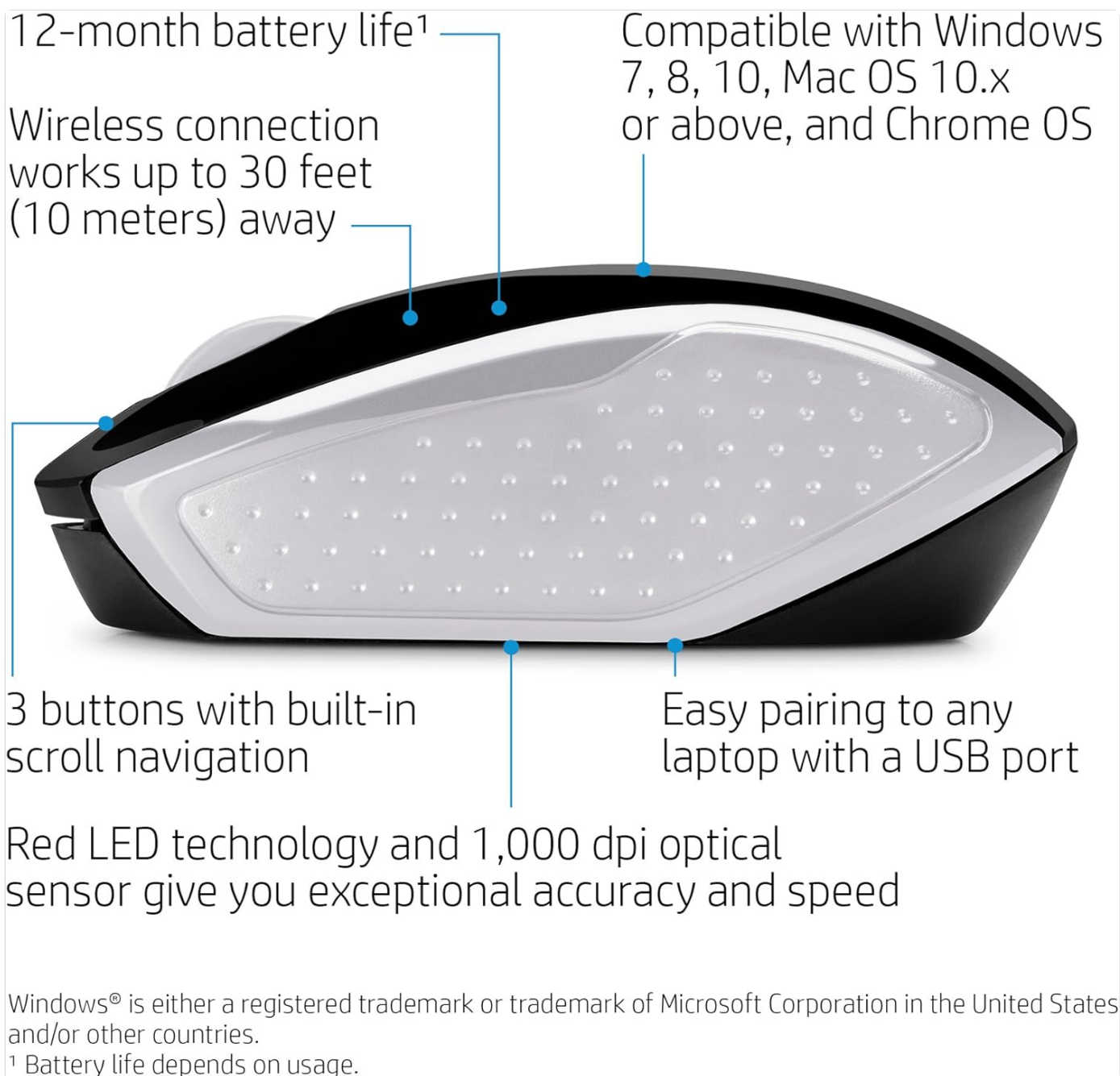
Figure 2: Key Features of the HP Wireless Mouse 200. This image illustrates the mouse's features such as battery life, wireless range, button layout, and operating system compatibility.

The HP Wireless Mouse 200 is designed for intuitive navigation and control.