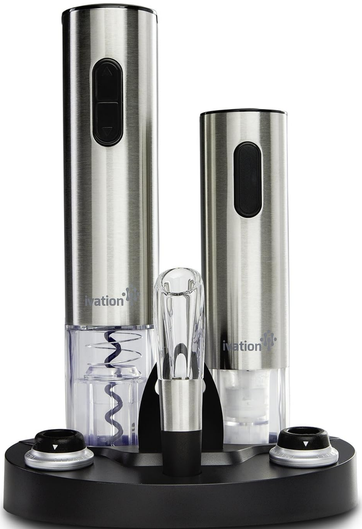
Figure 1: Ivation Electric Wine Gift Set

The Ivation Electric Wine Gift Set includes an electric corkscrew, a vacuum preserver, two wine stoppers, a wine aerator/pourer, a foil cutter, and a blue LED charging base. Each component is crafted for ease of use and durability.