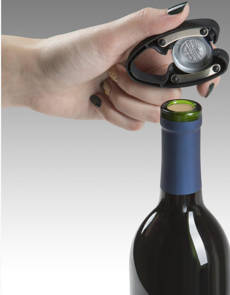
Figure 3: Using the Foil Cutter