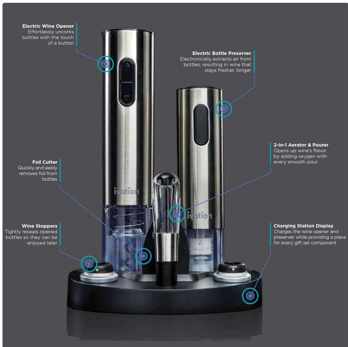
Figure 2: Labeled components of the Ivation Electric Wine Gift Set