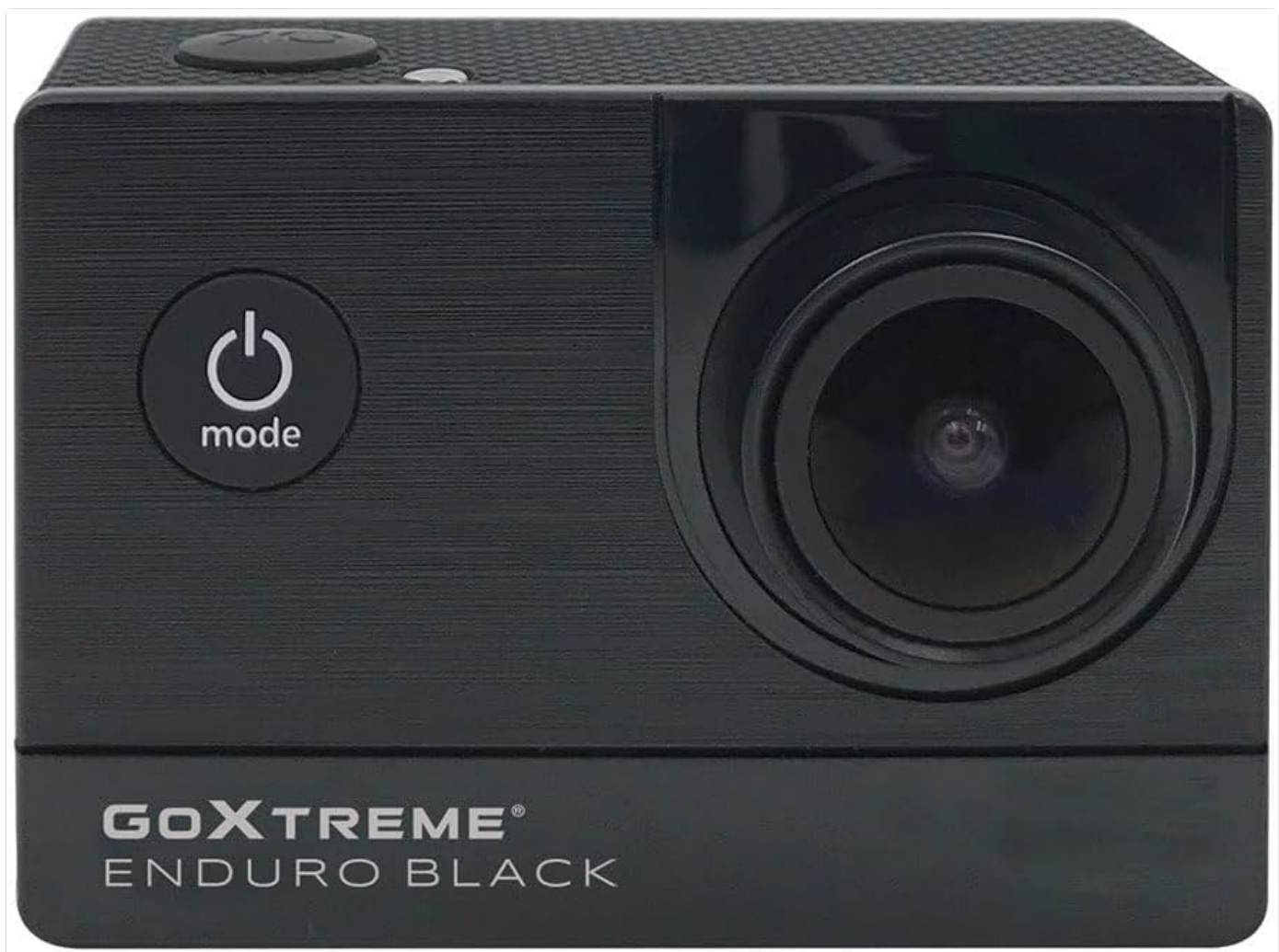
Figure 4.1: Front of GoXtreme Enduro Black Camera (without case).

This image provides a clear front view of the GoXtreme Enduro Black action camera itself, removed from its waterproof housing. The prominent lens is on the right, and the power/mode button, marked with a power symbol and "mode" text, is on the left, indicating the primary control for operation.