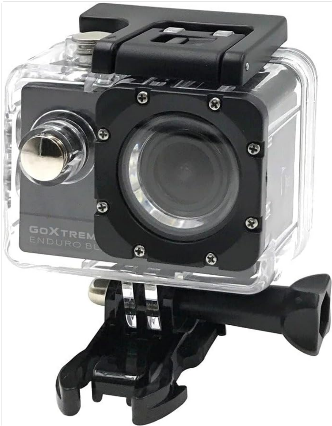
Figure 3.1: Camera in Waterproof Case with Mounting Bracket.

This image shows the GoXtreme Enduro Black action camera securely placed within its transparent waterproof housing. The integrated mounting bracket at the bottom of the case is clearly visible, demonstrating how the camera can be attached to various accessories like bike or helmet mounts.