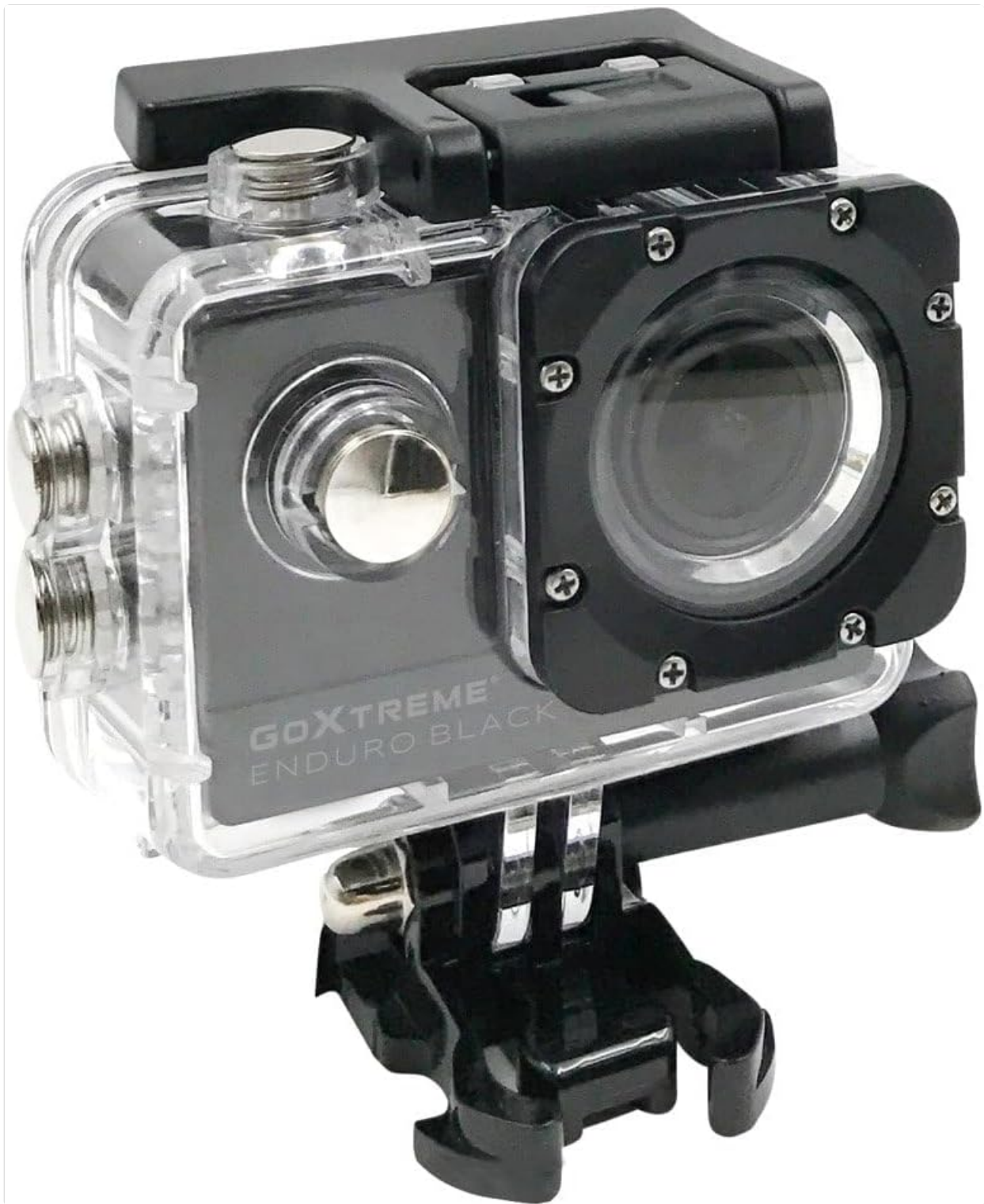
Figure 1.1: GoXtreme Enduro Black Action Camera with Waterproof Case.

This image displays the GoXtreme Enduro Black action camera encased in its transparent waterproof housing. The camera's black body is visible through the clear case, with the lens prominently featured on the front. Side buttons and the top latch of the housing are also visible, indicating its readiness for outdoor and underwater use.