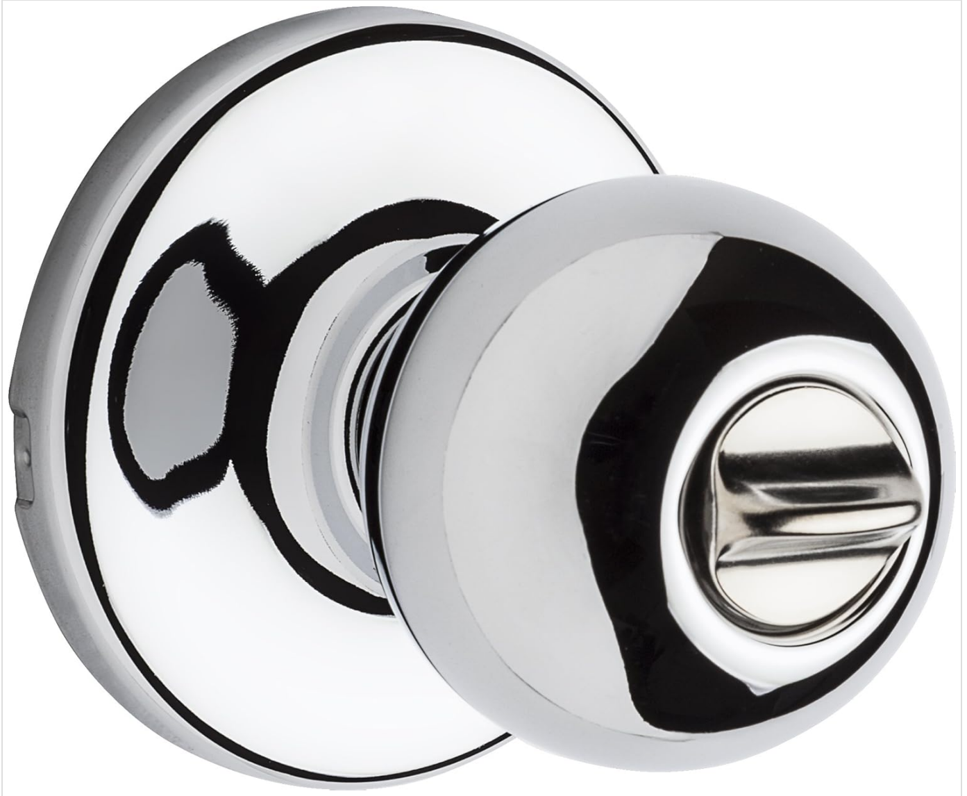
Image: All components included in the Kwikset Polo Interior Privacy Door Knob package.

Your browser does not support the video tag.