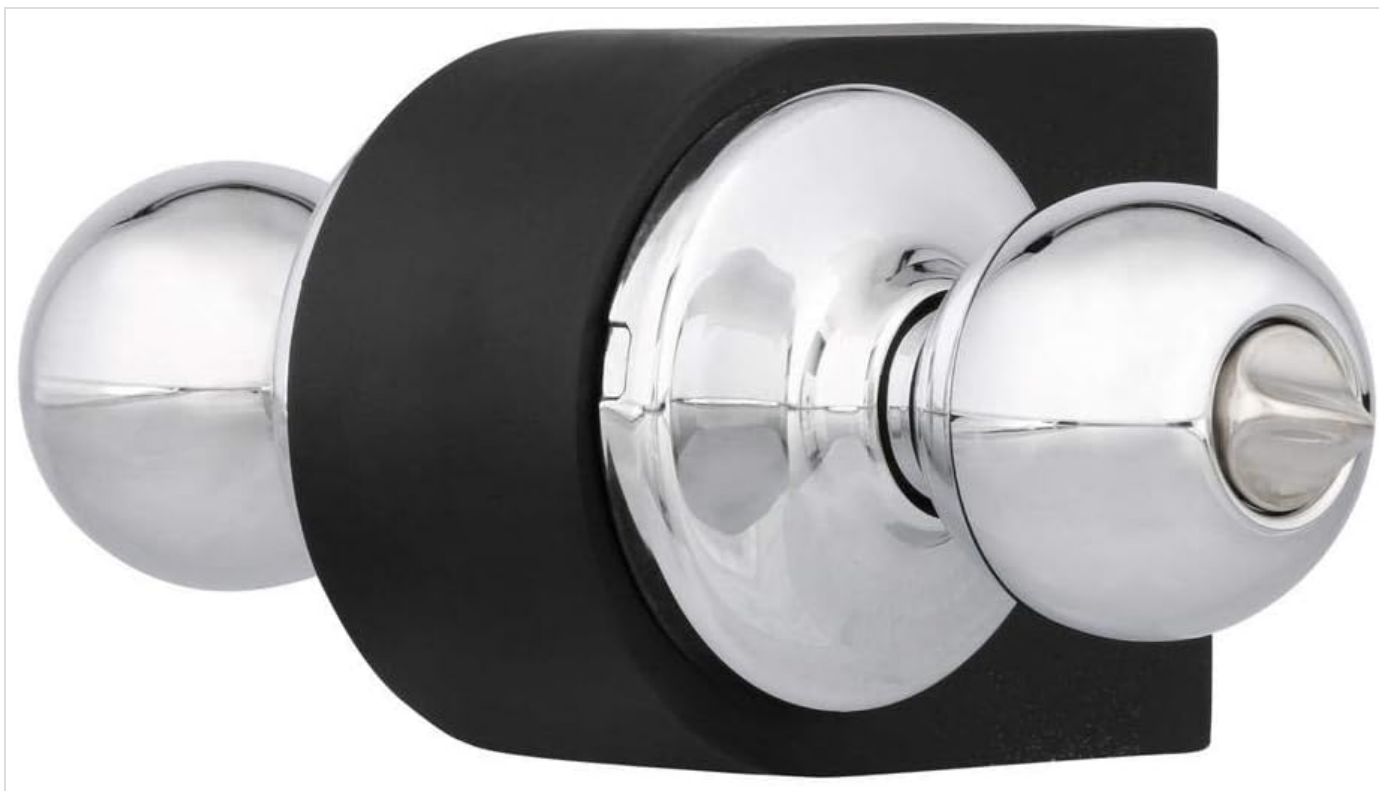
Image: Close-up of the interior knob showing the turn button for locking.