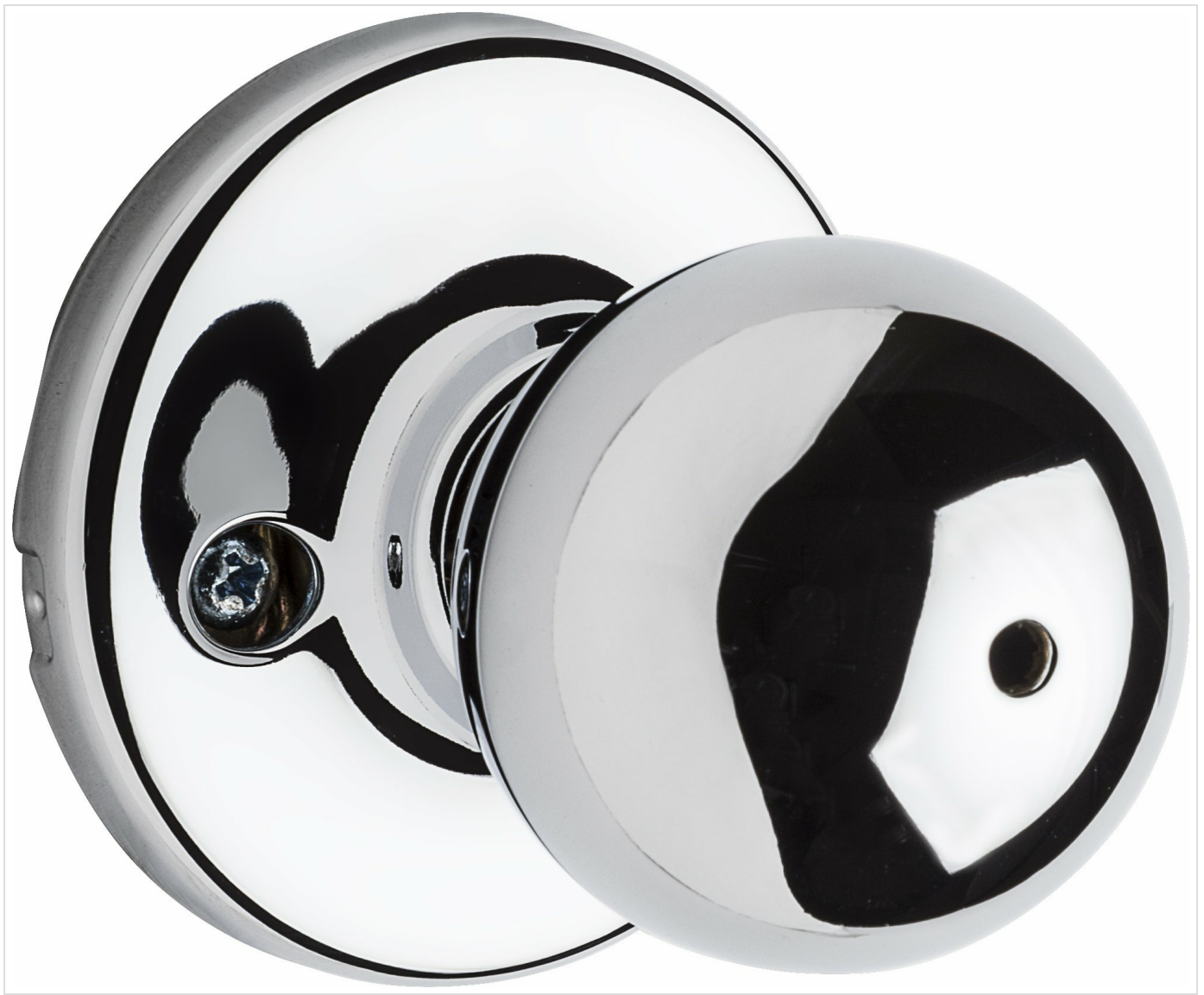
Image: Front view of the Kwikset Polo Interior Privacy Door Knob in polished chrome.