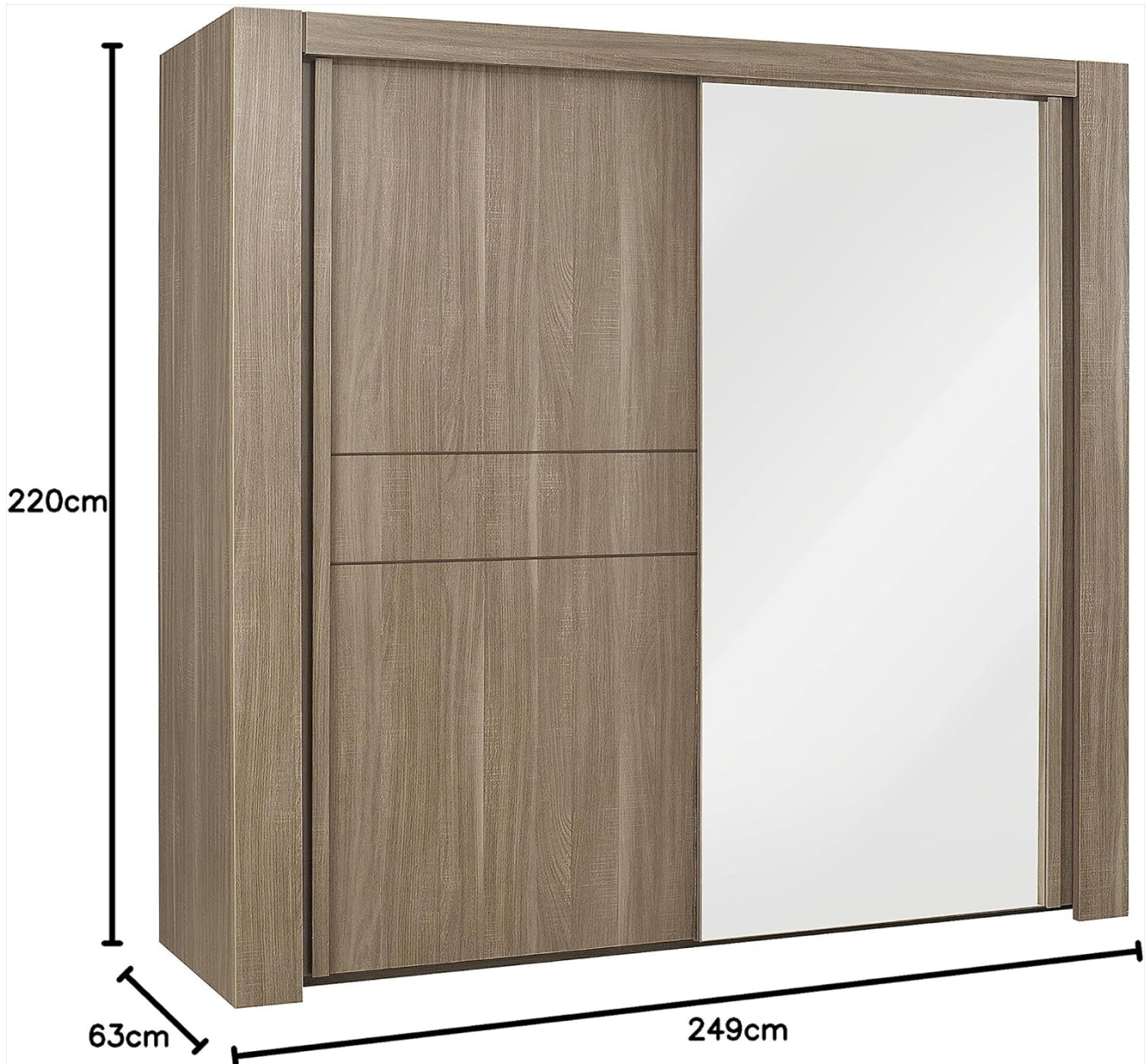
Figure 2: Dimensions of the Gami Moka H66250 wardrobe. The wardrobe measures 220 cm in height, 249 cm in width, and 63 cm in depth.