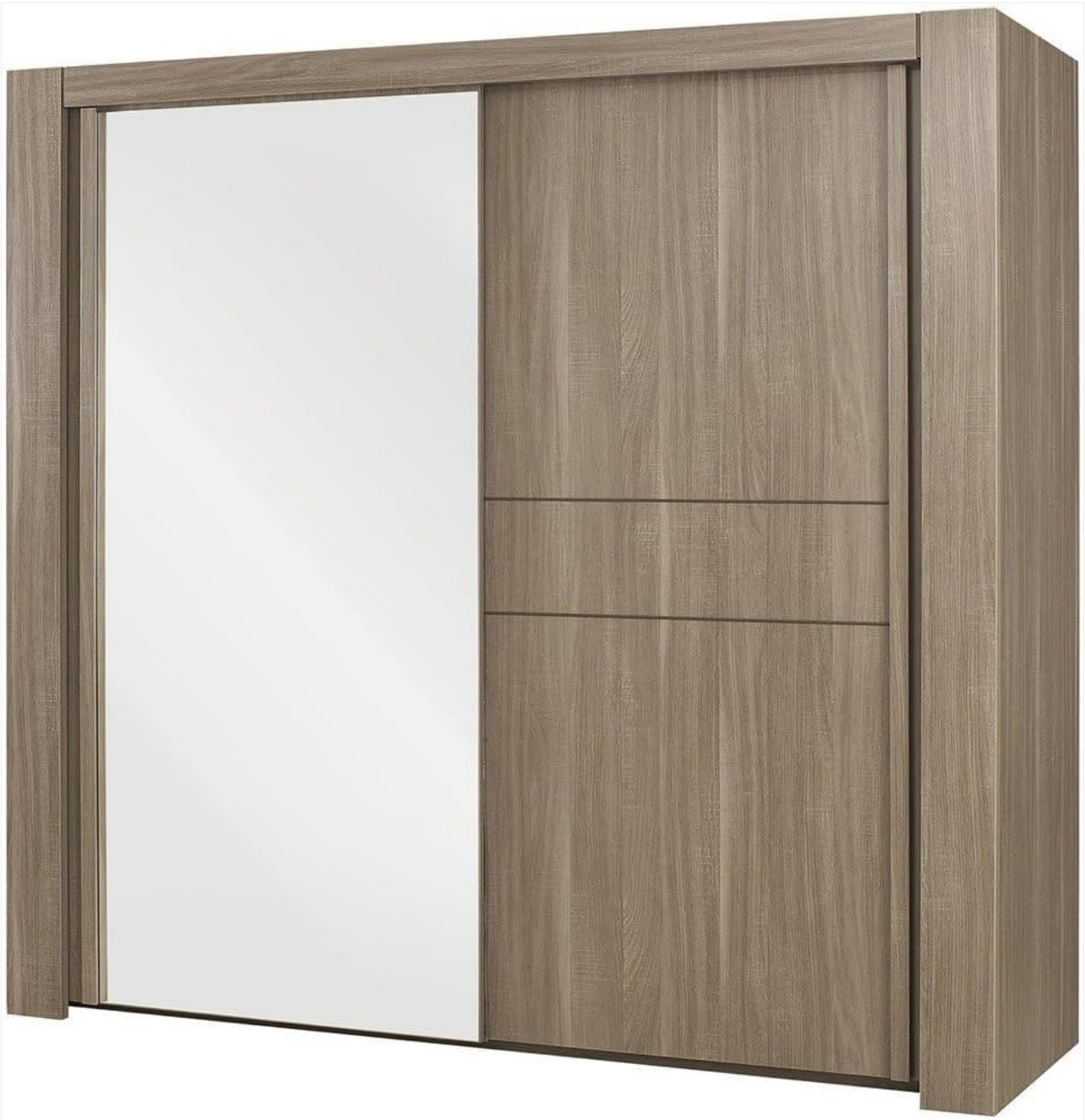
Figure 3: A view of the Gami Moka H66250 wardrobe, showcasing the mirrored door on the left side and the wood-finished doors on the right.