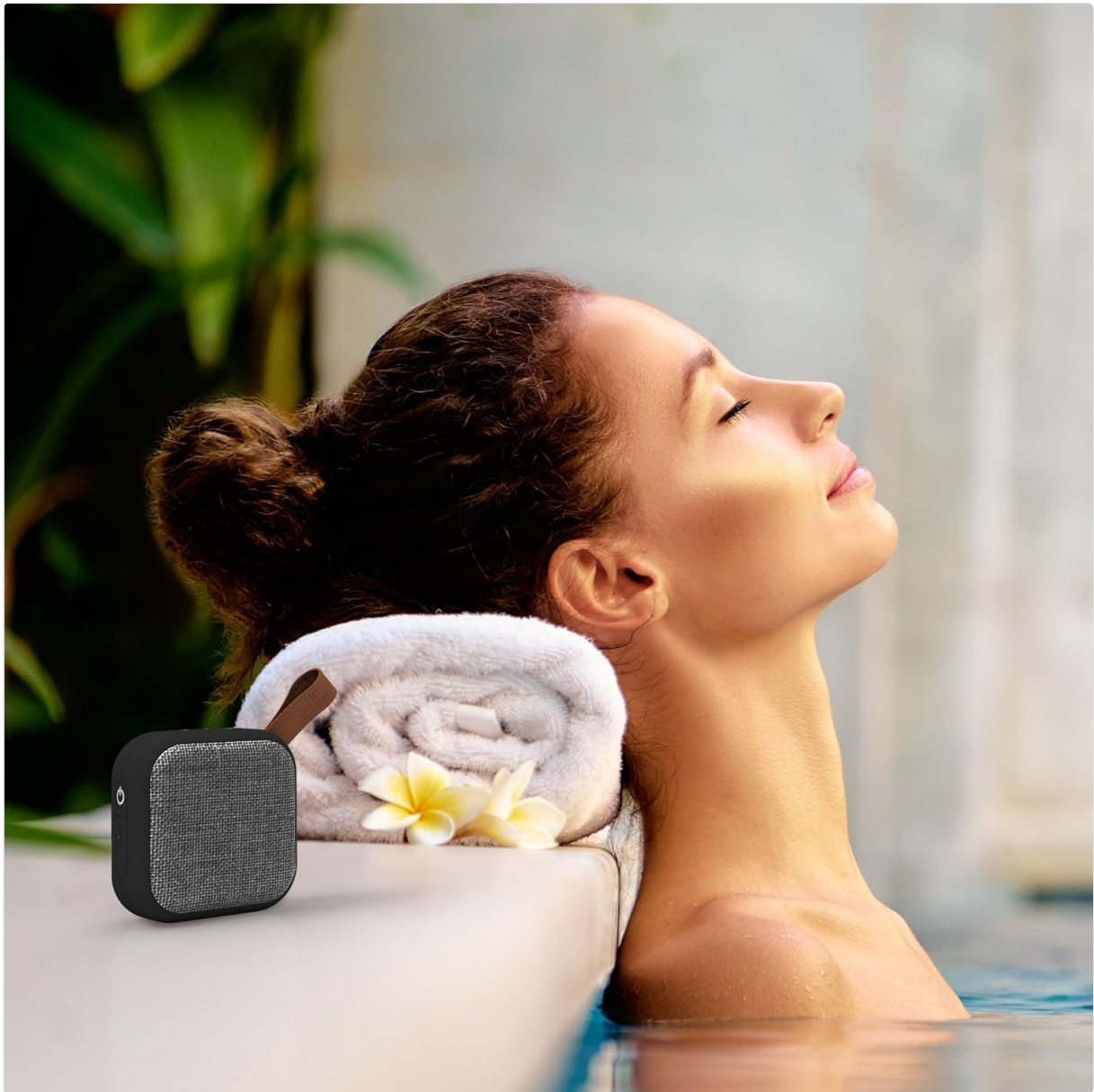
Figure 5: Speaker in a poolside environment. This image shows the speaker positioned near the edge of a pool, with a person relaxing in the background, illustrating its suitability for outdoor and water-adjacent use due to its waterproof design.