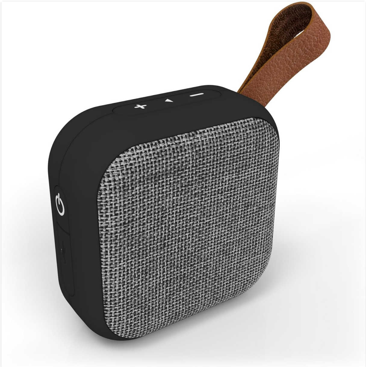
Figure 1: Tzumi Studio Series Speaker. This image displays the speaker's compact, square design with a grey fabric grille on the front and control buttons on the top edge. A brown leather strap is visible on the side.

Familiarize yourself with the various parts of your Tzumi Studio Series Speaker.