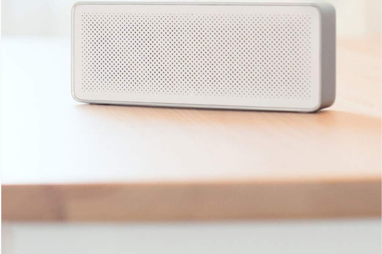
Figure 4.1: Front view of the Xiaomi Mi Bluetooth Speaker 2, showcasing its minimalist design and speaker grille. The silver frosted aluminum alloy box integrates seamlessly into various environments.

Support 10 hours of life, because the Mi Bluetooth Speaker 2 built-in polymer lithium battery, battery capacity of 1200mAh.