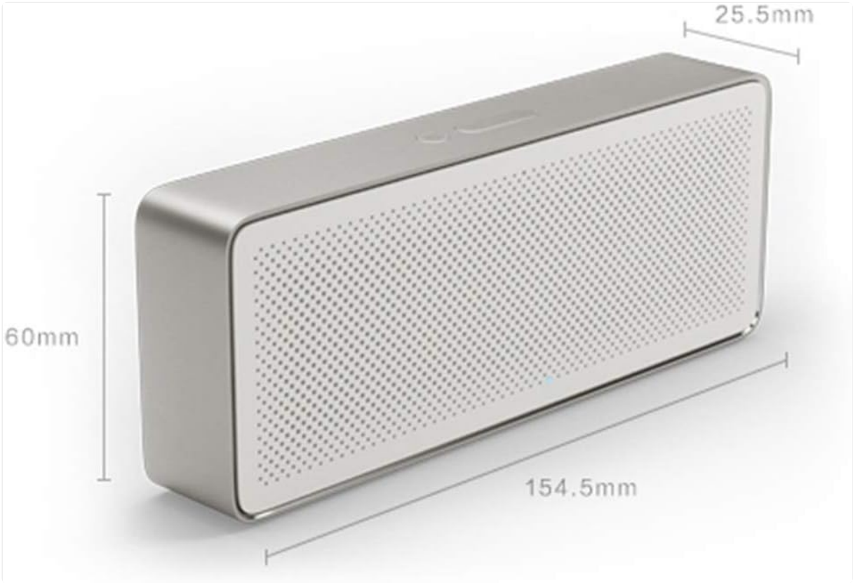
Figure 9.1: Detailed dimensions of the Xiaomi Mi Bluetooth Speaker 2: 154.5mm (length) x 60mm (width) x 25.5mm (height).