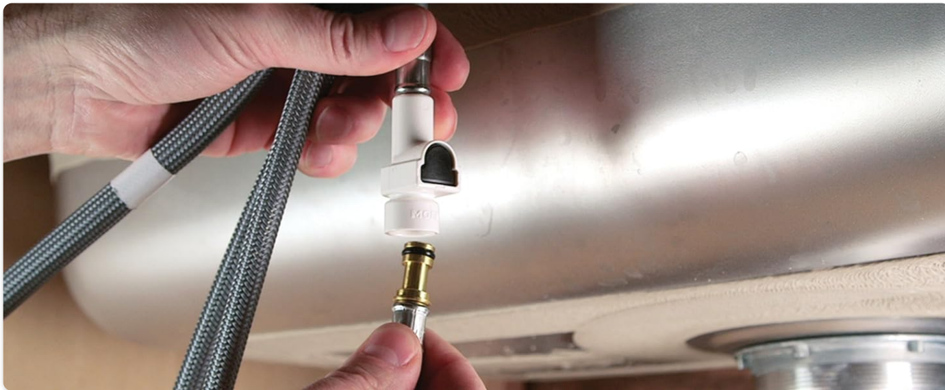
Image: A close-up view of the Duralock Quick Connect system, showing how easily the flexible supply lines snap into place for a secure and leak-free connection during installation.