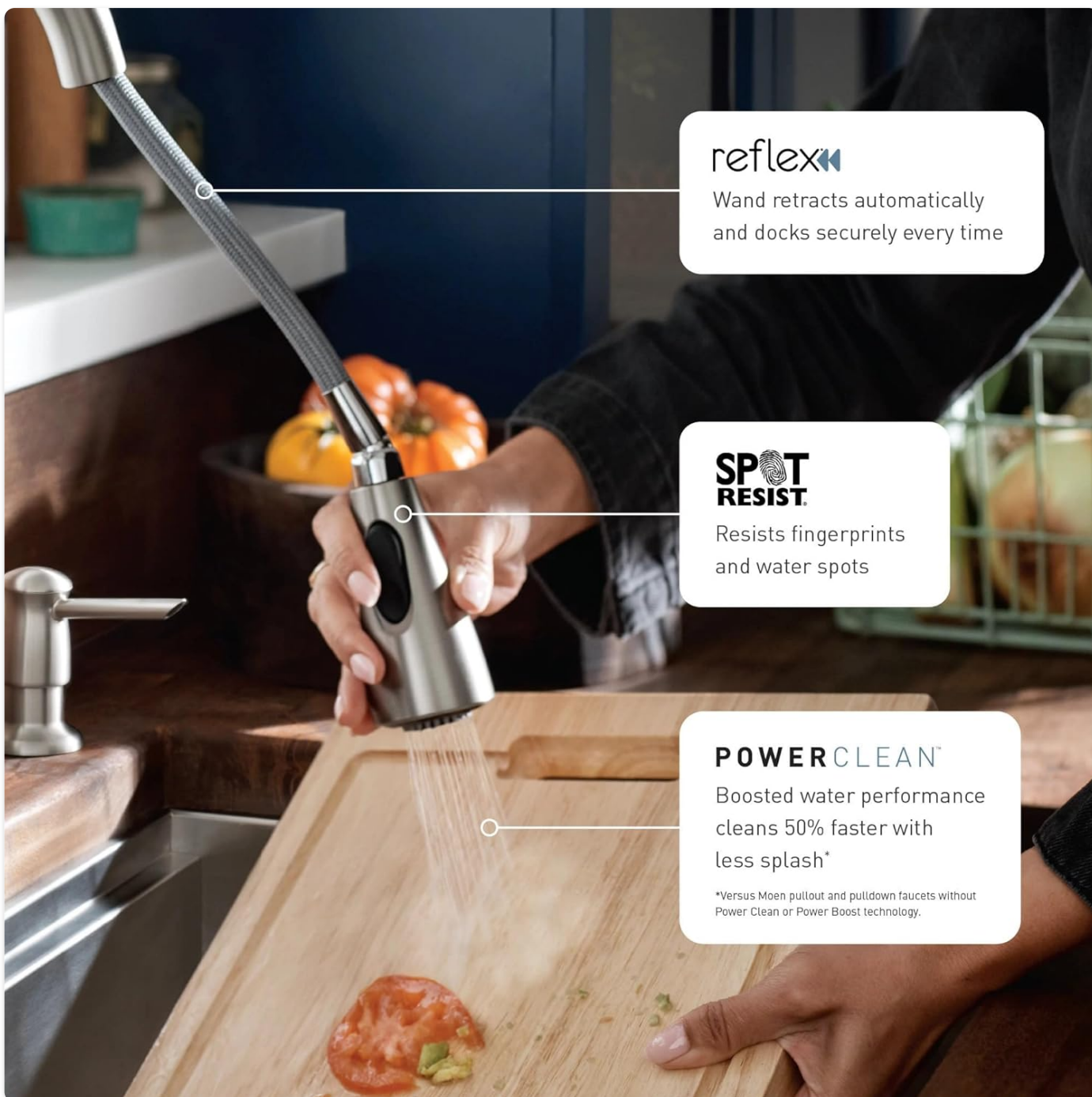
Image: A detailed diagram highlighting key features of the Moen Essie faucet, including the Reflex system for sprayer retraction, Spot Resist finish for easy cleaning, and Power Clean technology for enhanced spray power.