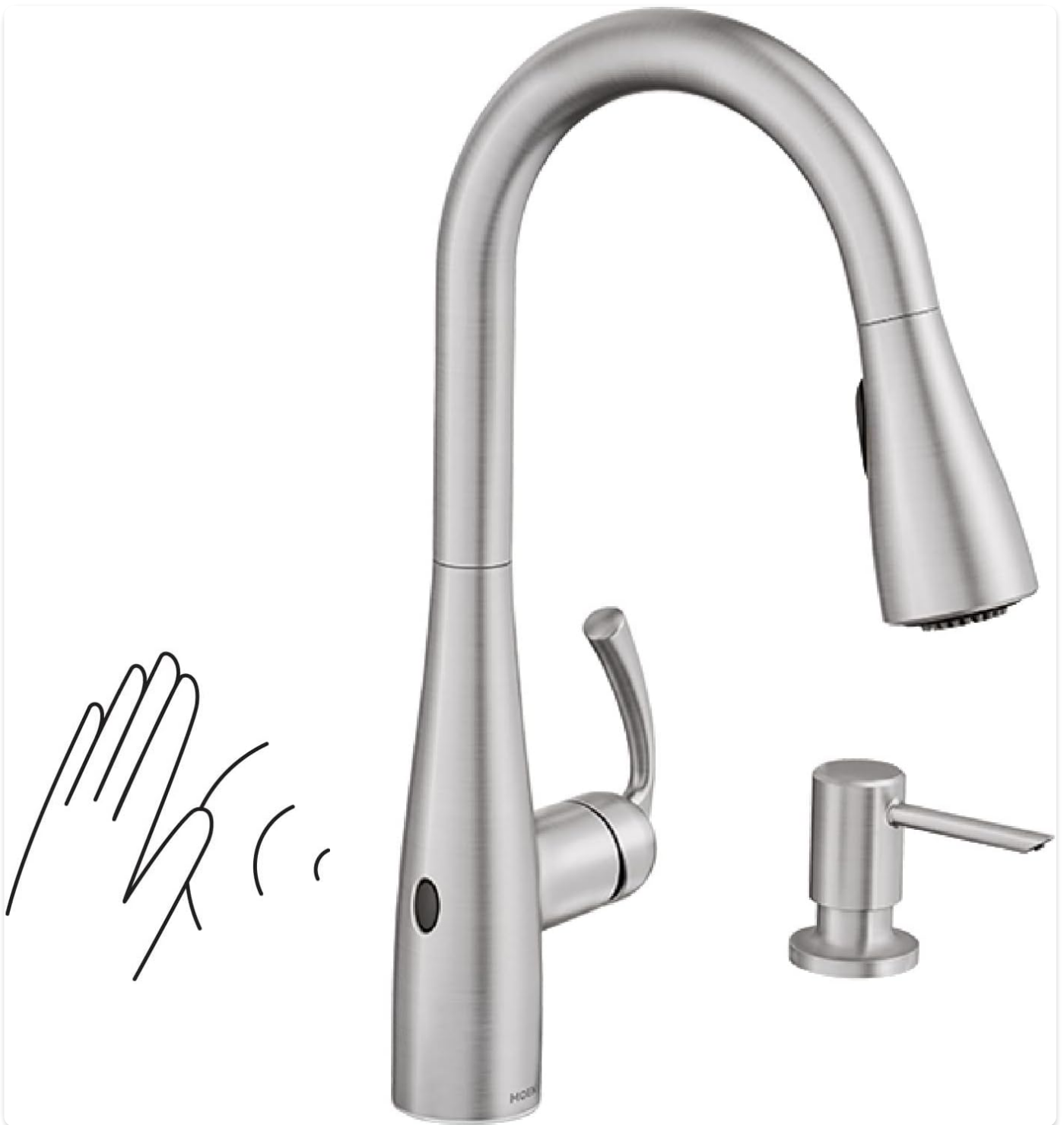
Image: The Moen Essie MotionSense Wave Kitchen Faucet in Spot Resist Stainless finish, featuring the main faucet unit with integrated sensor, a pull-down sprayer, and a matching soap dispenser. A hand icon indicates the touchless wave activation.