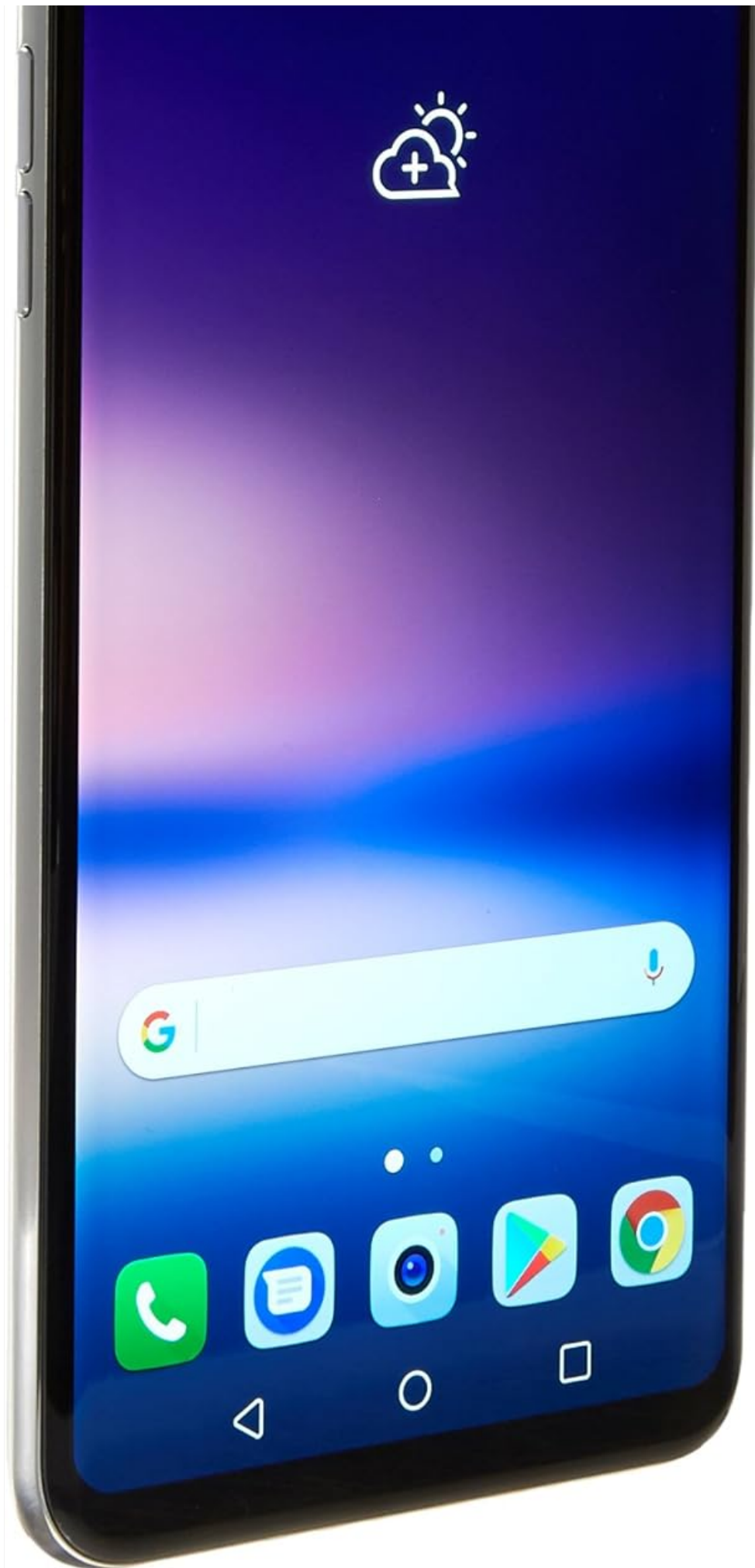
Image: Front view of the LG V30 US998 smartphone displaying its home screen with various application icons and a weather widget. The