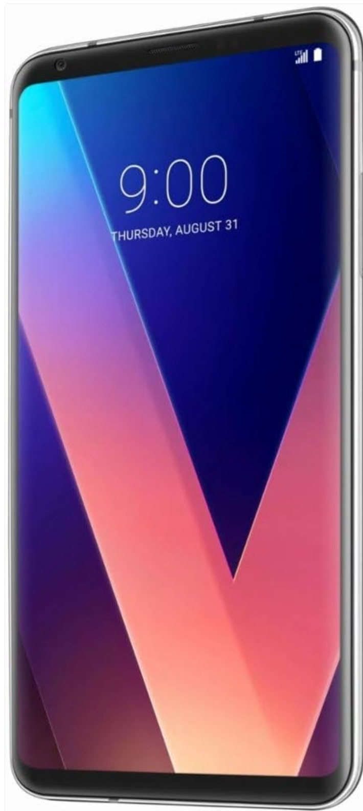
Image: Front view of the LG V30 US998 smartphone, showcasing its 6.0-inch OLED FullVision Display with minimal bezels. The screen displays a digital clock and date.