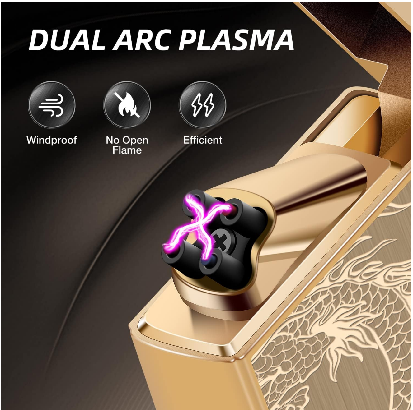
Figure 3: Dual Arc Plasma Technology

Your browser does not support the video tag.