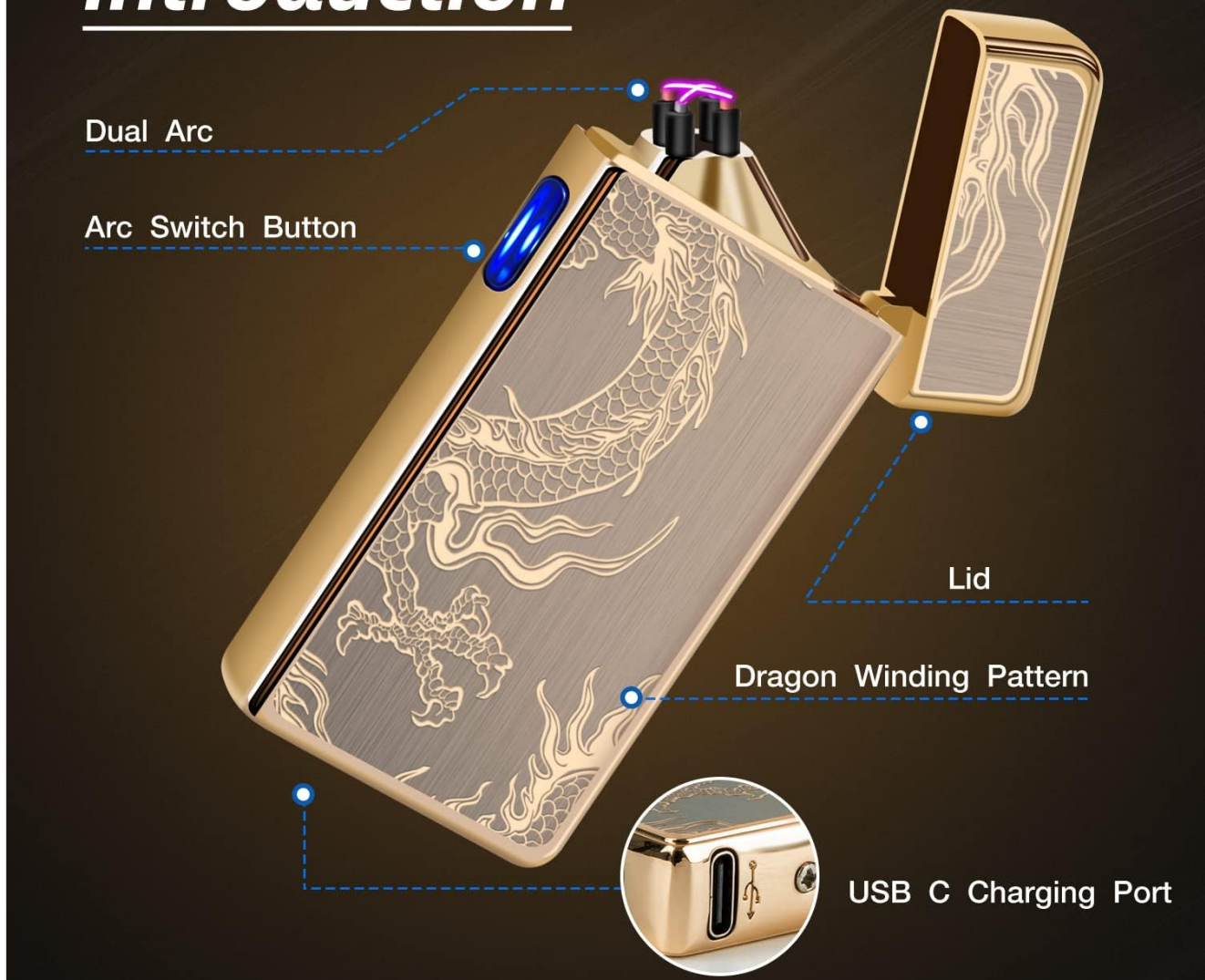
Figure 1: LcFun Electric USB Rechargeable Lighter Overview