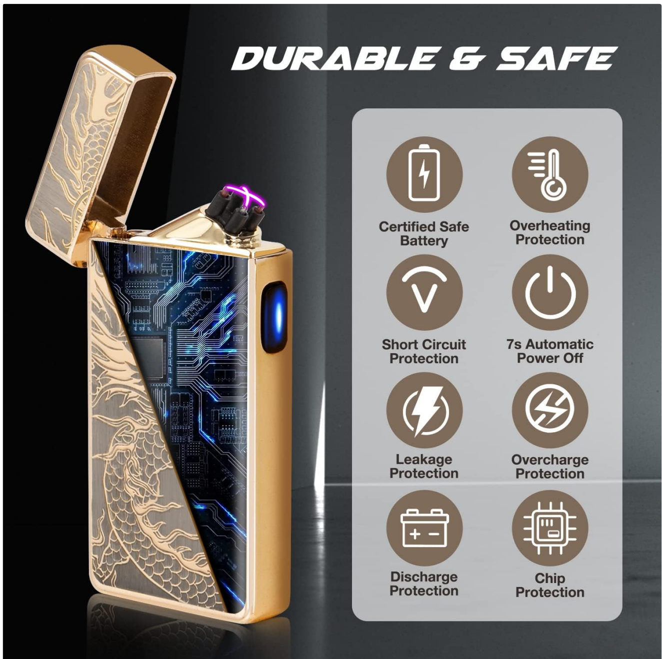
Figure 4: Safety and Durability Features