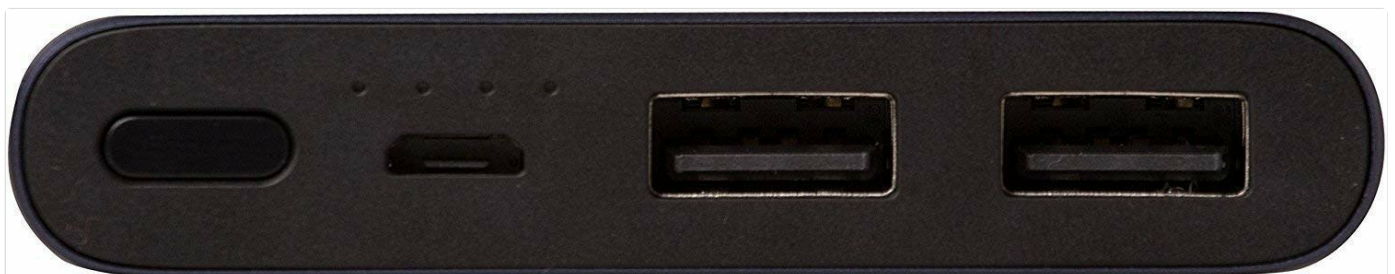
Figure 2: Top view showing the power button, Micro USB input port, and two USB-A output ports. Four LED indicators show battery level.