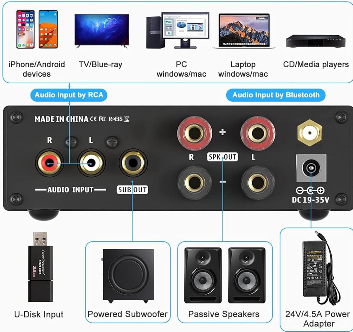
Image: A visual guide demonstrating the connection of passive speakers to the 'SPK OUT' terminals and a powered subwoofer to the 'SUB OUT' port on the BL20C amplifier.