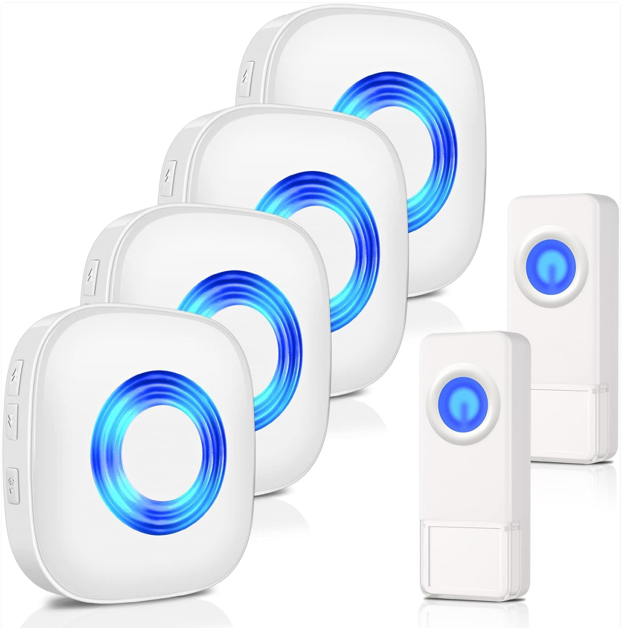
Image: Overview of the PHYSEN Wireless Doorbell System, showing two white push buttons and four white plug-in receivers with blue LED rings.