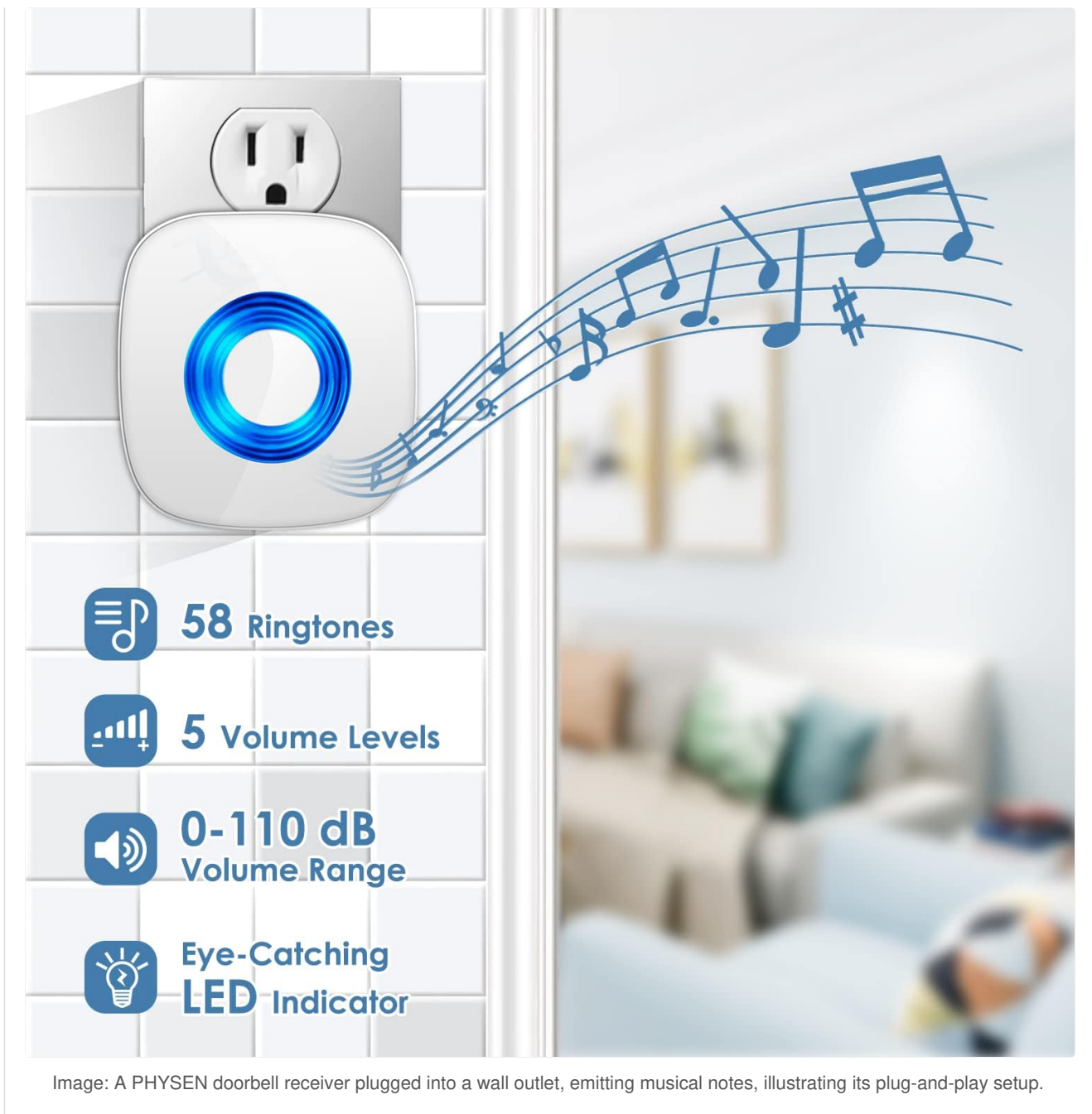
Image: A PHYSEN doorbell receiver plugged into a wall outlet, emitting musical notes, illustrating its plug-and-play setup.