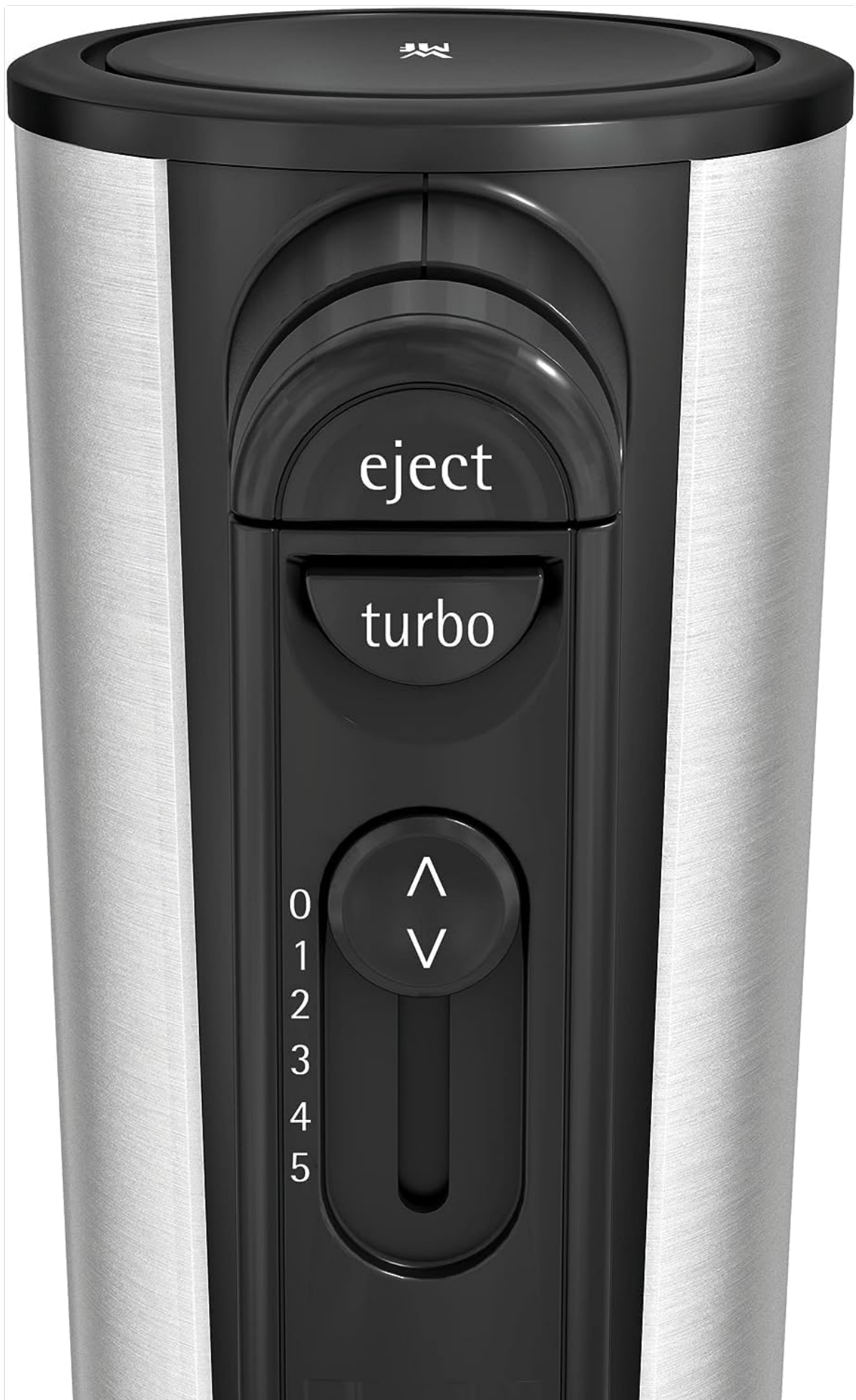
Image: Close-up of the 'eject' and 'turbo' buttons, located on the top of the mixer handle for easy access.