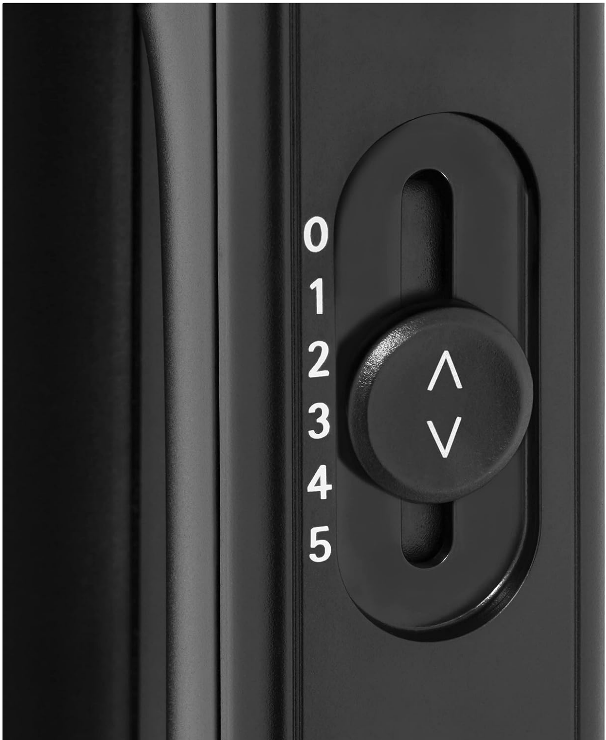
Image: Detailed view of the speed control slider, numbered 0 to 5, indicating different power levels.