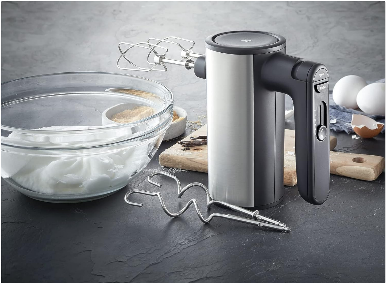
Image: WMF KULT X Hand Mixer with accessories and ingredients, illustrating its use in a kitchen setting.