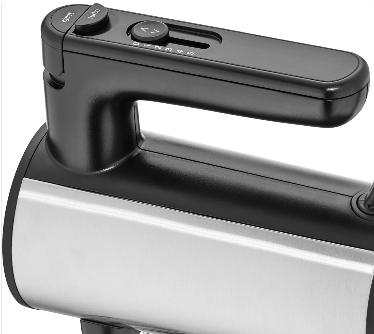
Image: Top view of the hand mixer, highlighting the speed control slider, turbo button, and eject button for easy identification.