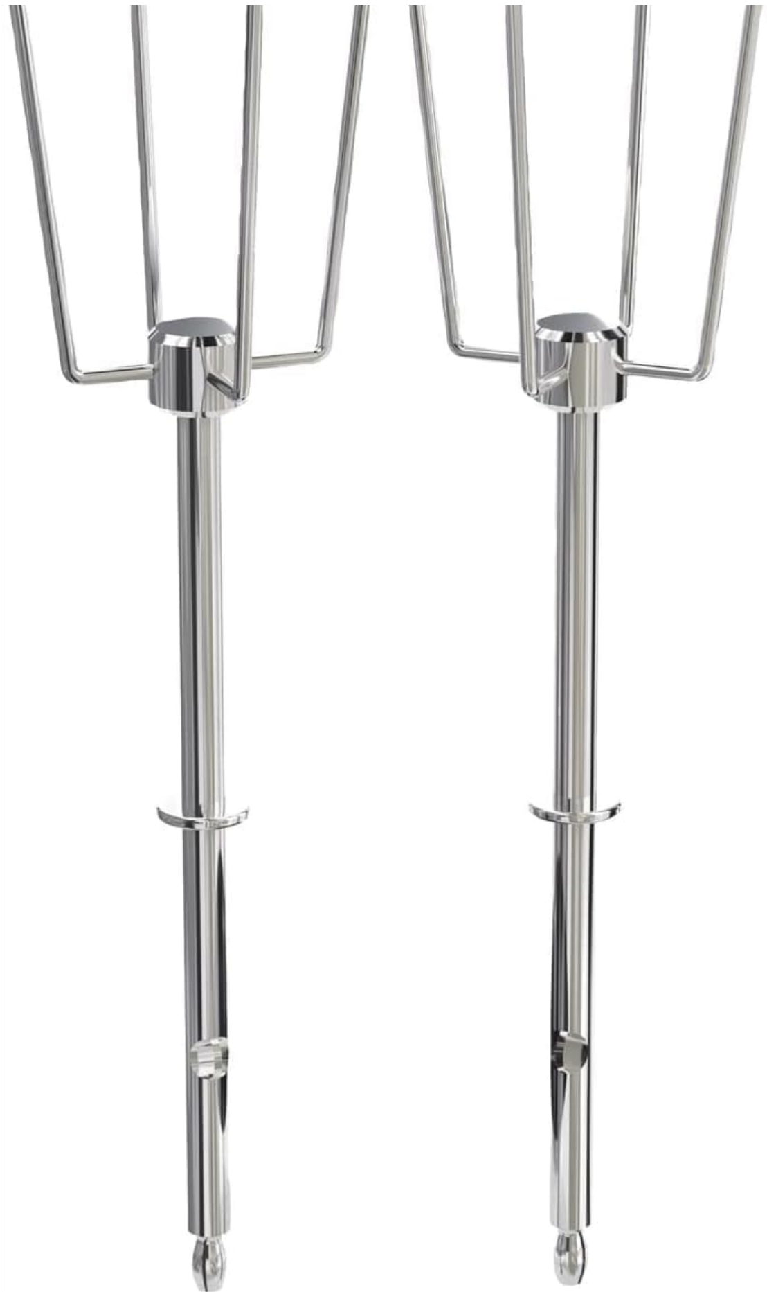
Image: Close-up of the two whisk beaters, ready for insertion into the hand mixer.